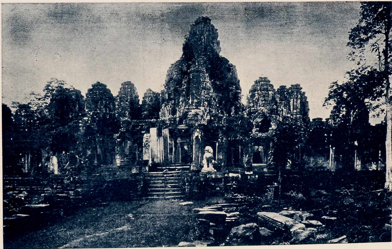
THE BAYON (a Çiva temple)