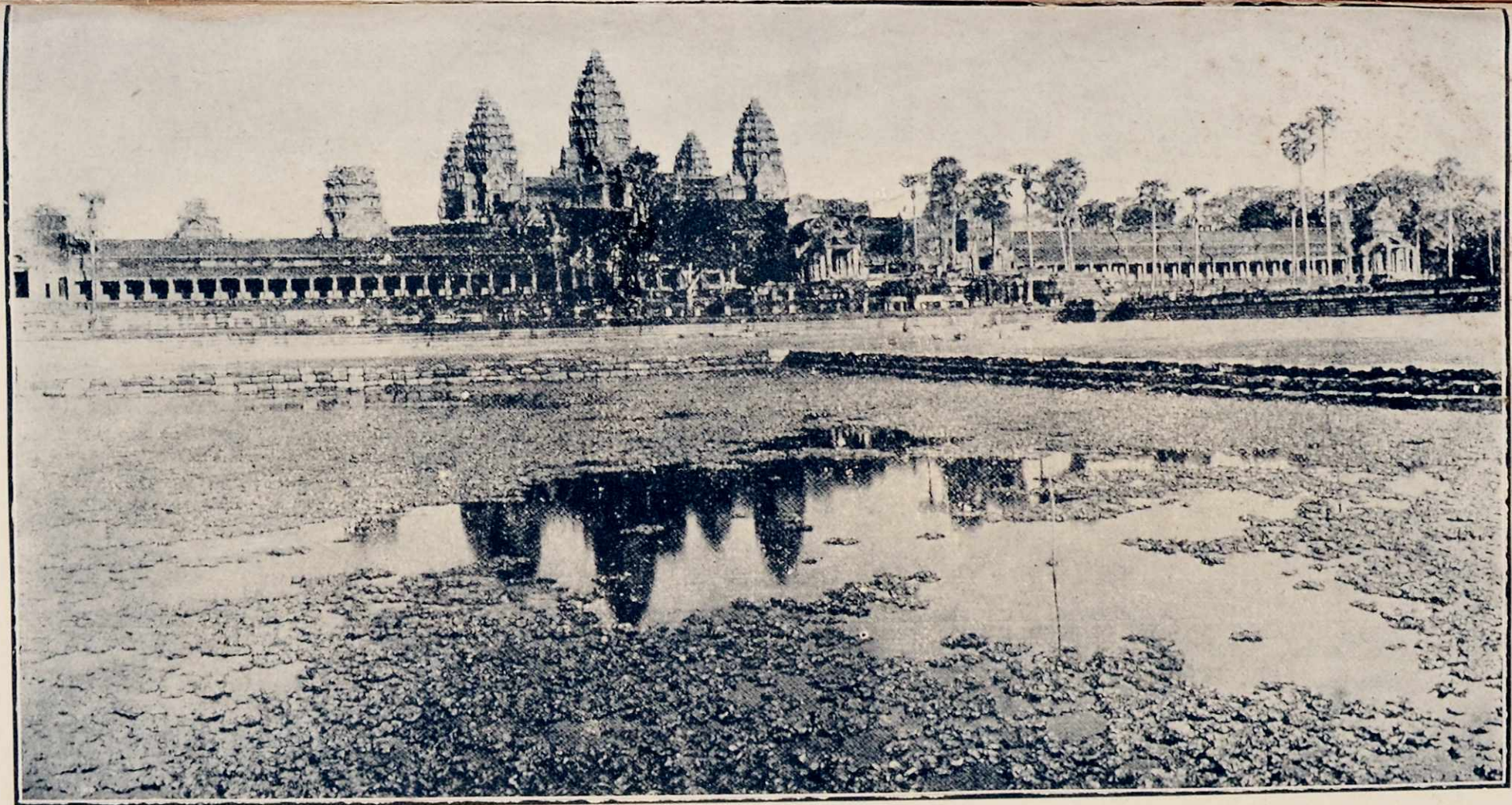
ANGKOR VAT (A Viṣṇu Temple)