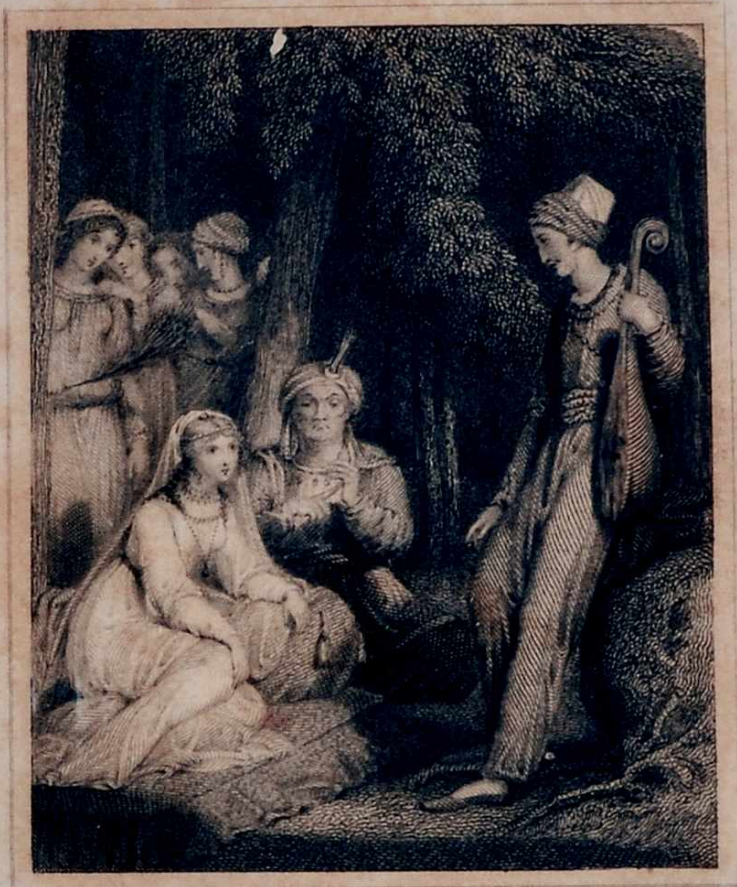
Drawn by Rich d Westall R.A.

ILLUSTRATED WITH ENGRAVINGS From Designs by RICHARD WESTALL, R.A.