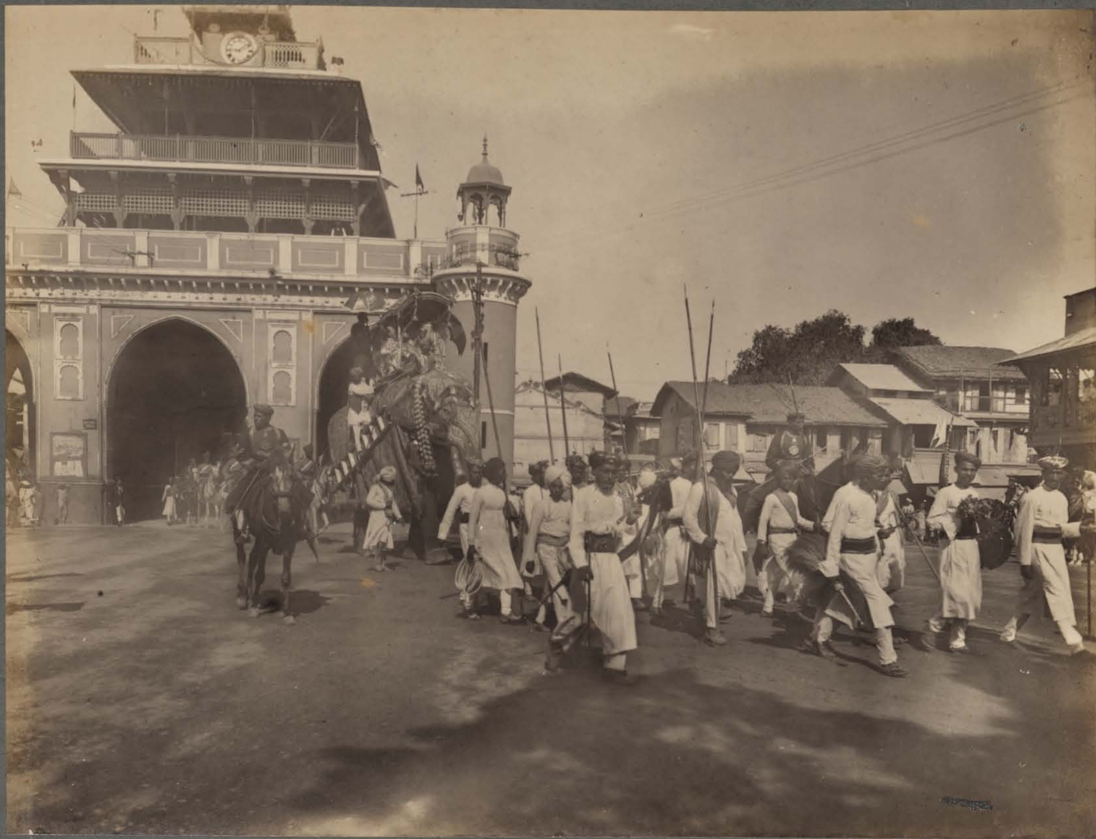
VARĀḡAMAN PROCESSION (BRIDEḡROOM'S ELEPHANT)