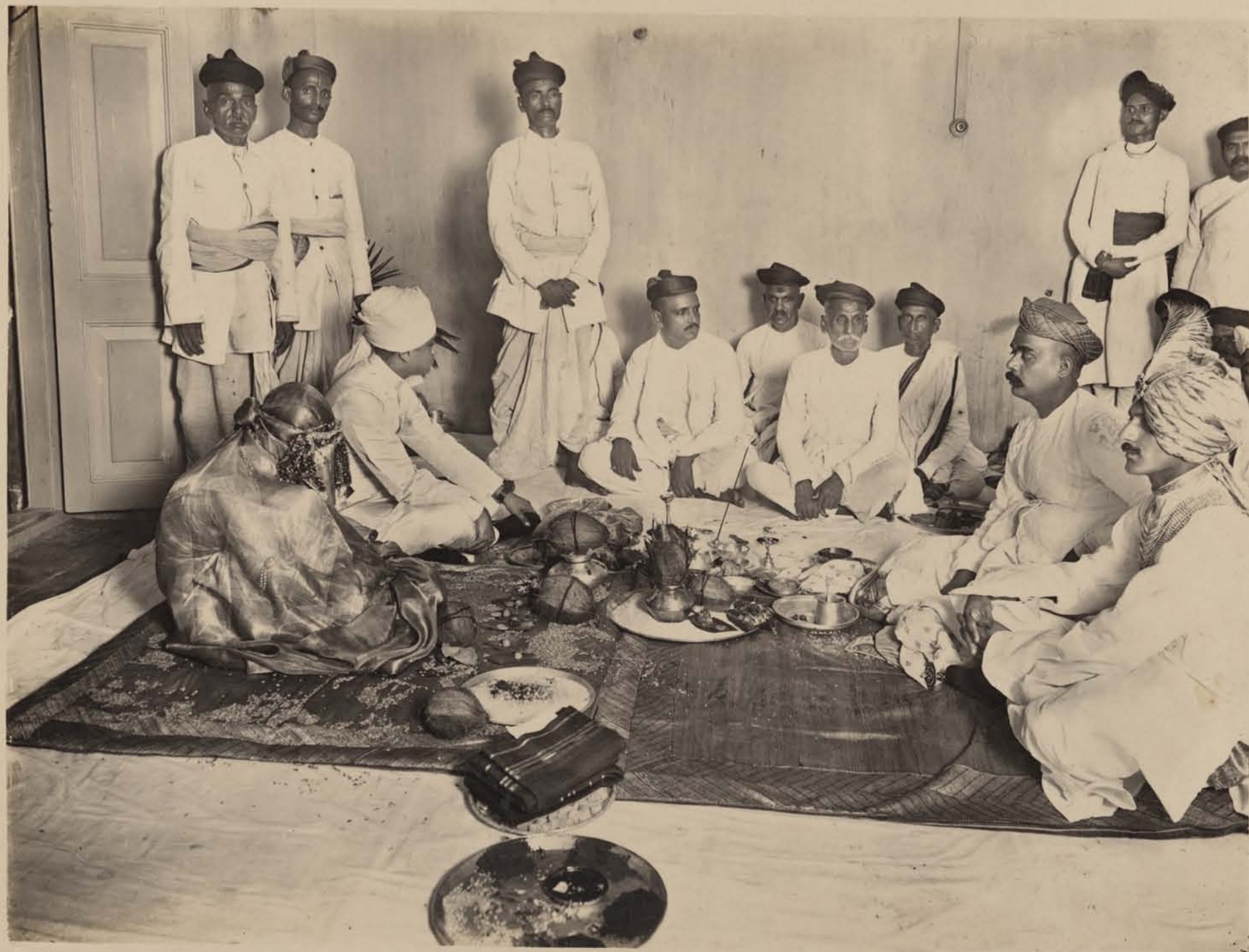
VAGNISHCHAYA (AT NIGHT)