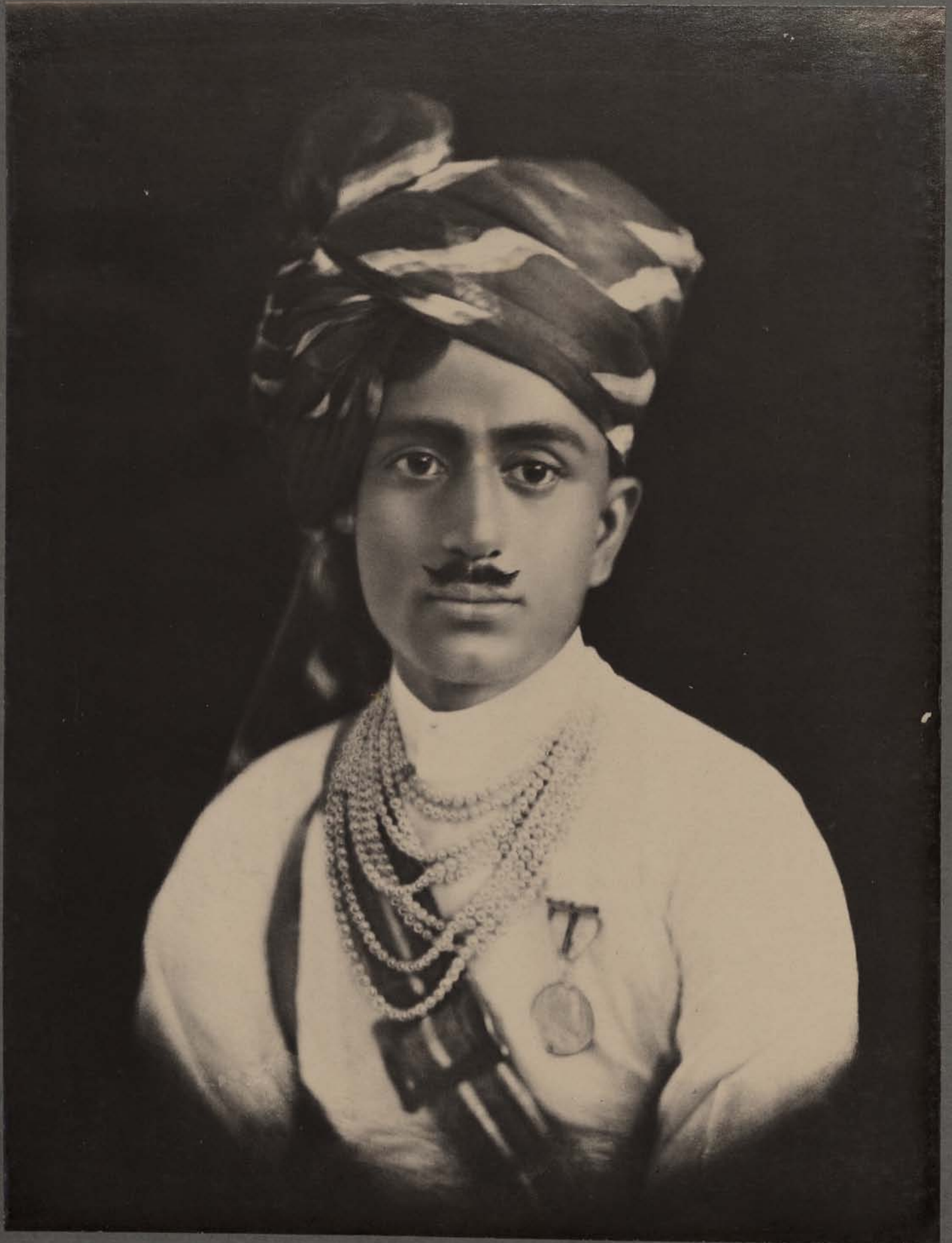
THE LATE PRINCE FATEHSINHRAD GAIKWAR (FATHER OF THE BRIDE)