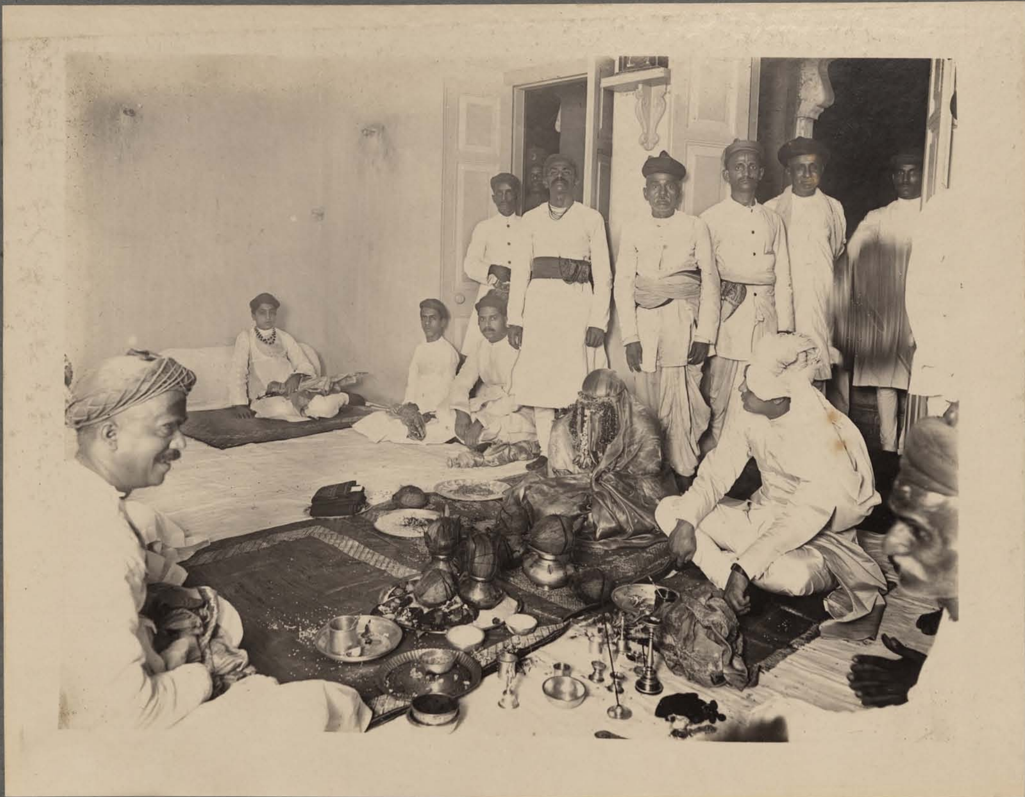
ANOTHER POSITION WITH PRINCE PRATPSINHRAO (AT NIGHT)