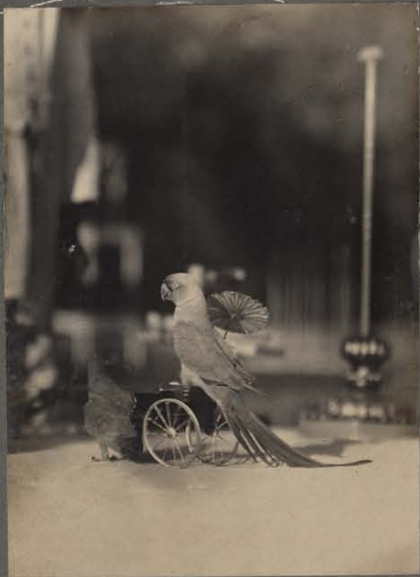
GAME OF PARROTS