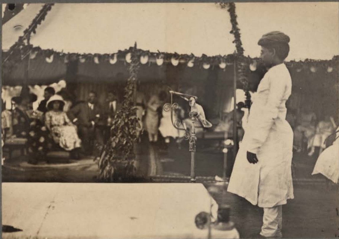
GAME OF PARROT