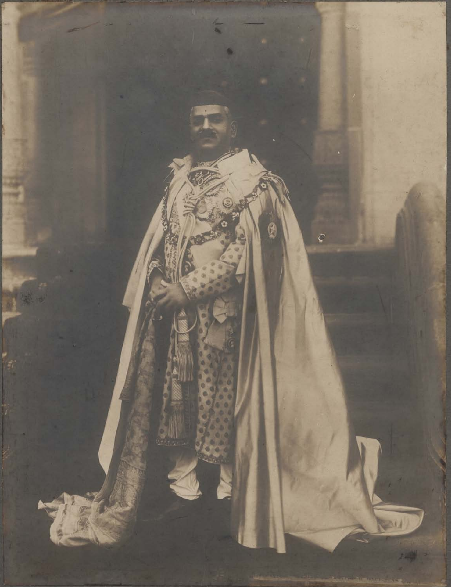
H.H. THE MAHARAJA SAHEB (GRANDFATHER OF THE BRIDE)