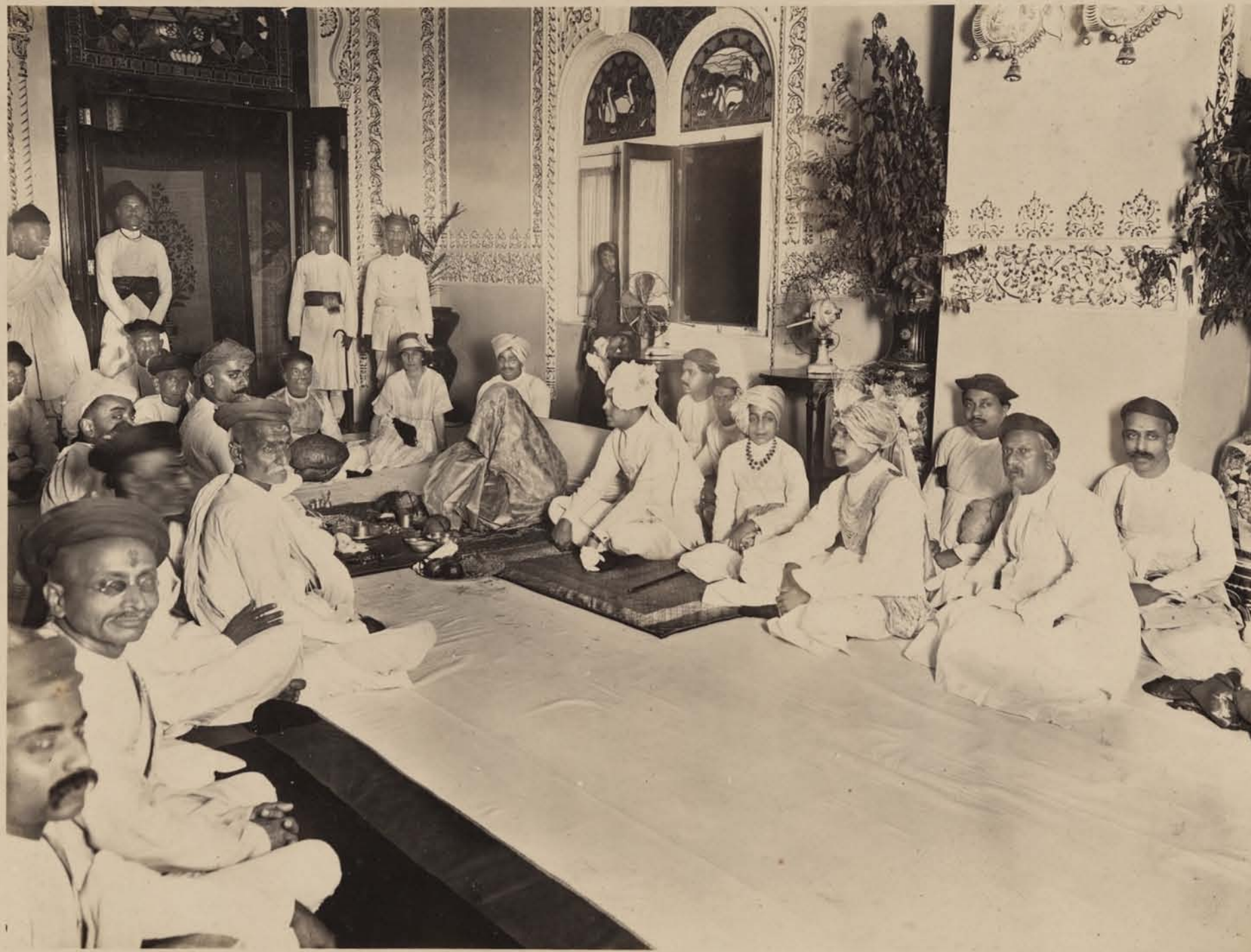
SAKARPUDA (AT NIGHT)