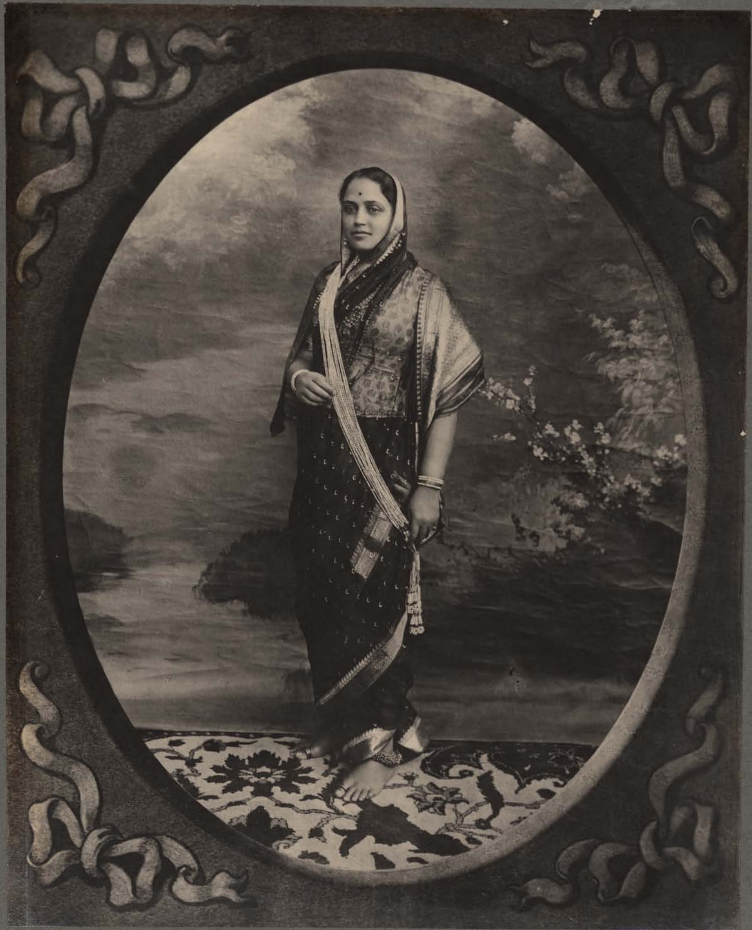
H.H. THE MARANI SAHEB (GRAND MOTHER OF THE BRIDE)