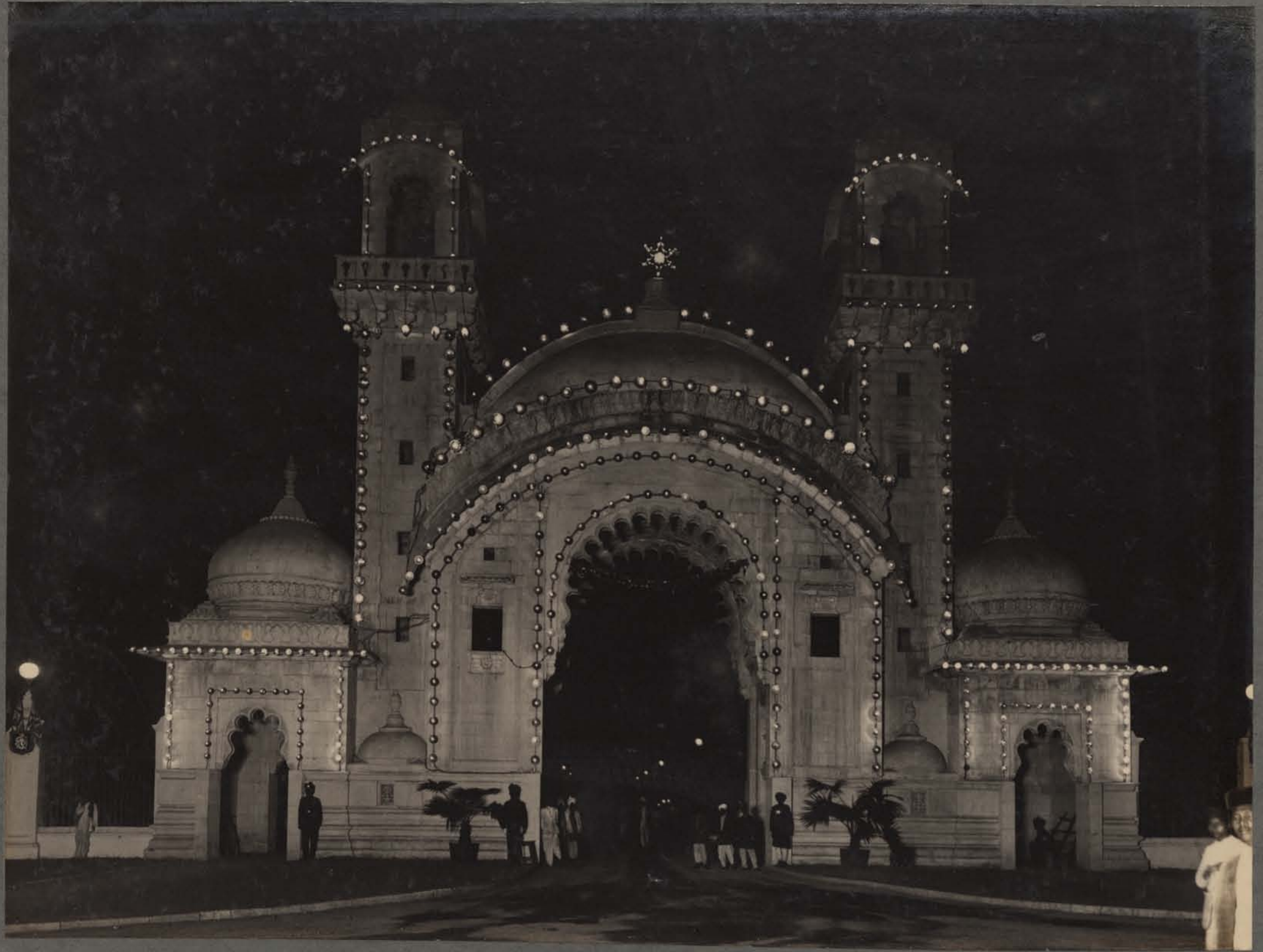
ILLUMINATIONS (RAJMAHAL GATE)