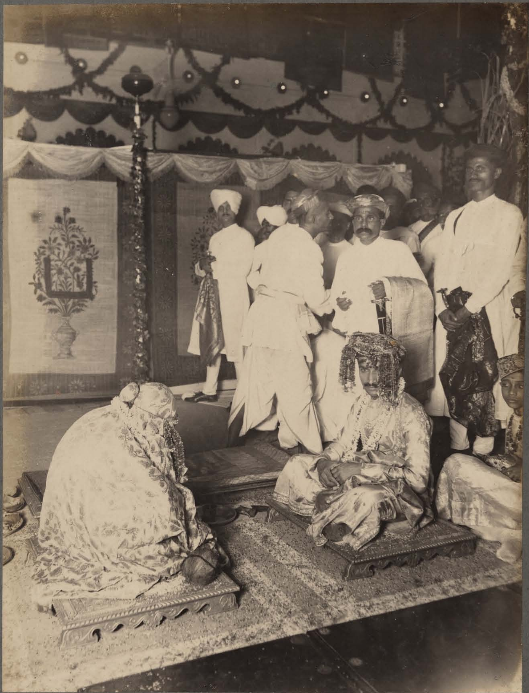
BEGINNING OF THE MARRIAGE