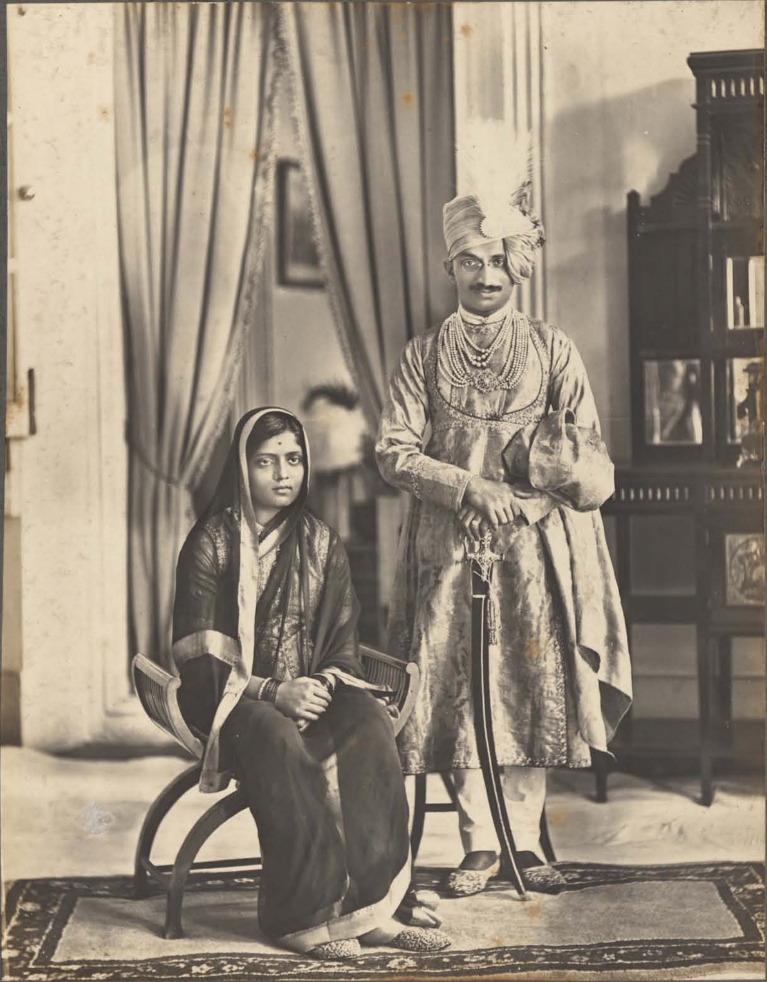
THE BRIDE & BRIDE-GROOM (AFTER WEDDING)