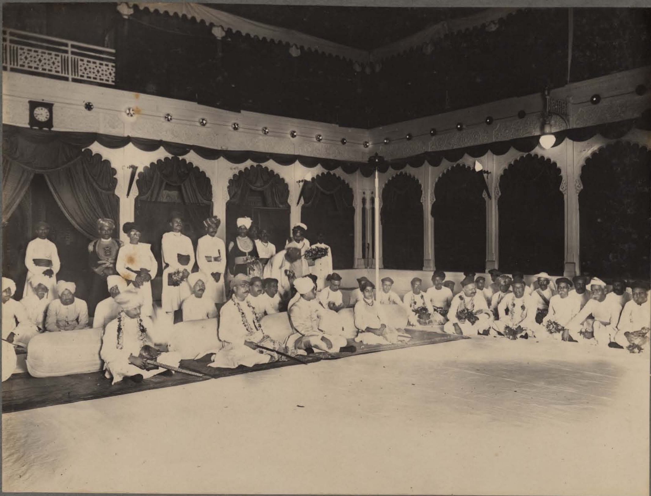
PANSOPARI AFTER VAGNISHCHAYA (ATMIGHT)