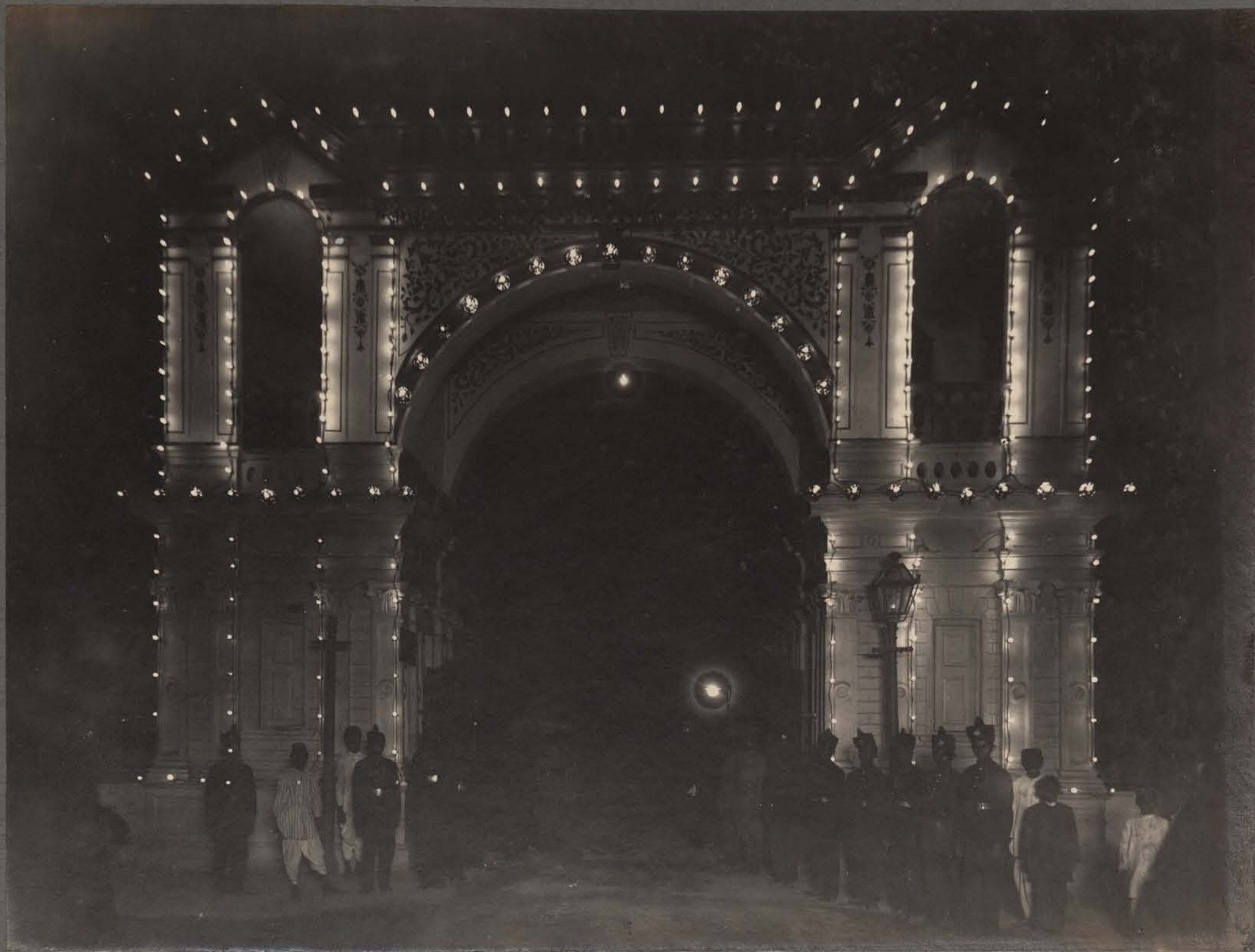
ILLUMINATIONS (NAZARBAQ GATE)