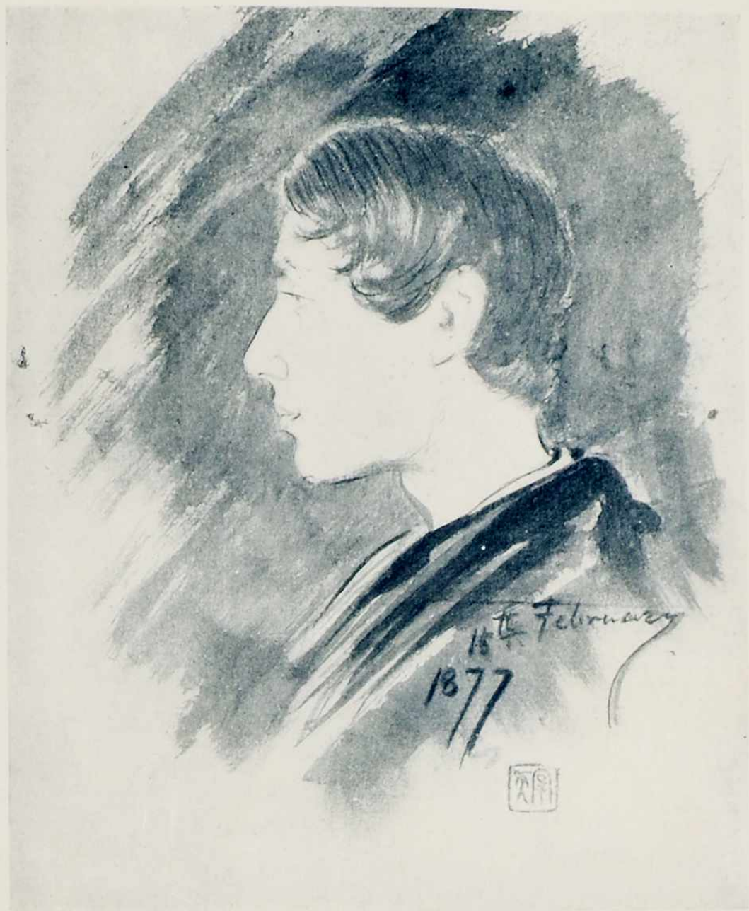
TAGORE IN 1877