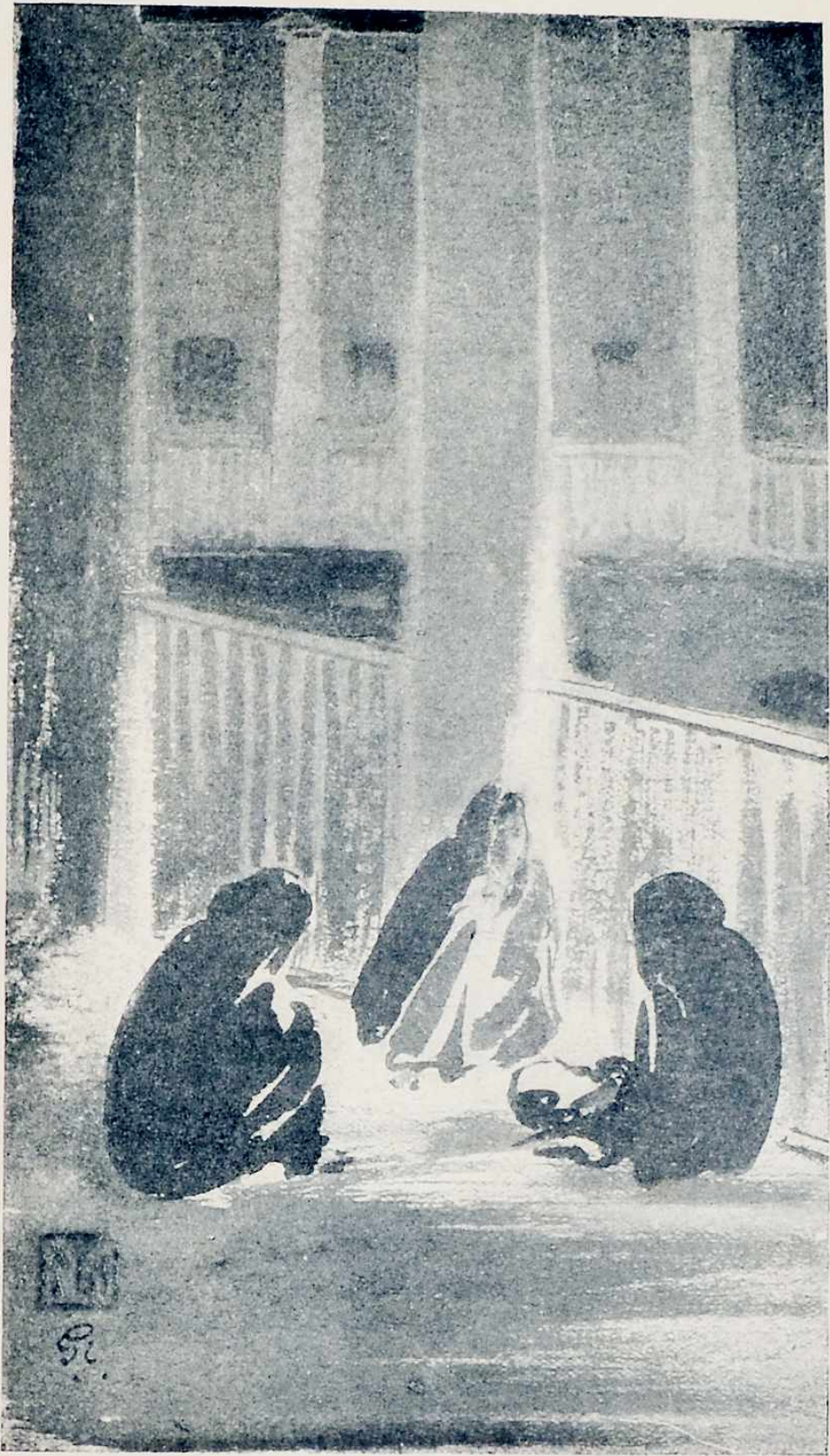
THE SERVANT MAIDS IN THE VERANDAH