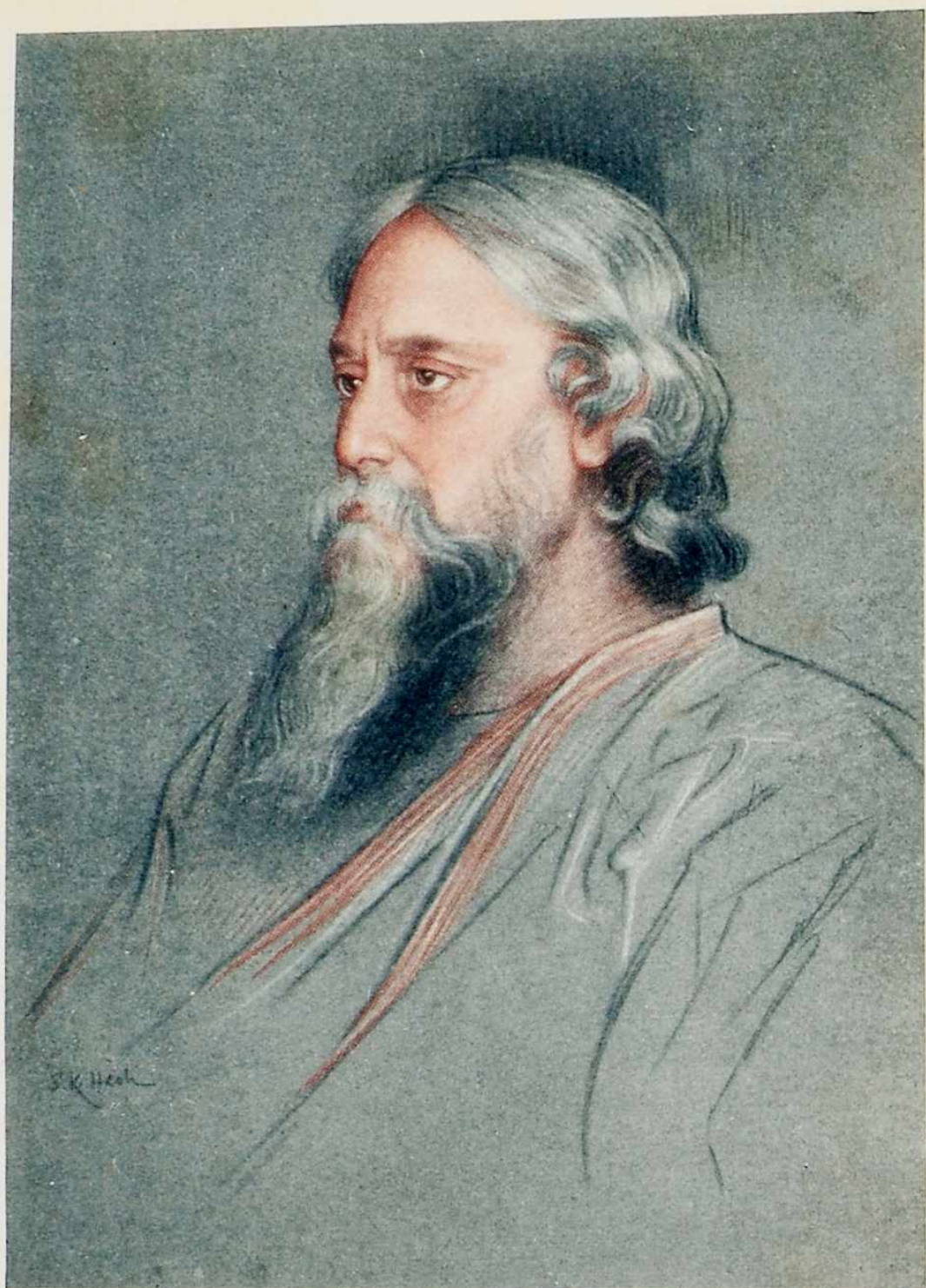
RABINDRANATH TAGORE