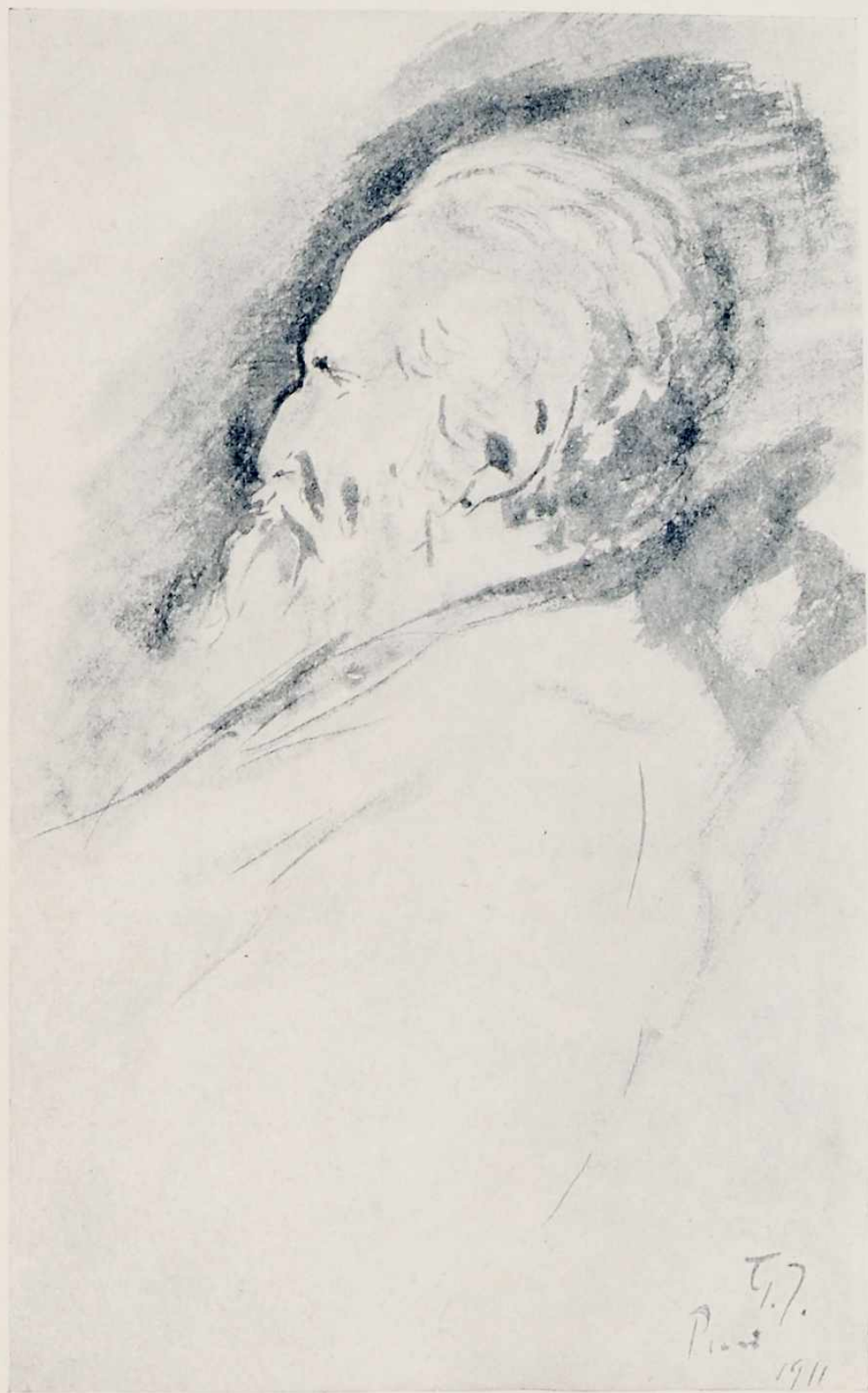
MY ELDEST BROTHER