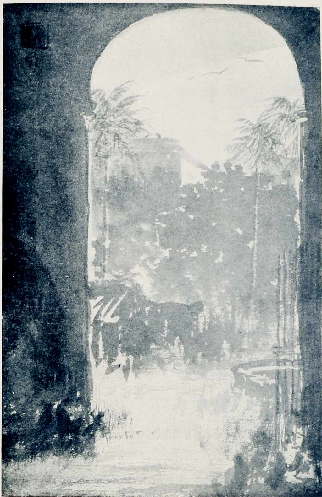
THE INNER GARDEN WAS MY PARADISE