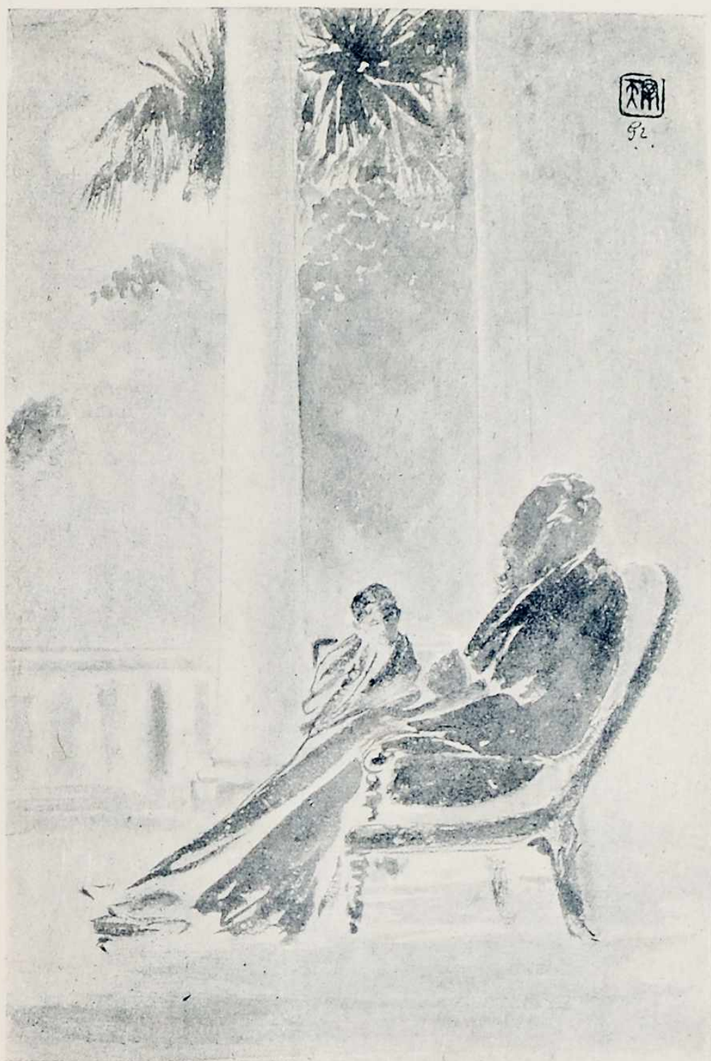
SINGING TO MY FATHER