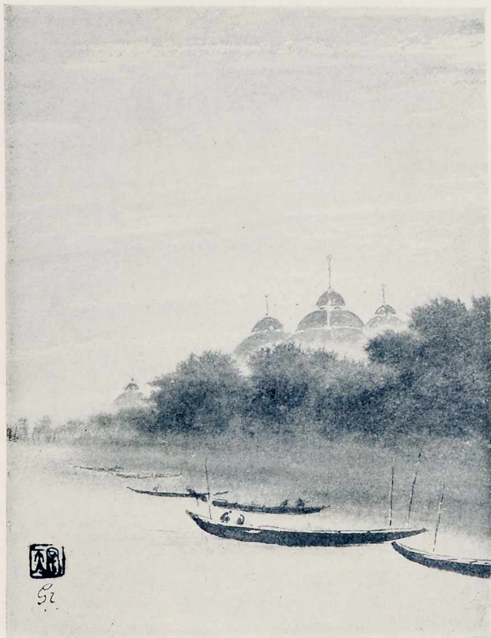
THE GANGES AGAIN