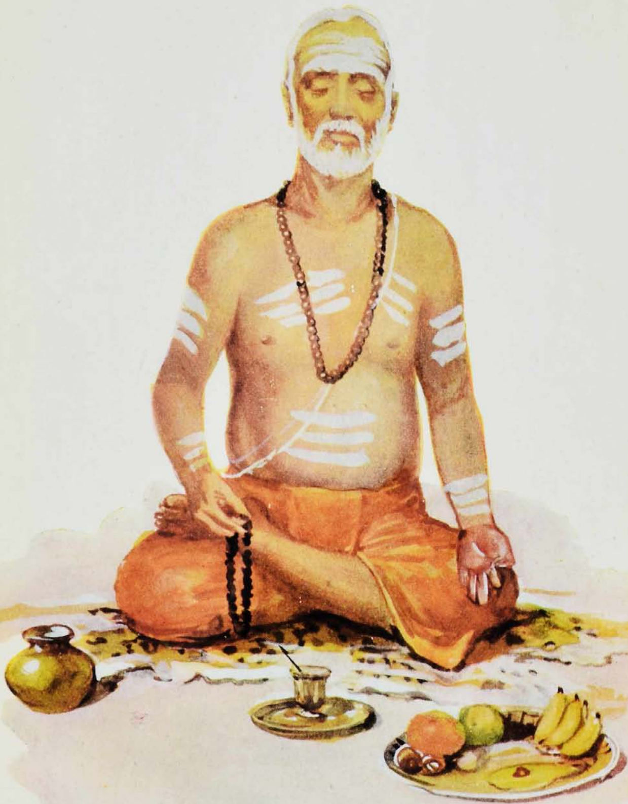
A BRAHMIN PRIEST There are a fairly good number of this type