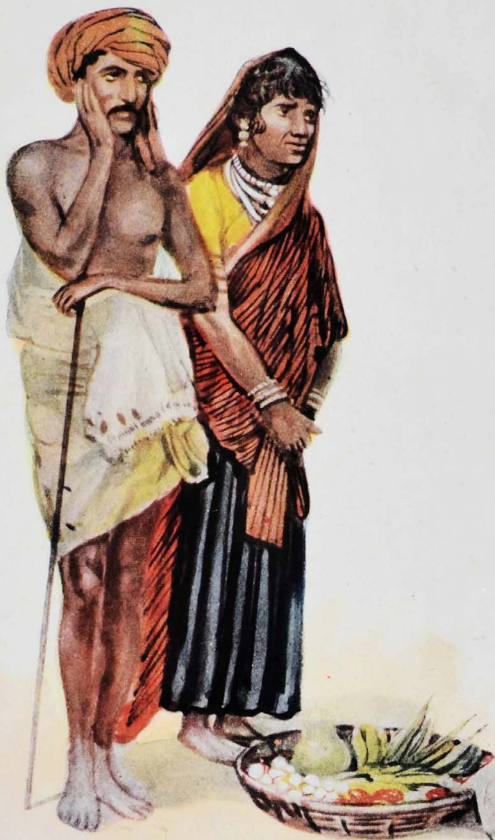
THE VAGHRIS The Gipsies of India