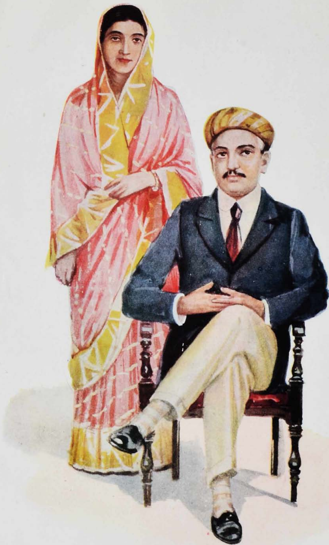
THE KHOJAS They are the followers of the Aga Khan