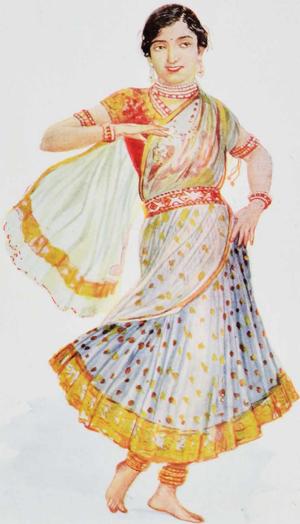
THE DANCING GIRL. She leads a life of gay abandon