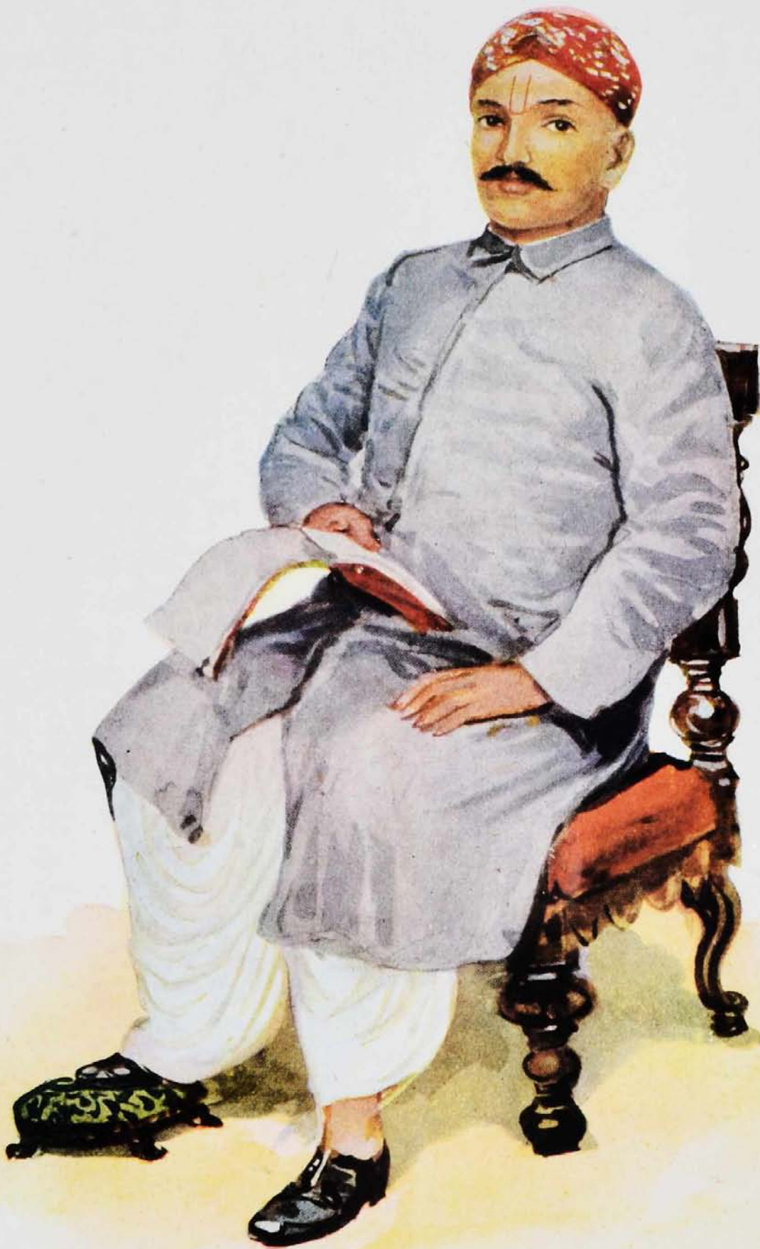
A LOHANA Once a martial race