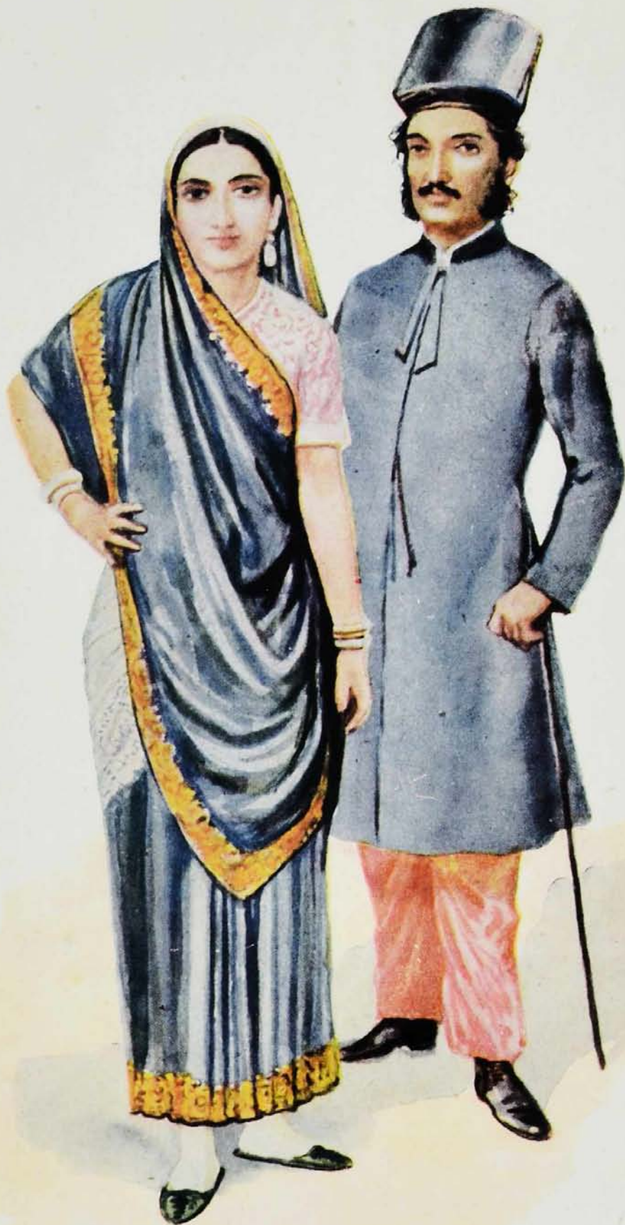
THE PARSEES (old style)

Their advancement in all spheres of life has been phenomenal