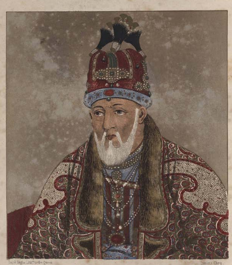
The late EMPEROR OF DELETE.