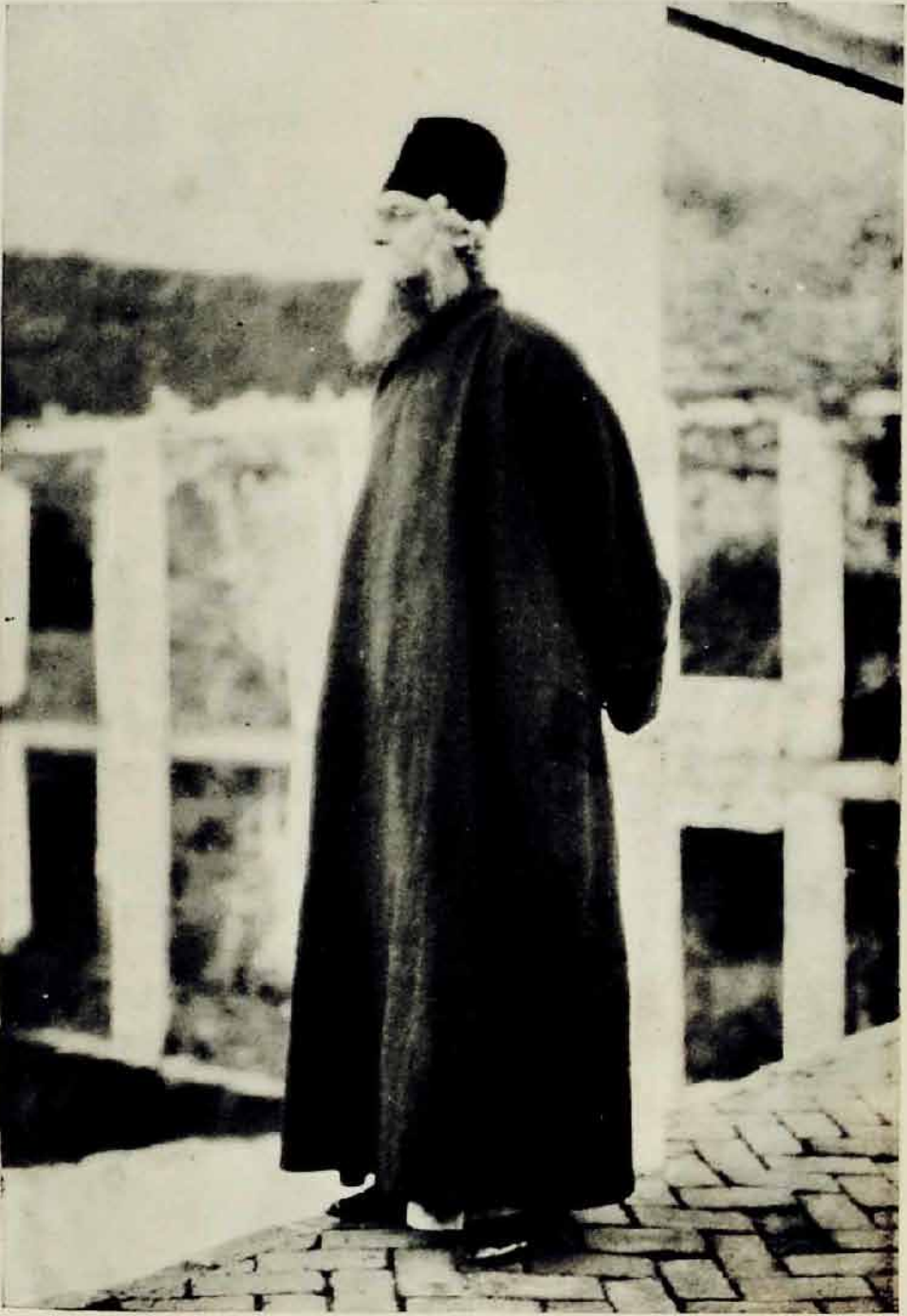
AT SANTA BARBARA CALIFORNIA