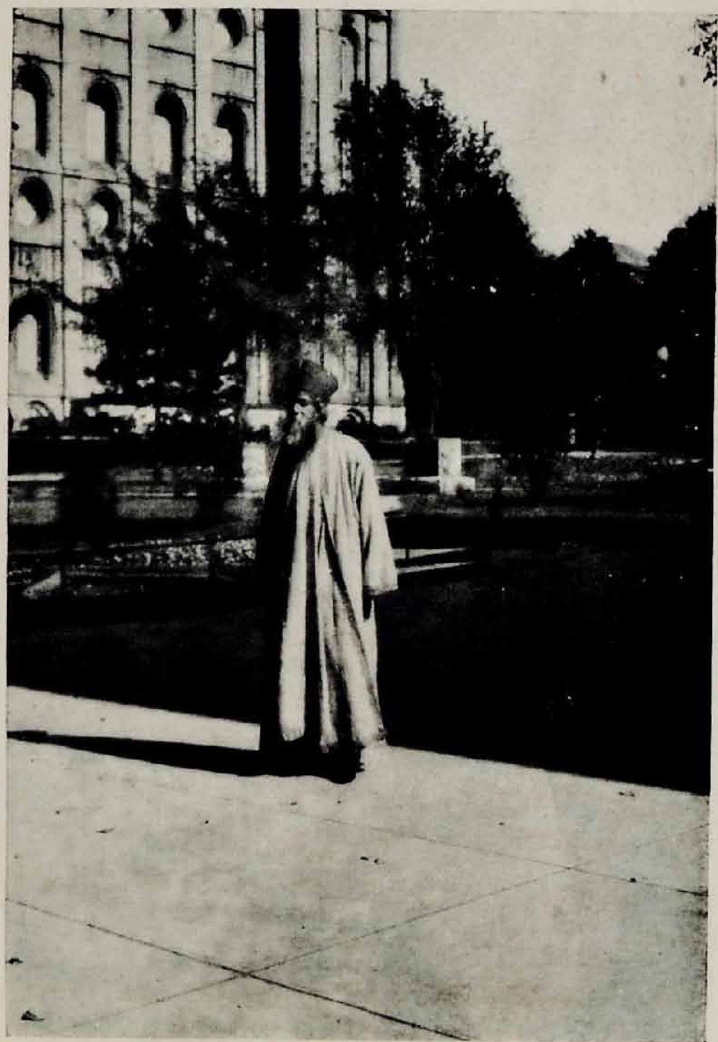
SIR RABINDRANATH TAGORE