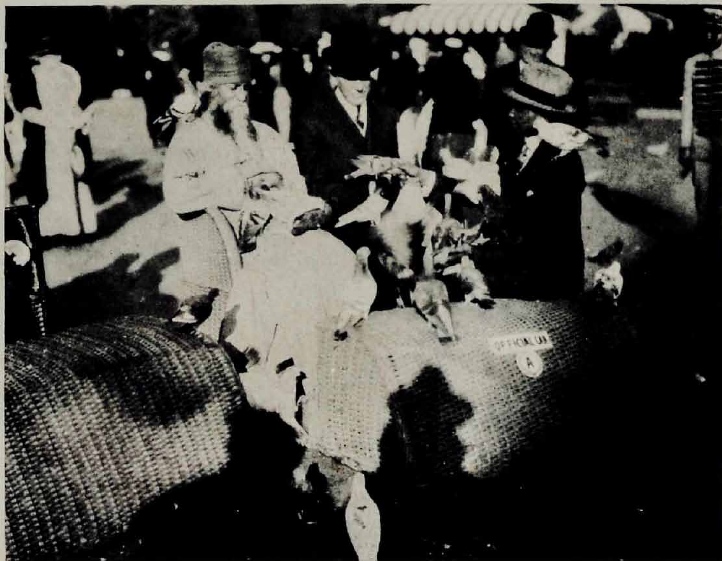
AT THE SAN DIEGO EXPOSITION