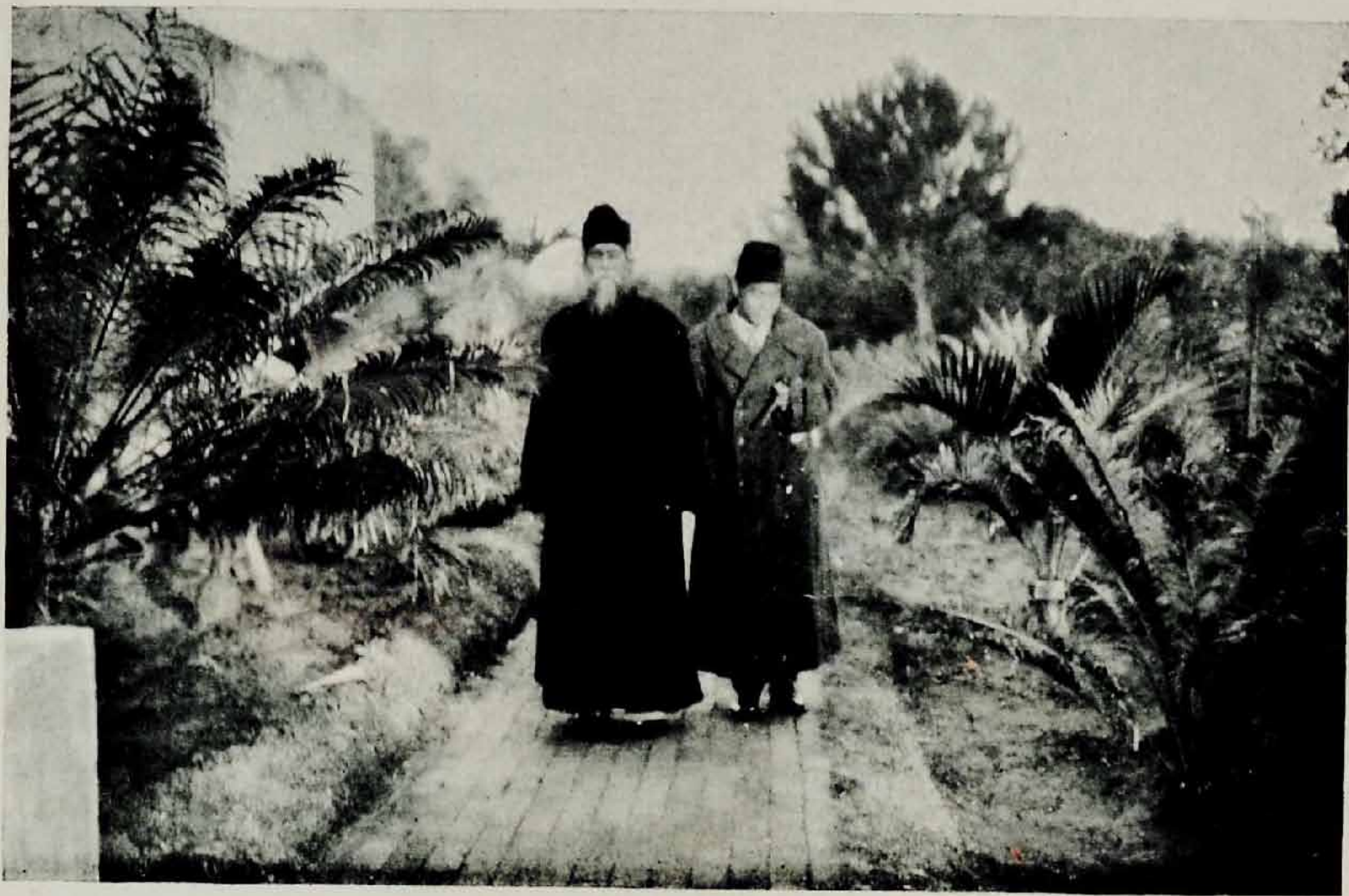
AT SANTA BARBARA, CALIFORNIA