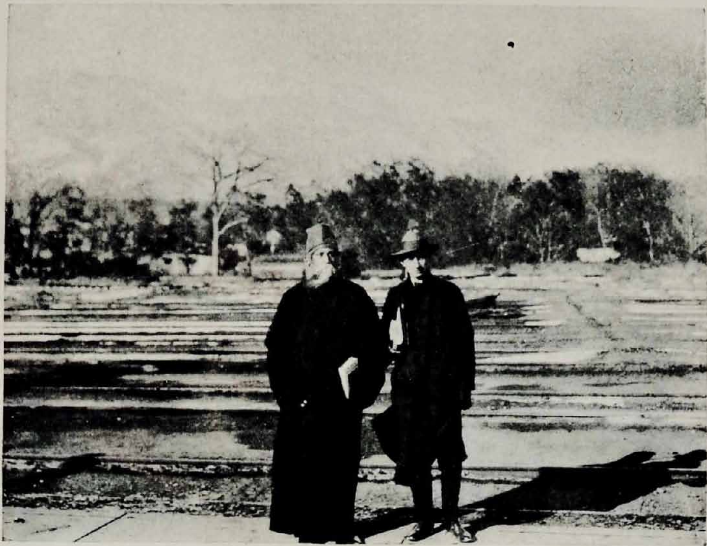
AT COLORADO SPRINGS, COLORADO