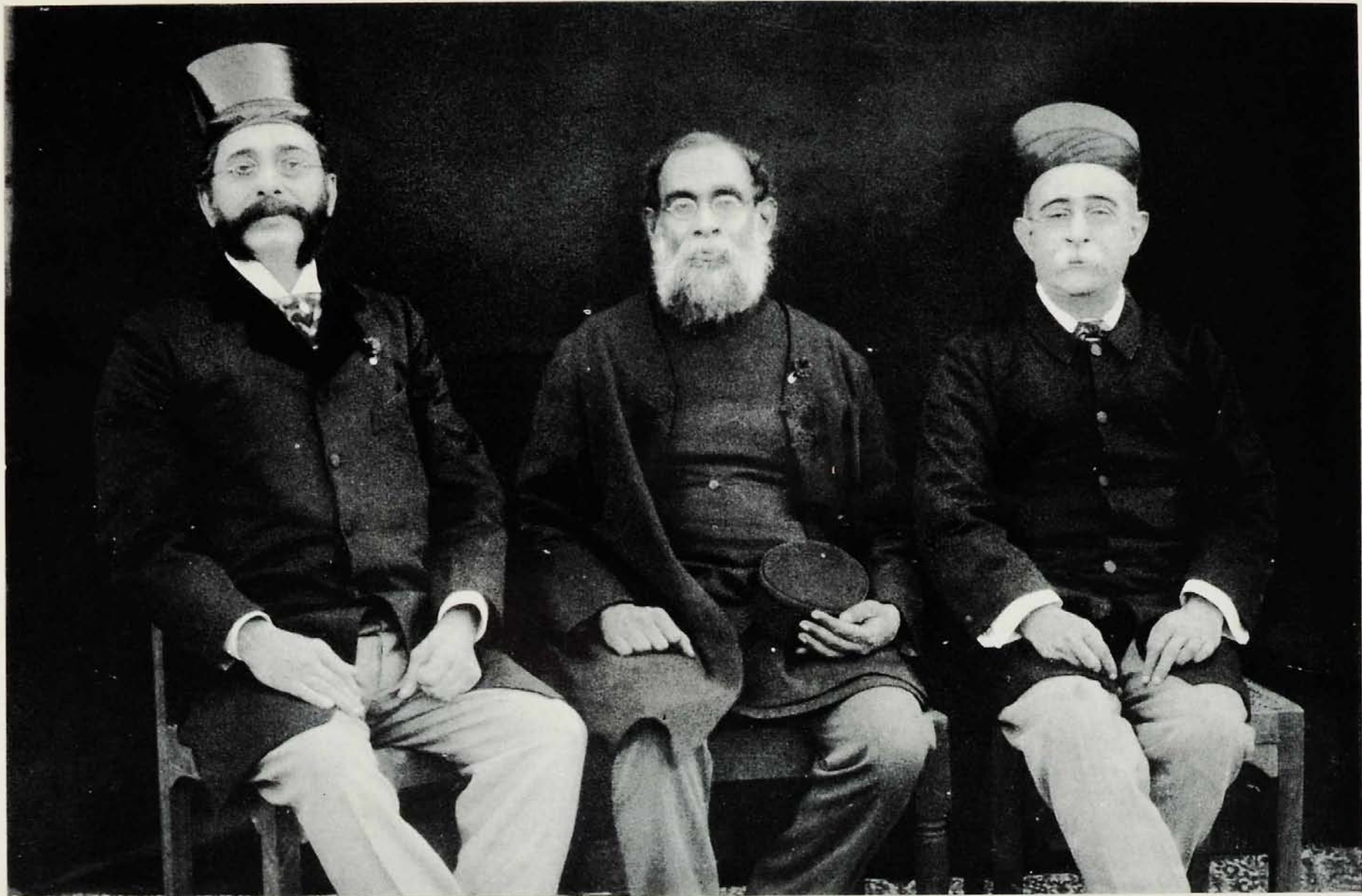
Sir Pherozechah, Surendranath Bannerji and Dinshaw Wacha