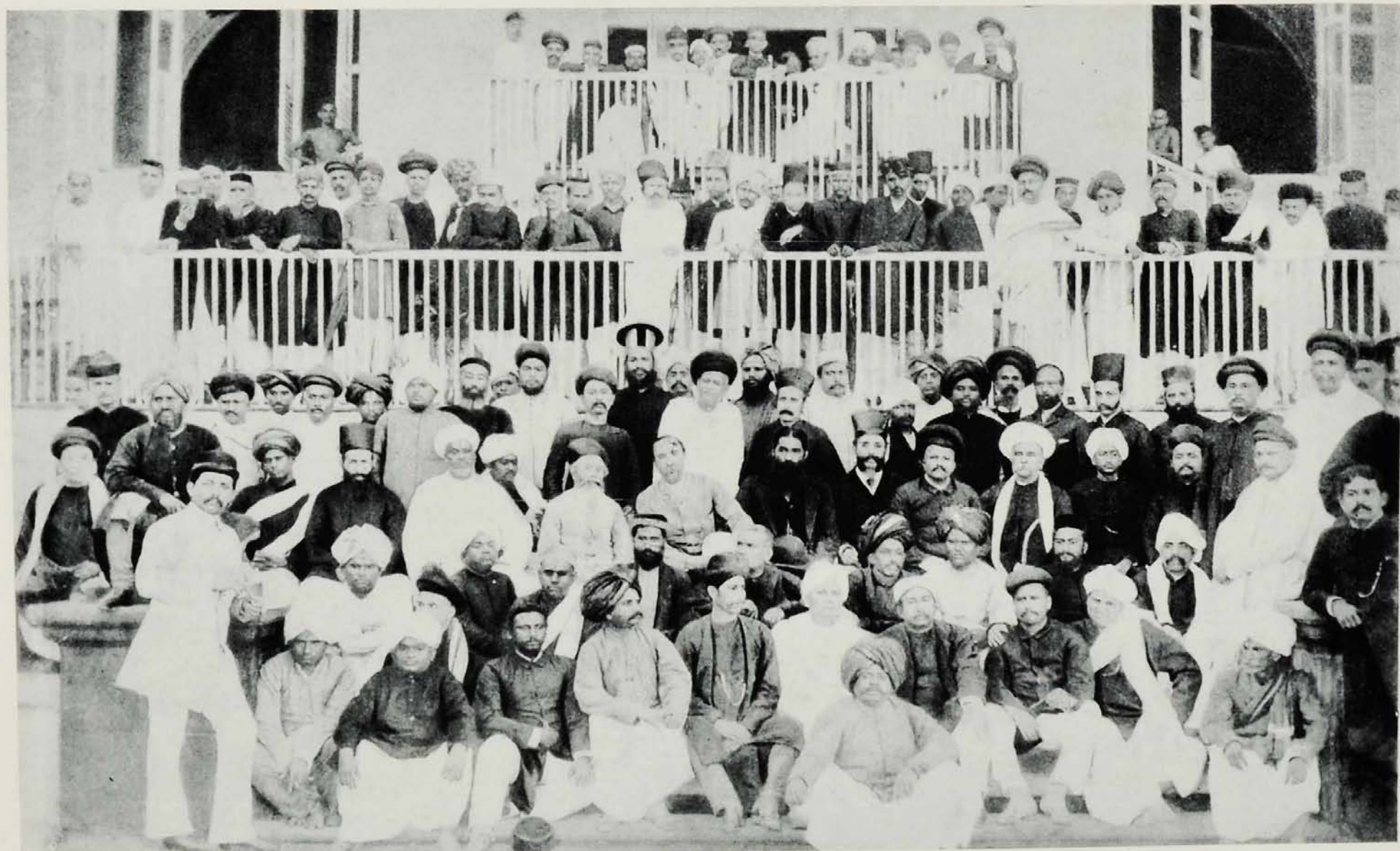
Gathering at the First Indian National Congress, 1885