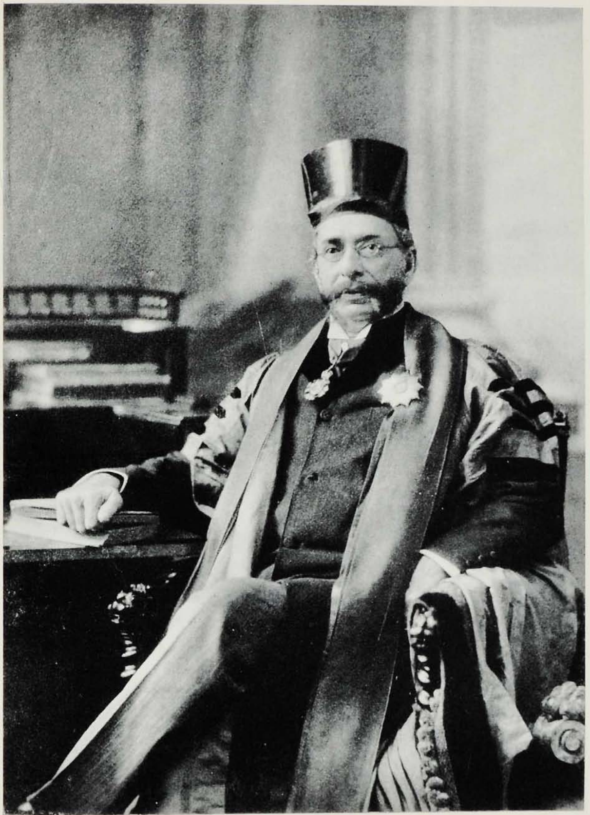
In an academic gown