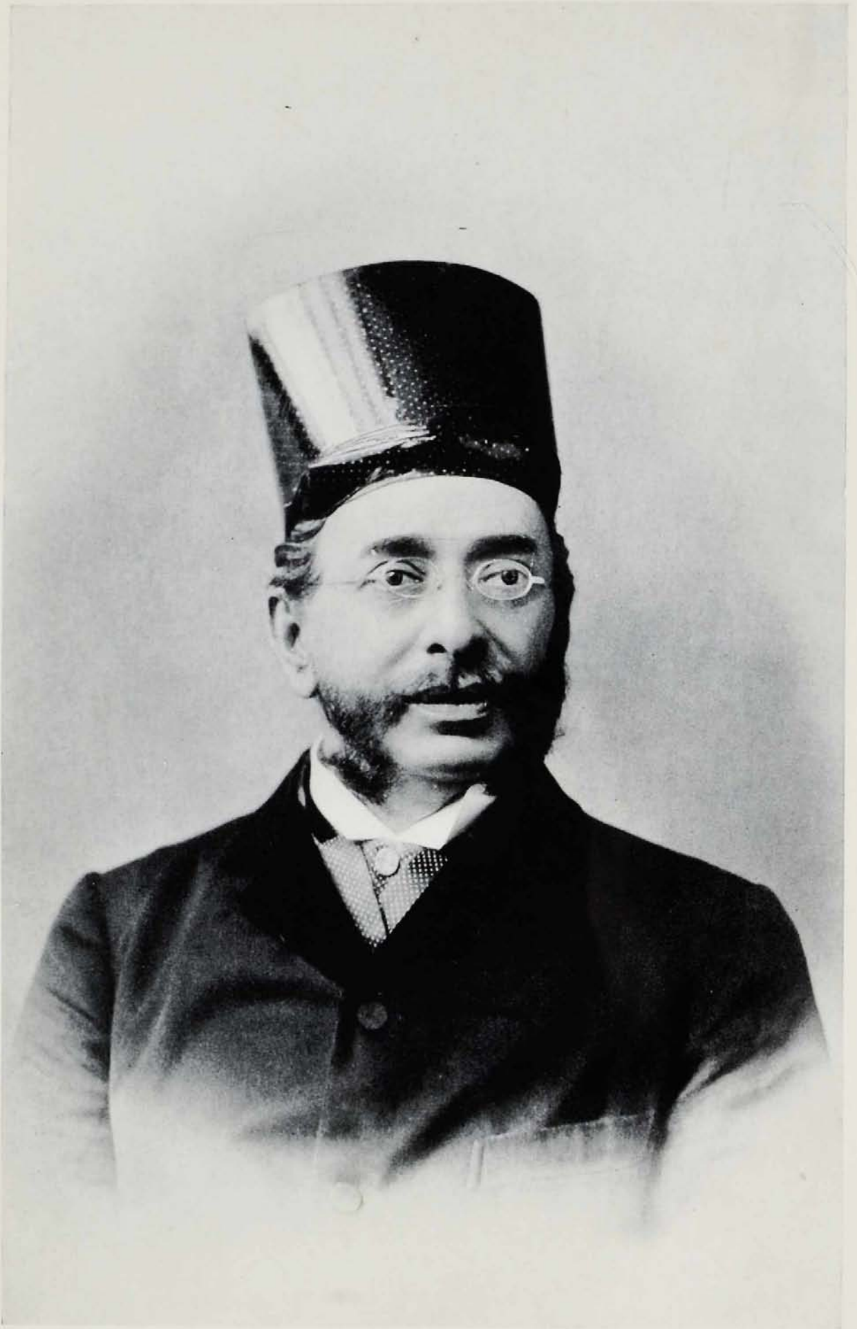
Sir Pherozeshah in 1911