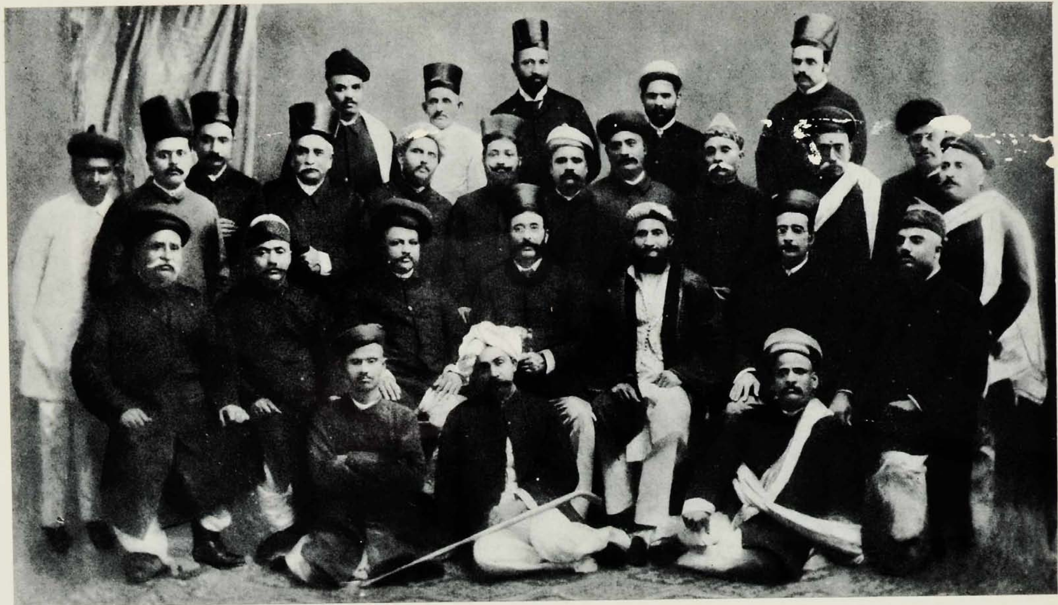
Reception Committee, Fifth Indian National Congress