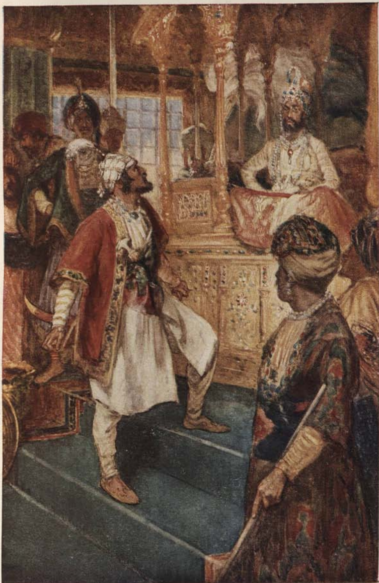
Sivaji openly defies the Great Moghul