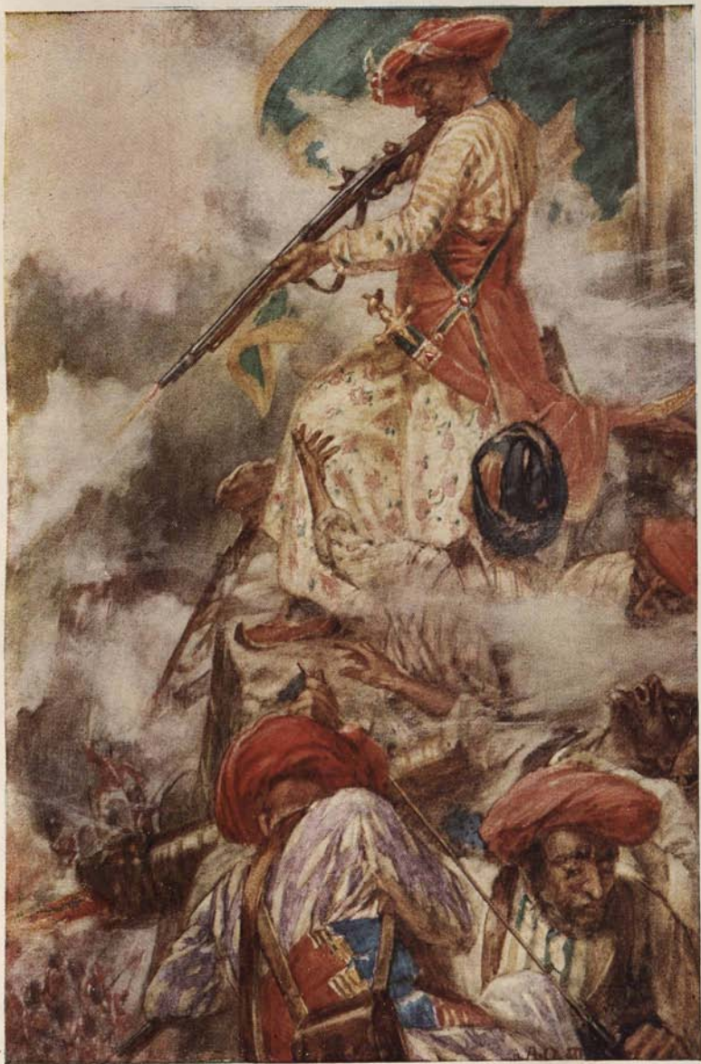
"Tipu himself stood firing coolly at his advancing foes"