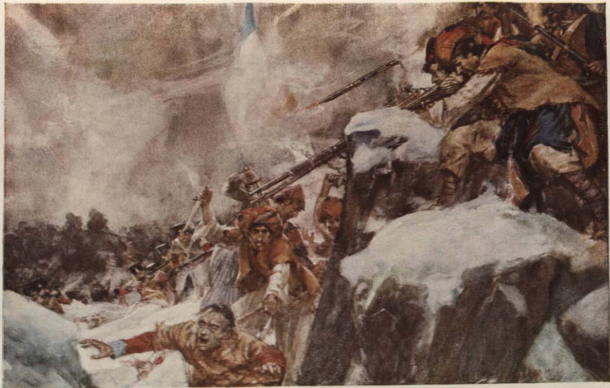
The retreat from Afghanistan, 1842