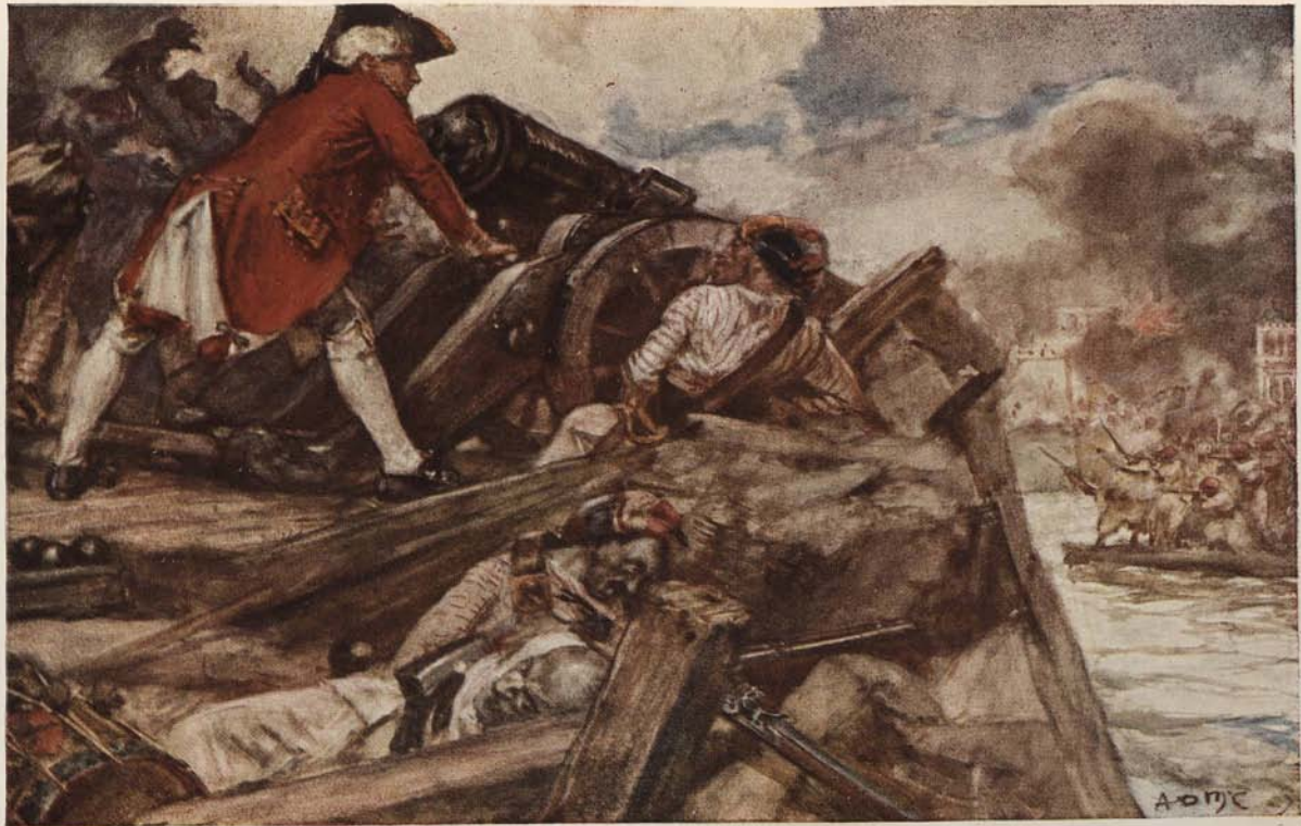
"Clive himself sprang to a gun"