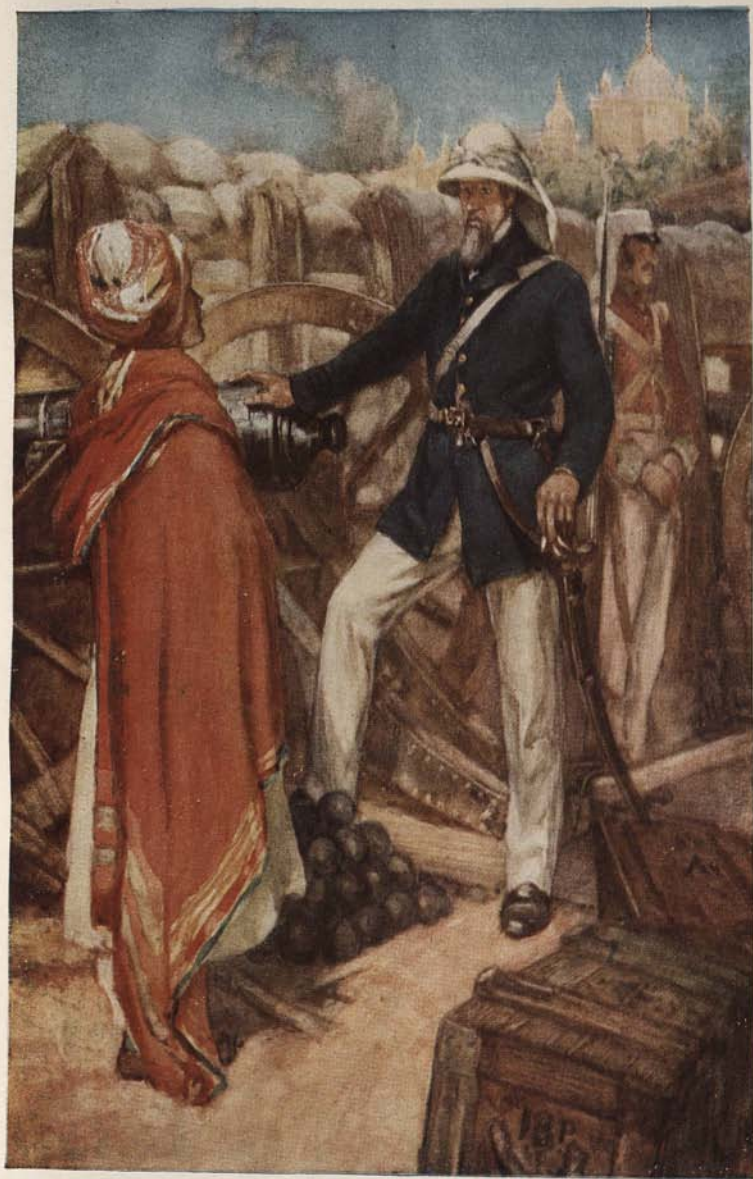
"See," he said, "here is one of my monkeys"