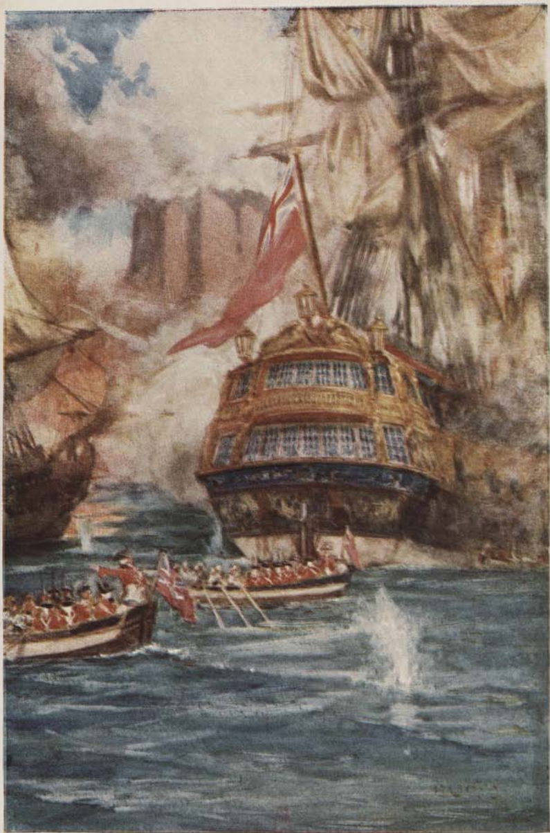
Storming of Geriah, 1756