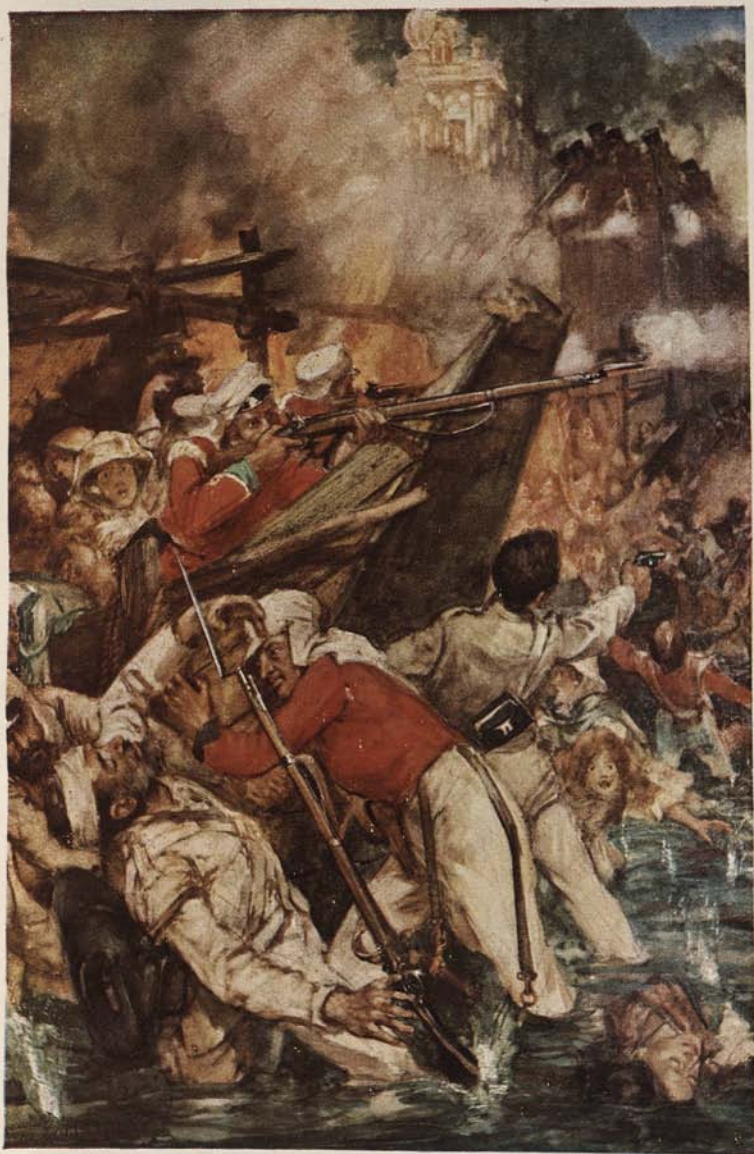
"The thatched roofs of the boats blazing furiously"