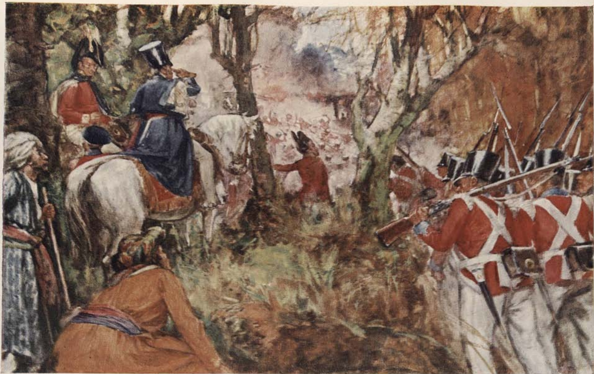
"Through pathless forests and fever-laden jungles"