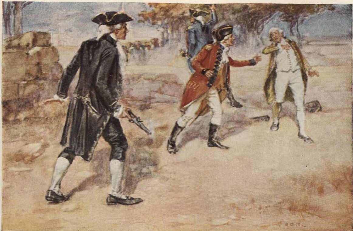
Duel between Warren Hastings and Phillip Francis