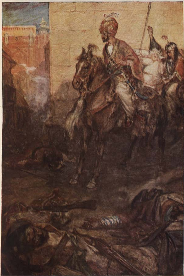
"The first sight that met his gaze was the bodies of his murdered countrymen"