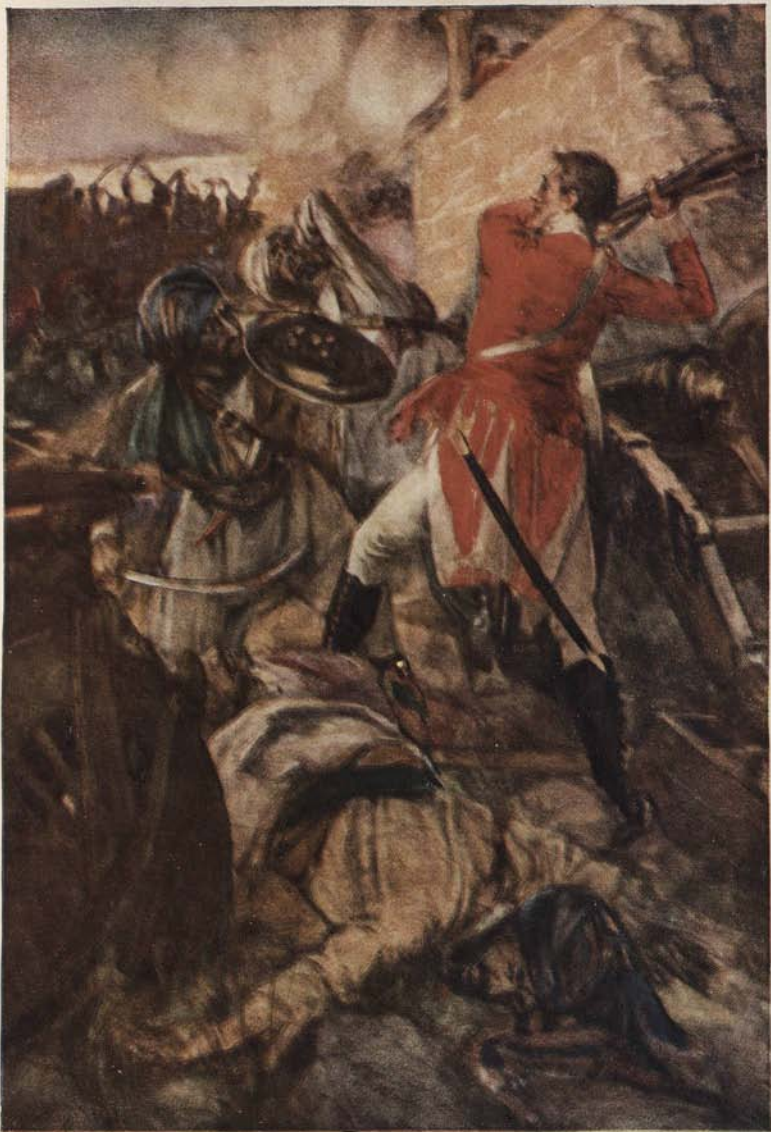
Lieutenant Pattinson recaptures the gun