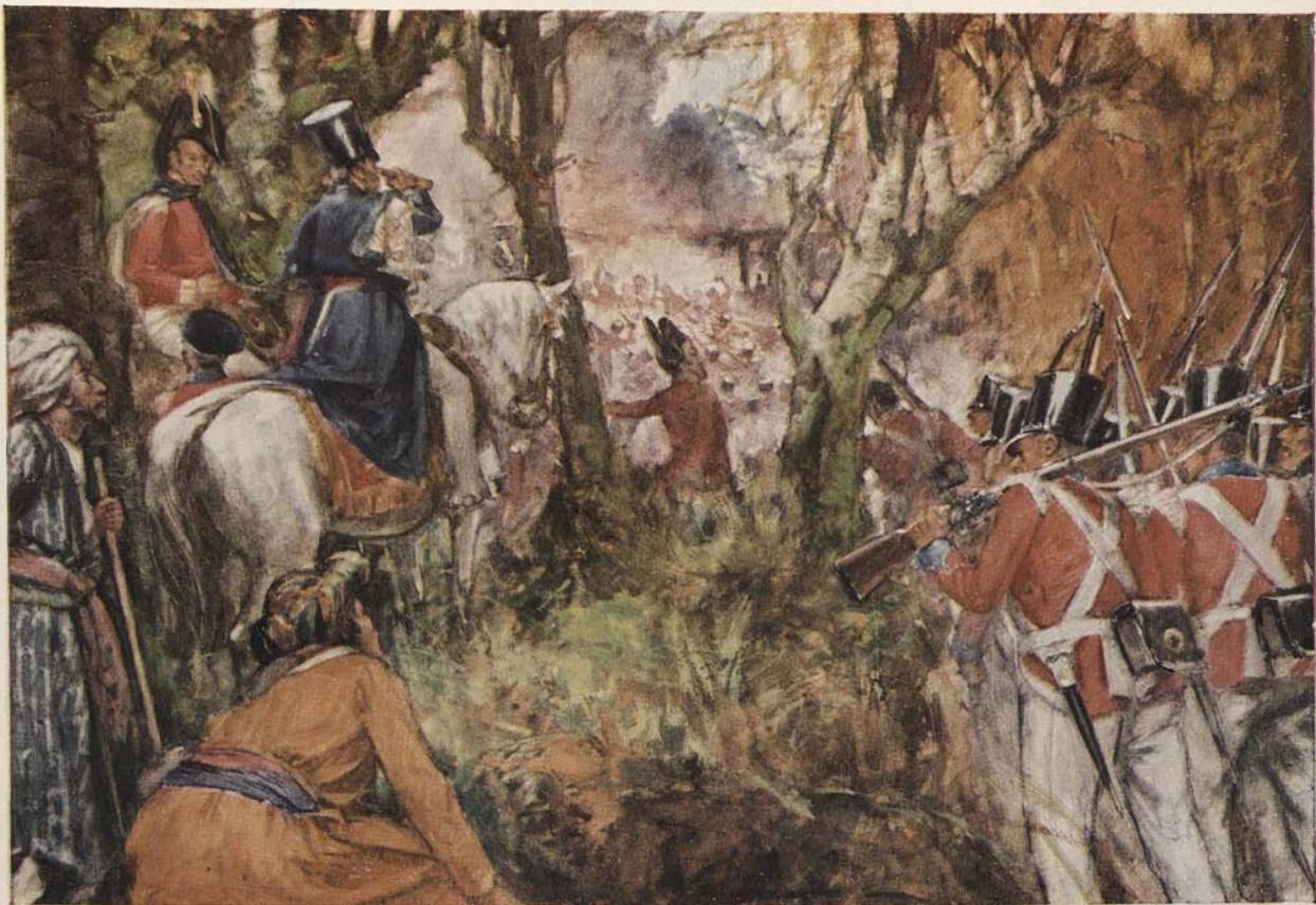
"Through pathless forests and fever-laden jungles"