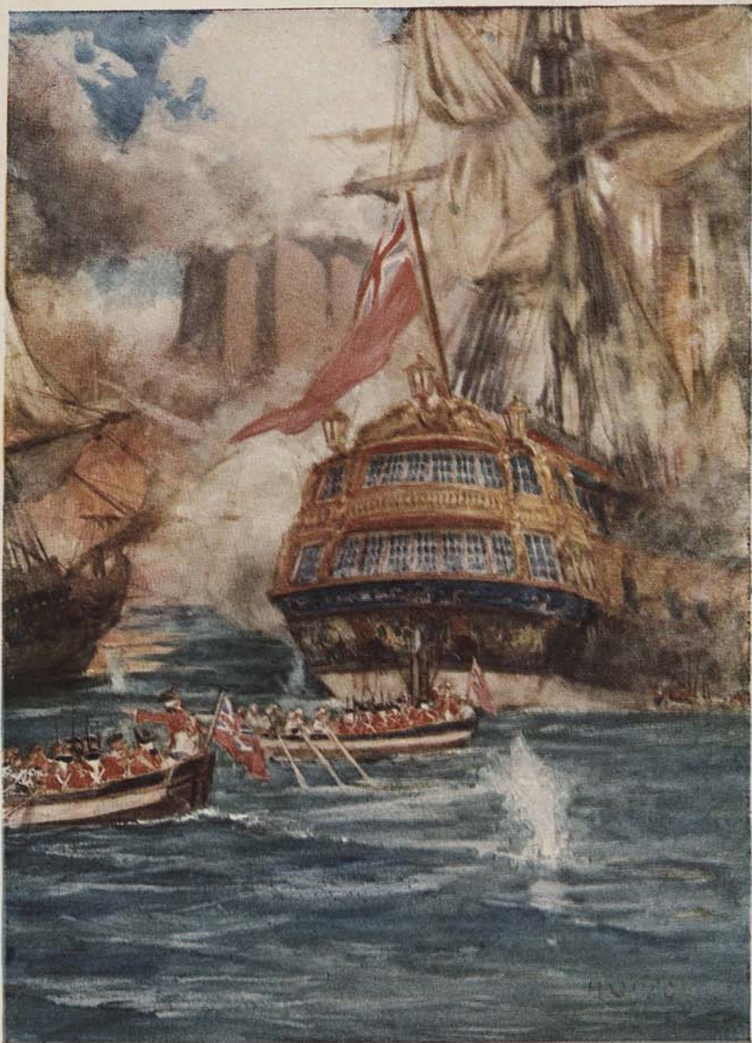
Storming of Geriah, 1756