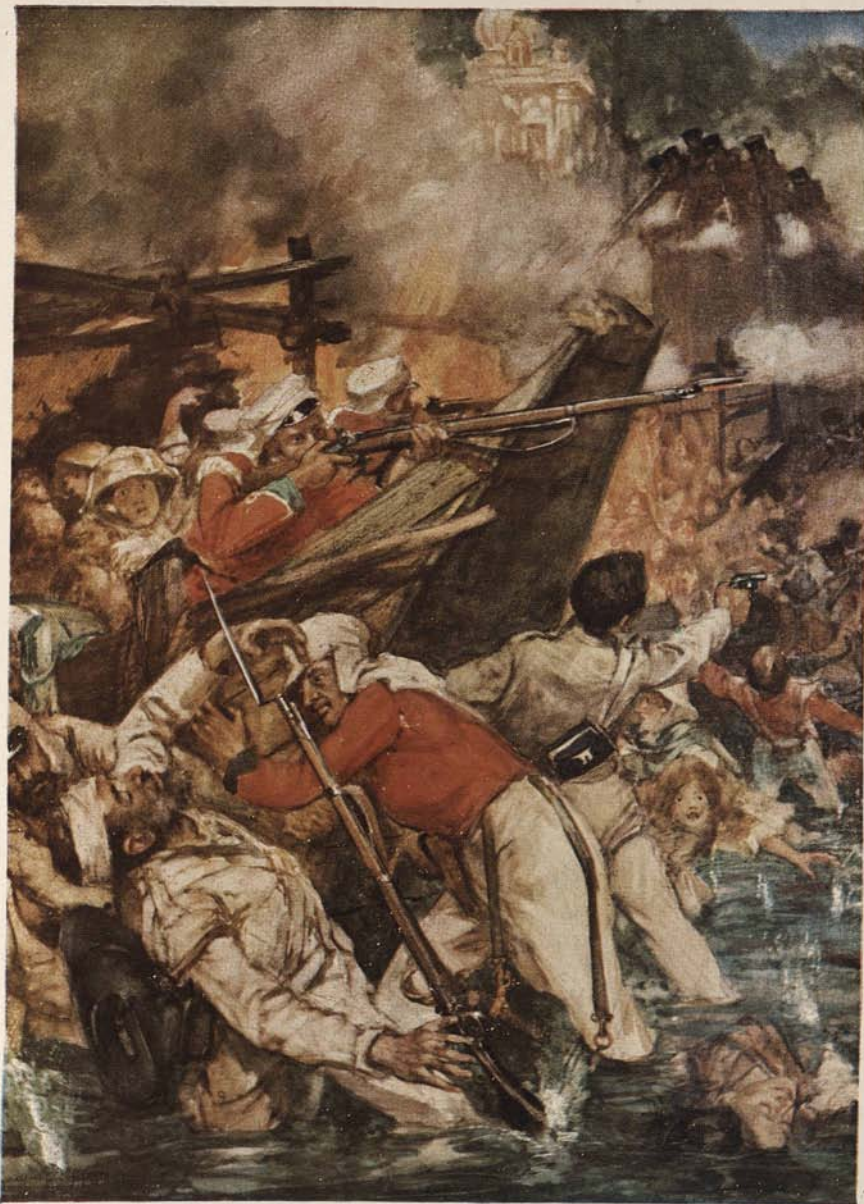
"The thatched roofs of the boats blazing furiously"