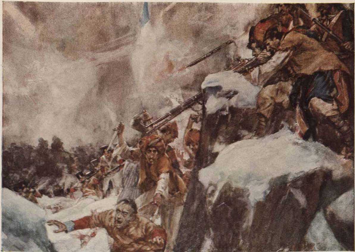
The retreat from Afghanistan, 1842