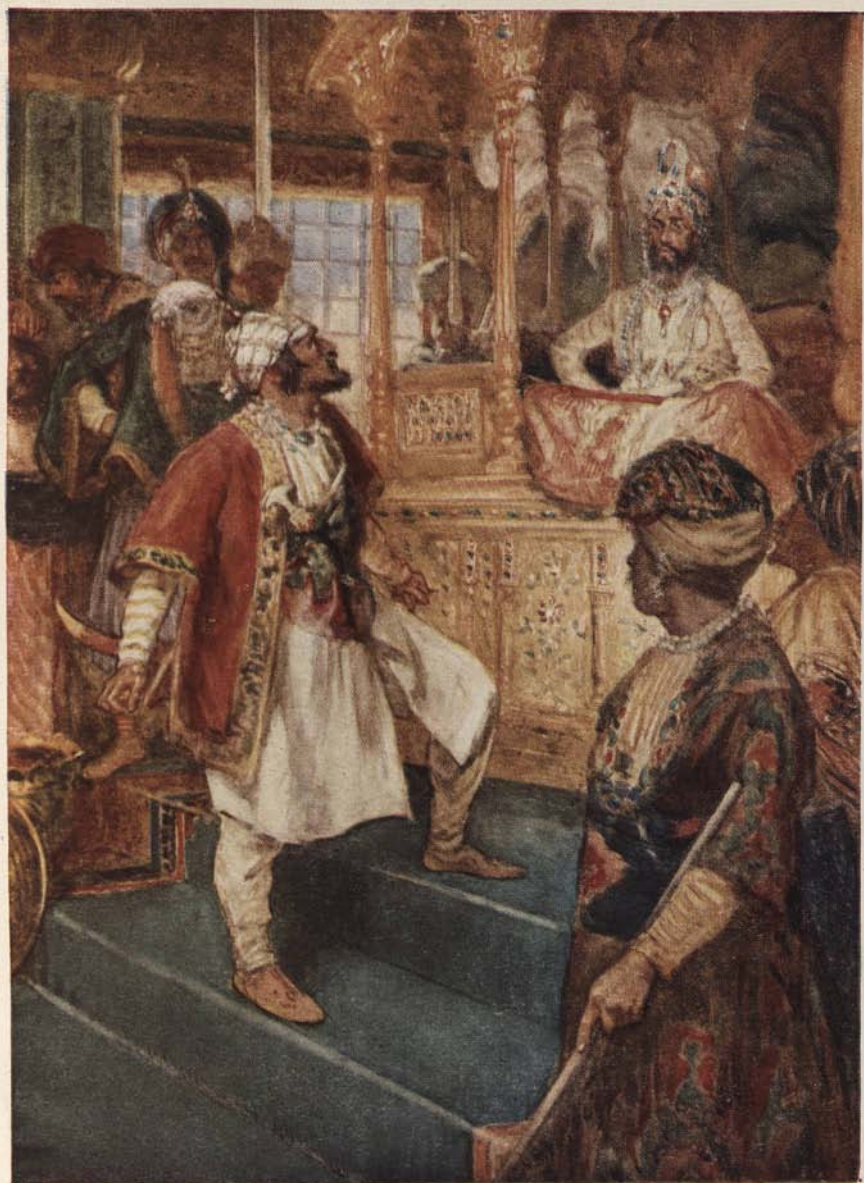
Sivaji openly defies the Great Moghul