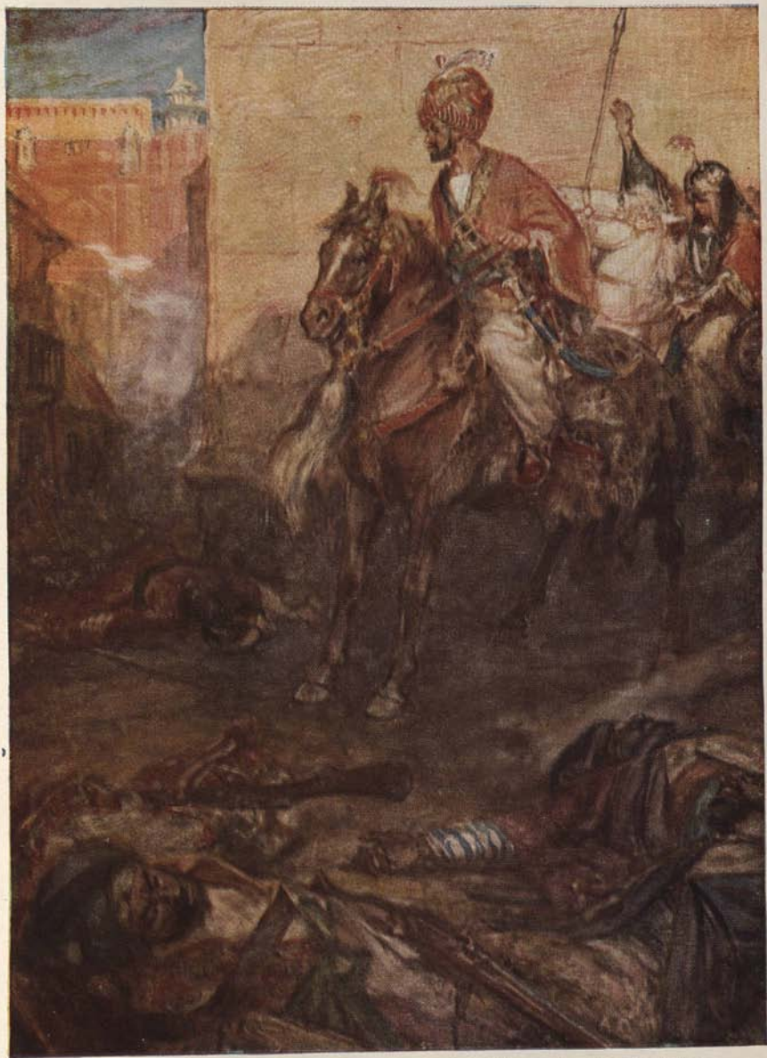
"The first sight that met his gaze was the bodies of his murdered countrymen"