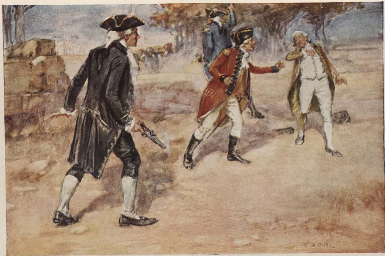
Duel between Warren Hastings and Philip Francis