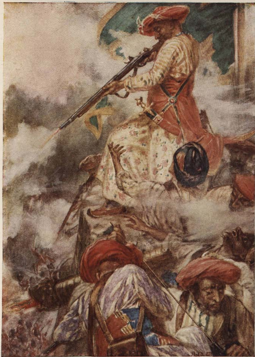
"Tipu himself stood firing coolly at his advancing foes"