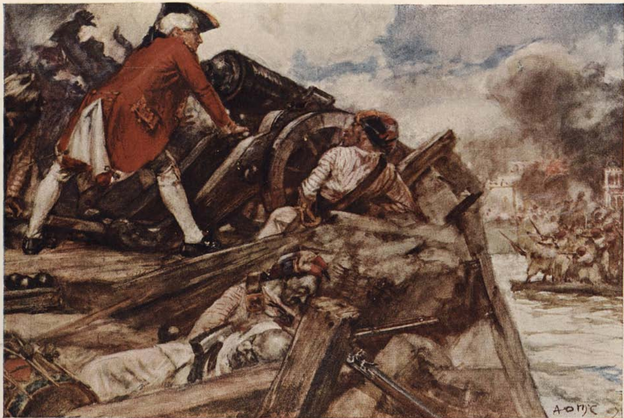
"Clive himself sprang to a gun"