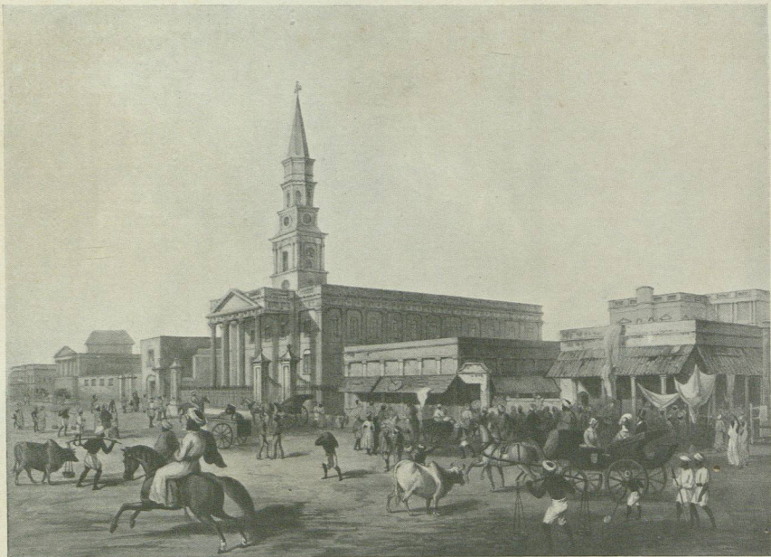
CHURCH ENTRANCE TO DHARAMTOLLAH