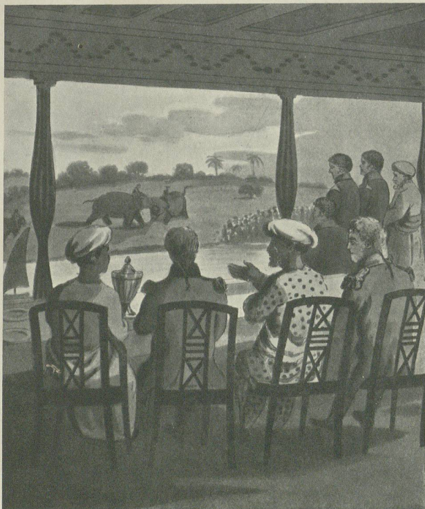
LORD WELLESLEY AT THE NAWAB OF OUDH'S BREAKFAST PARTY AND ELEPHANT FIGHT