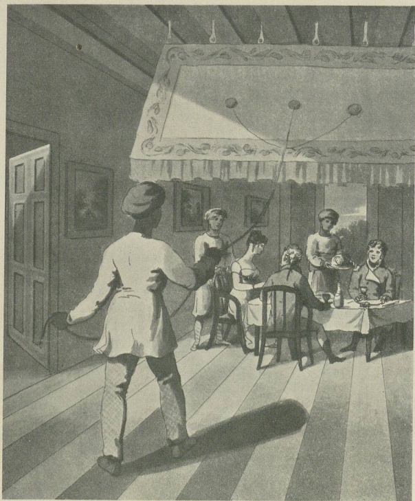
A FAMILY AT TABLE UNDER A PUNKAH