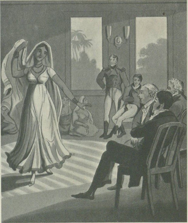
EUROPEANS WATCHING A NAUGHT GIRL DANCING