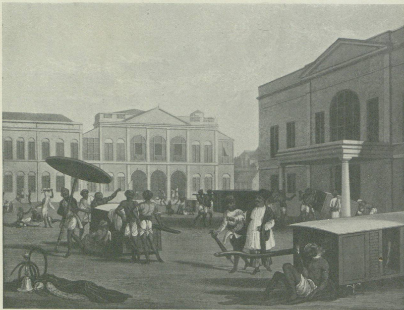
SCENE IN BOMBAY