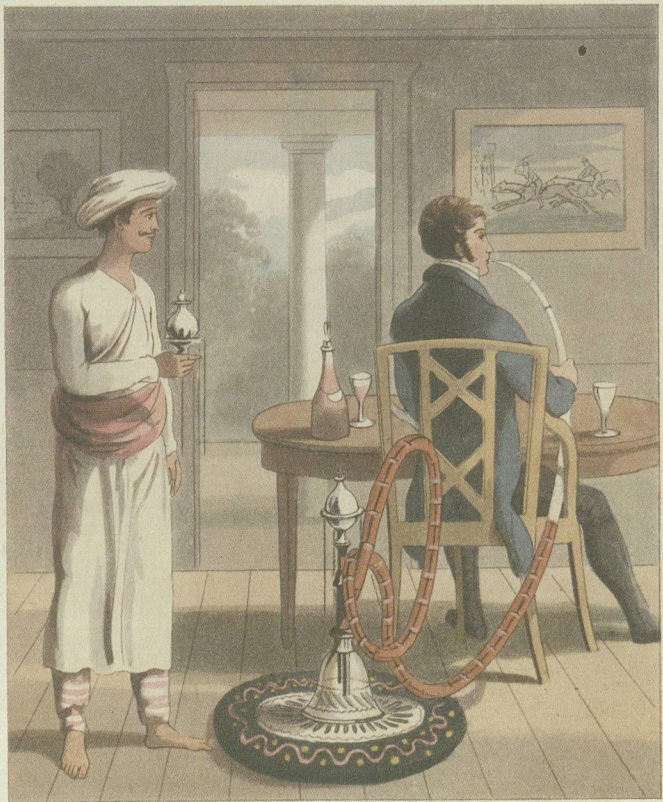
THE NABOB AT HOME