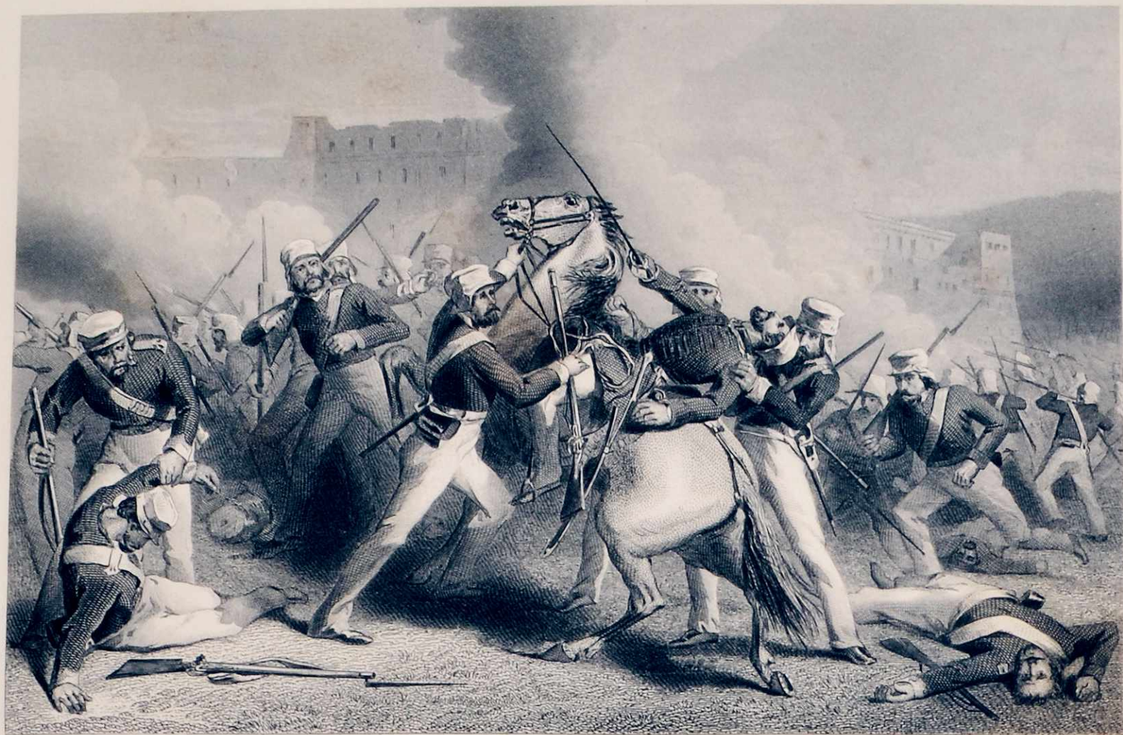
DEATH OF BRIGADIER ADRIAN HOPE, IN THE ATTACK ON THE FORT OF ROODANOW, APRIL 15 TH 1858.