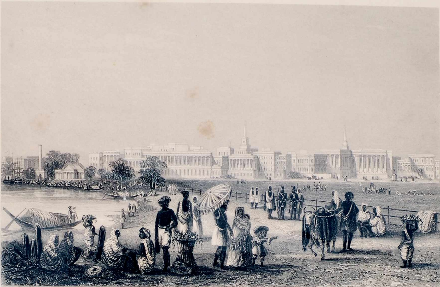
VIEW OF CALCUTTA FROM THE ESPLANADE.