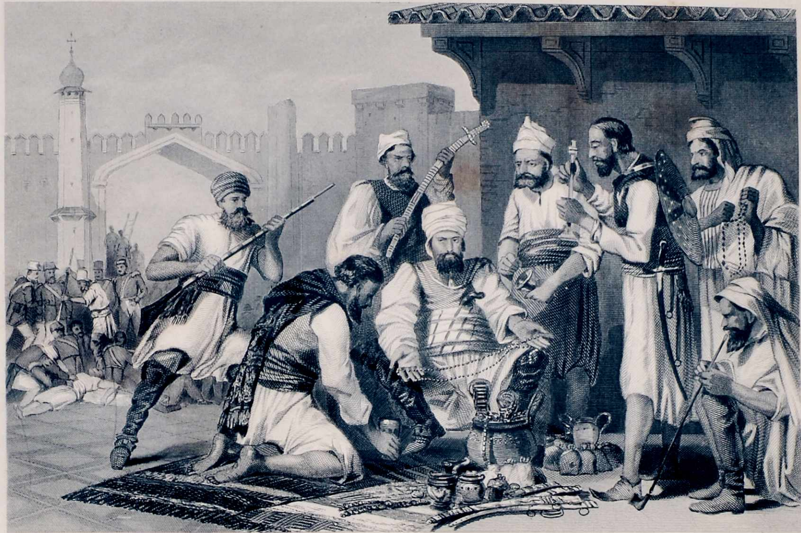
SIKH TROOPS DIVIDING THE SPOIL TAKEN FROM NUTINEERS.