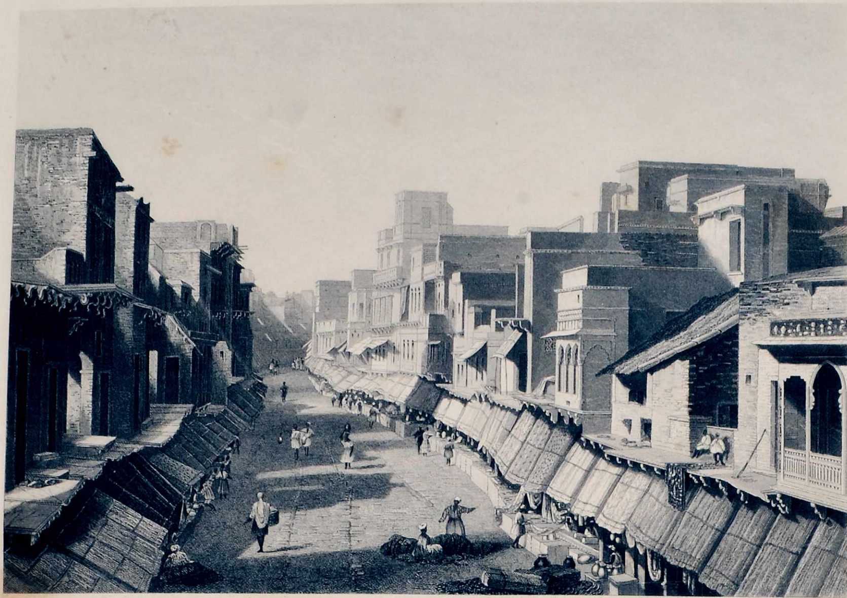
AGRA - VIEW OF PRINCIPAL STREET.