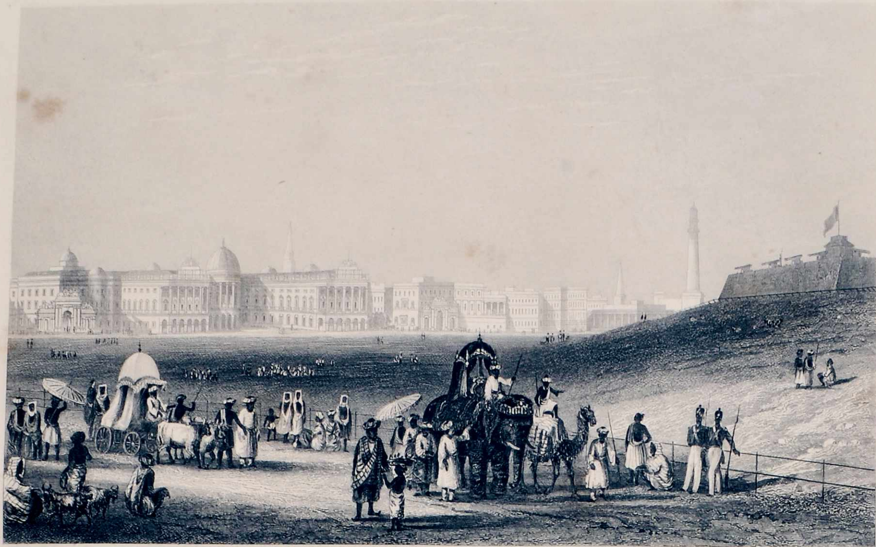
VIEW OF CALCUTTA FROM THE ESPLANADE.