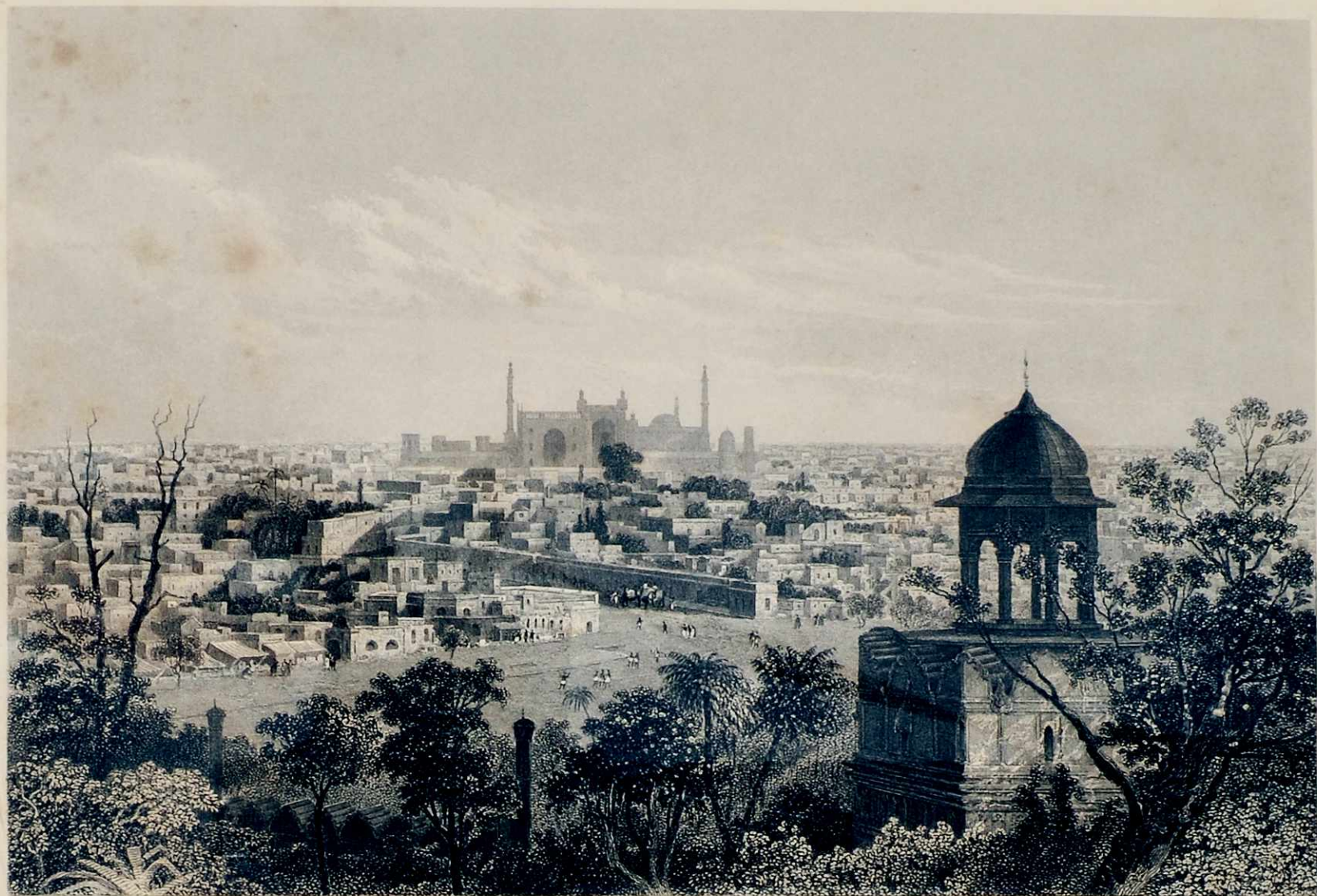
VIEW OF DELHI, FROM THE PALACE GATE.