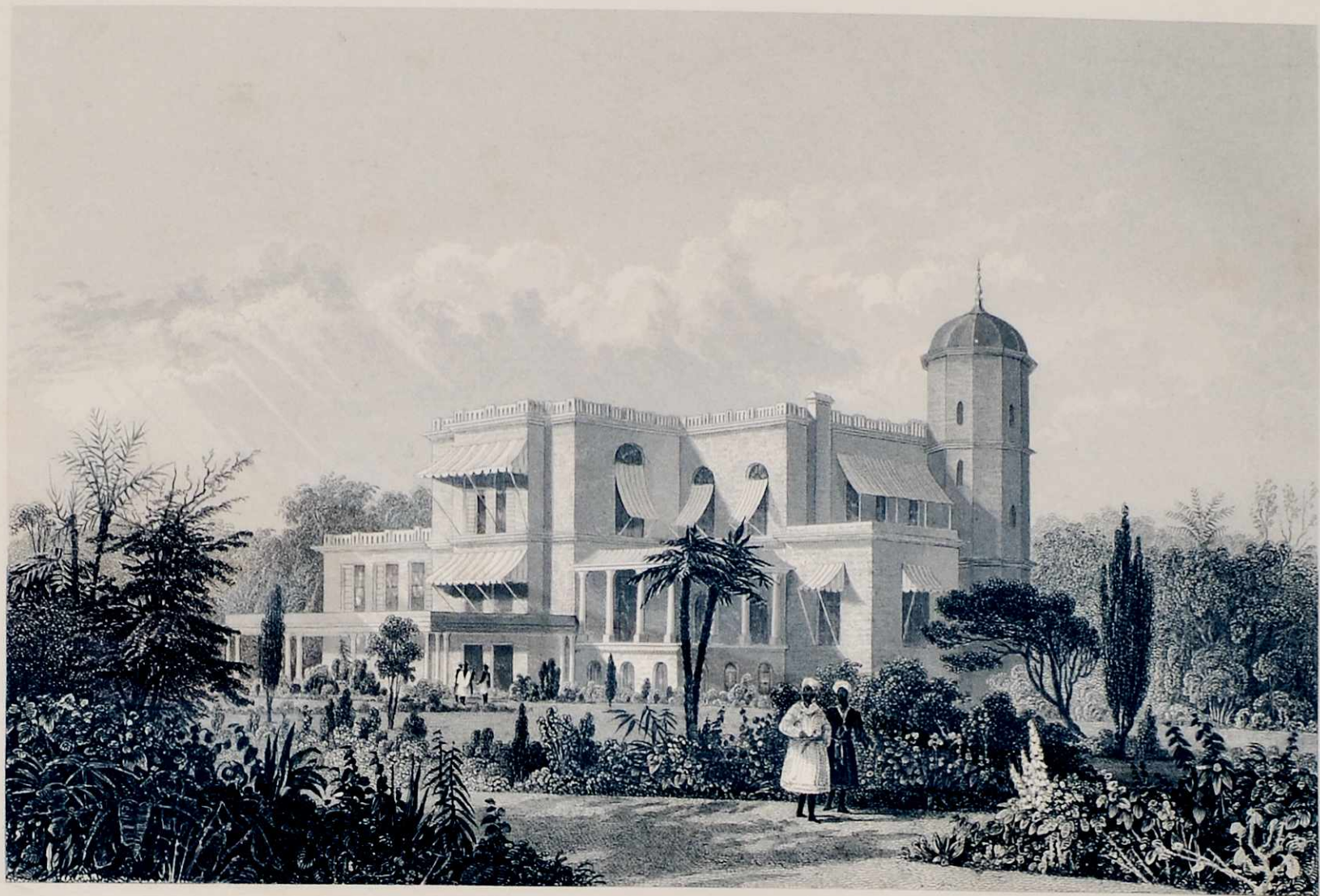
THE RESIDENCY, LUCKNOW.