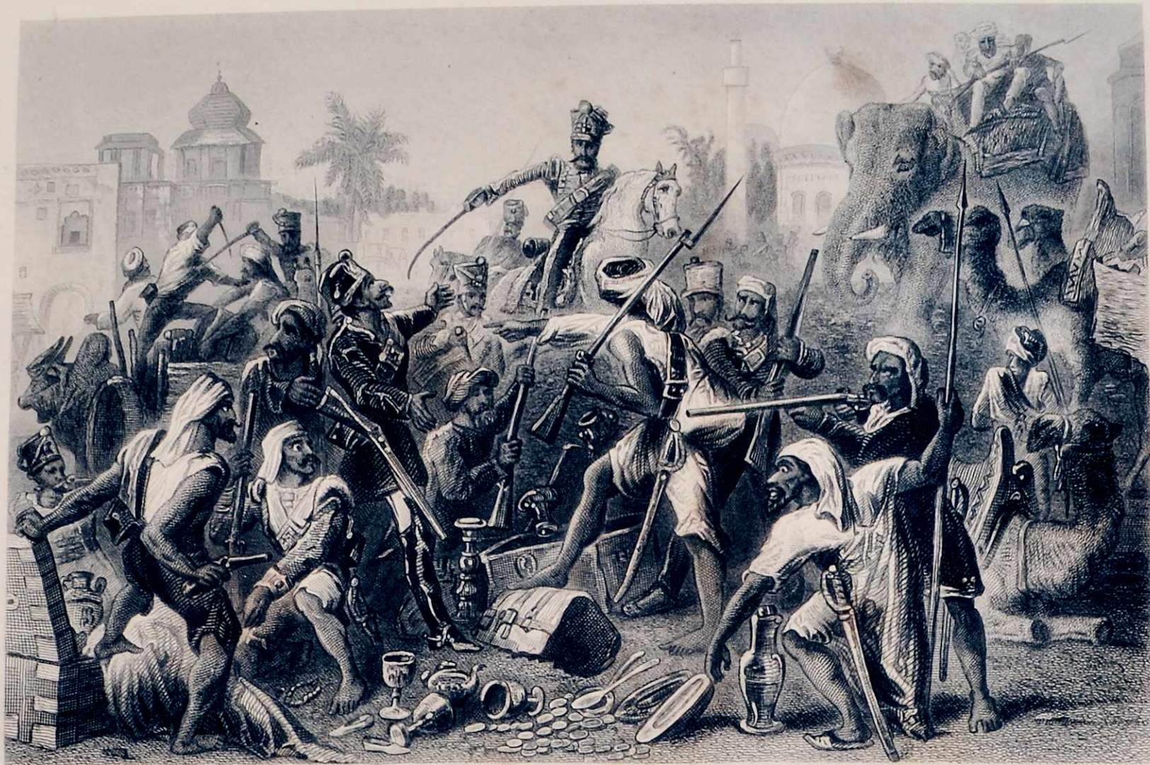
MUTINOUS SEPOYS DIVIDING SPOIL.