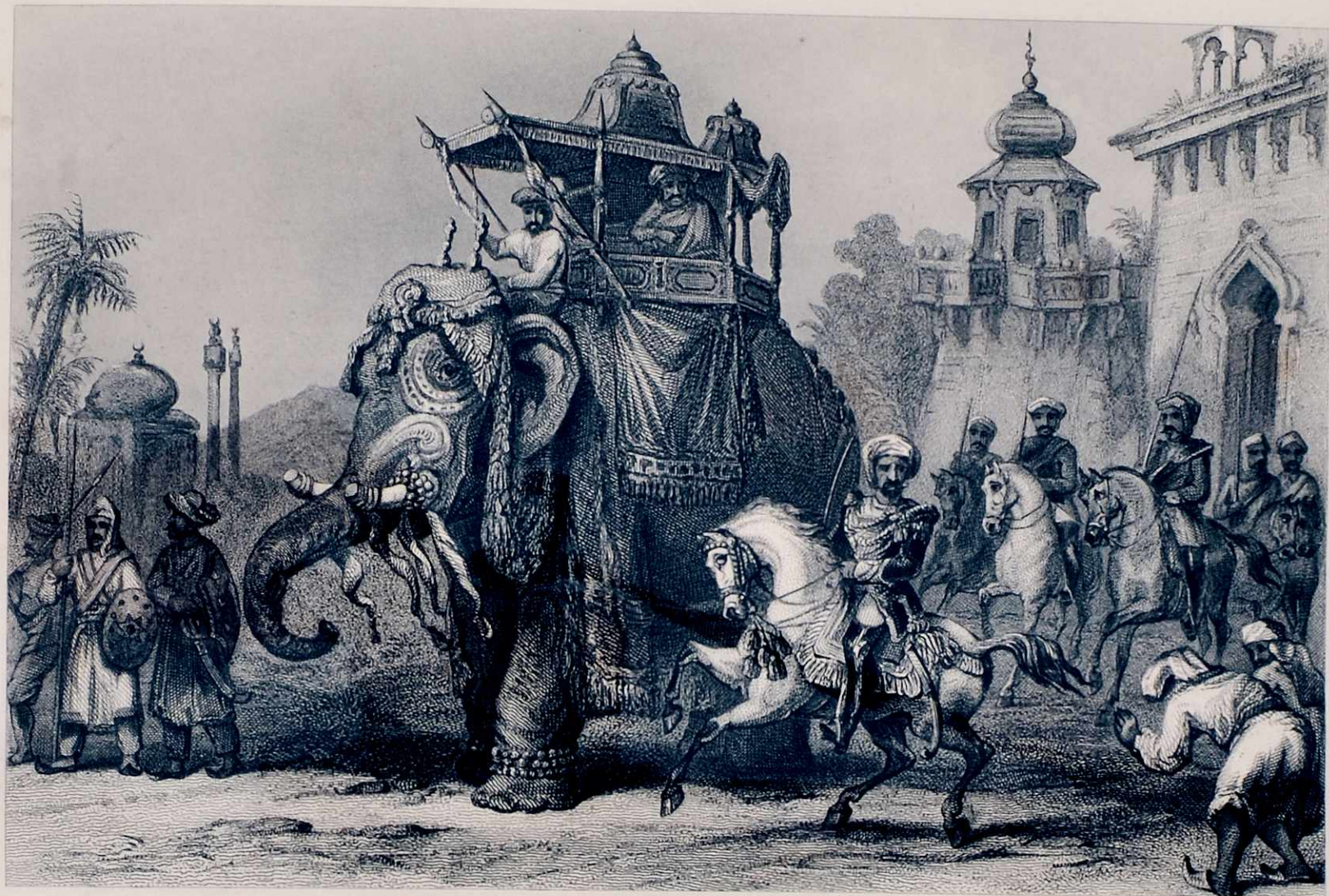
THE NANA SAHIB WITH HIS ESCORT LEAVING LUCKNOW TO MEET THE REBEL FORCE ADVANCING FROM MAIWA.