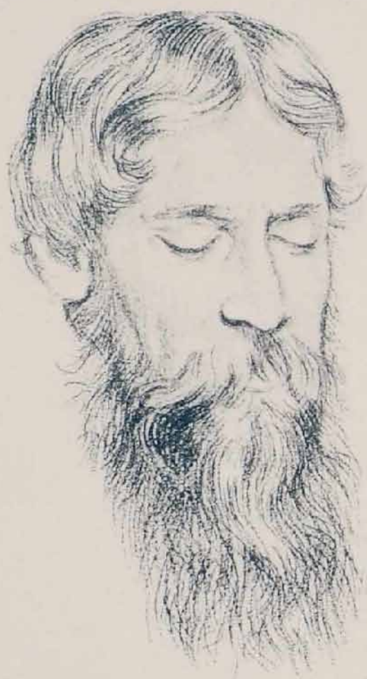
Sir Rabindranath Tagore From a Drawing by W. Rothenstein