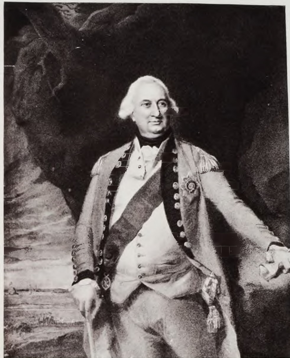
CHARLES, 1ST MARQUIS CORNWALLIS By Benjamin Smith After J. S. Copley