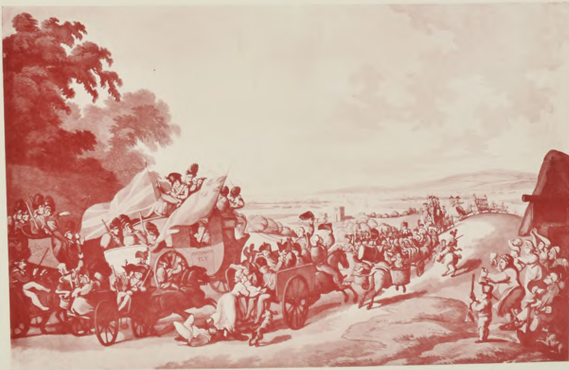
AN EXTRAORDINARY SCENE ON THE ROAD FROM LONDON TO PORTSMOUTH By Schulz, after Rowlandson