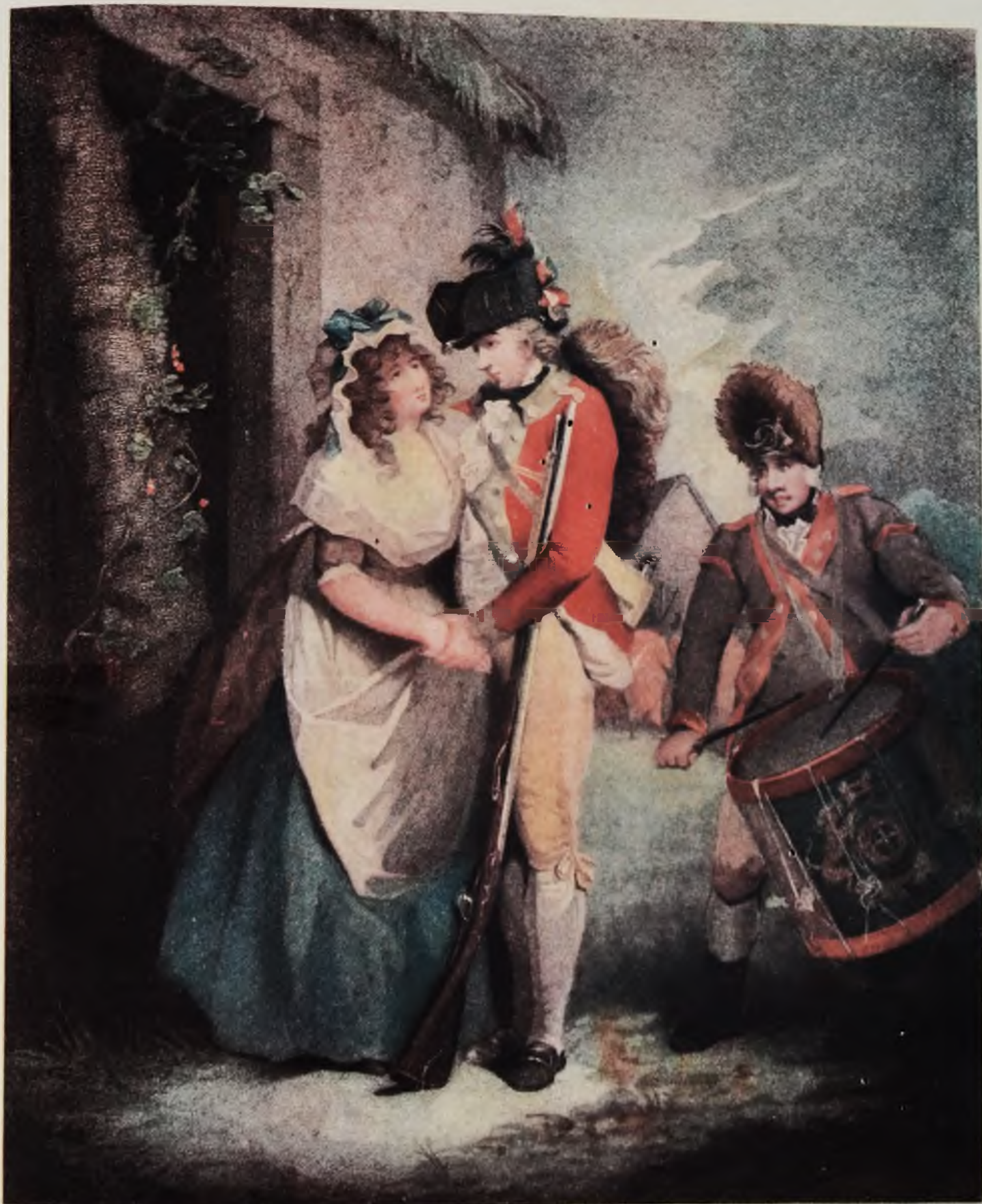
THE BILLITED SOLDIER'S DEPARTURE Engraved by Graham, after George Morland