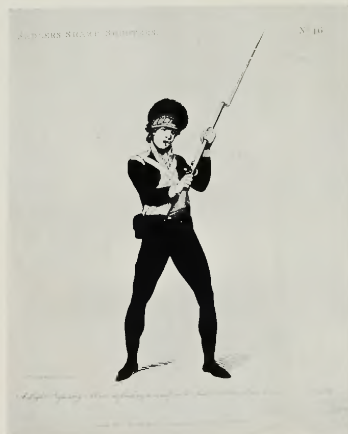
By Thos. Rowlandson