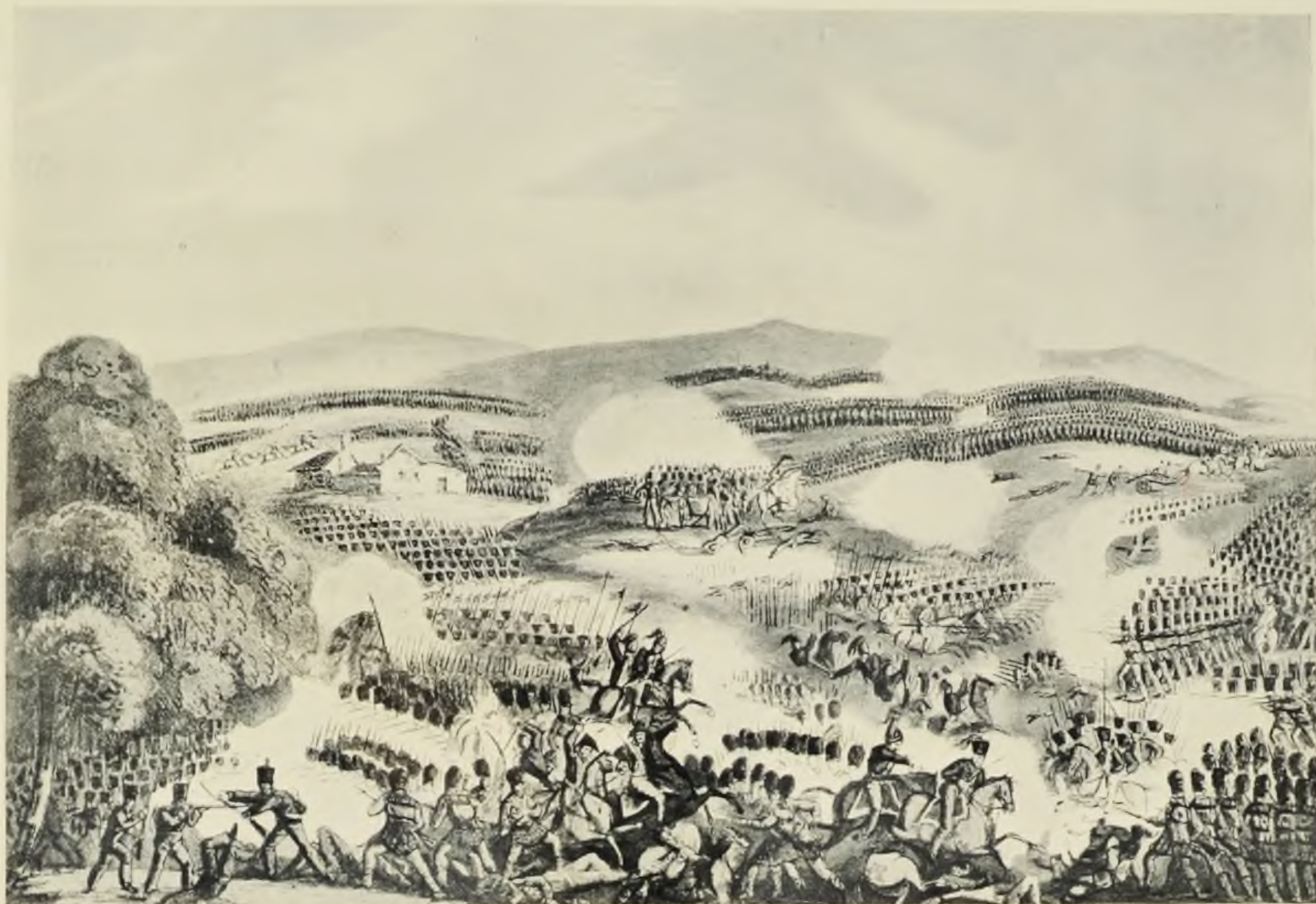
BATTLE OF QUATRE BRAS, JUNE 16, 1815 By T. Sutherland, after W. Heath