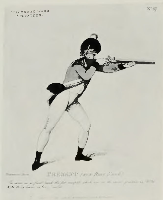
By Thos. Rowlandson