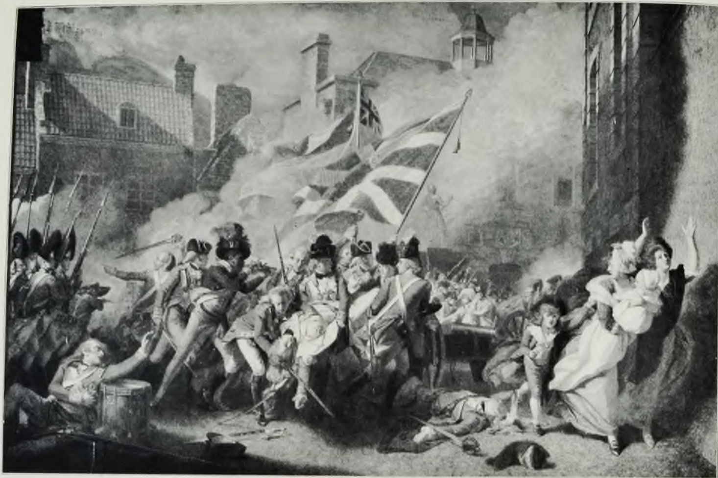
DEATH OF MAJOR PIERSON By J. Heath, after Copley