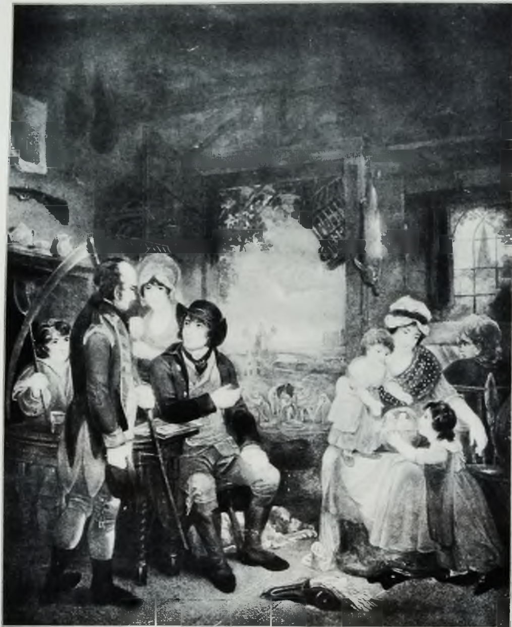
PEACE By Whessell, after H. Singleton