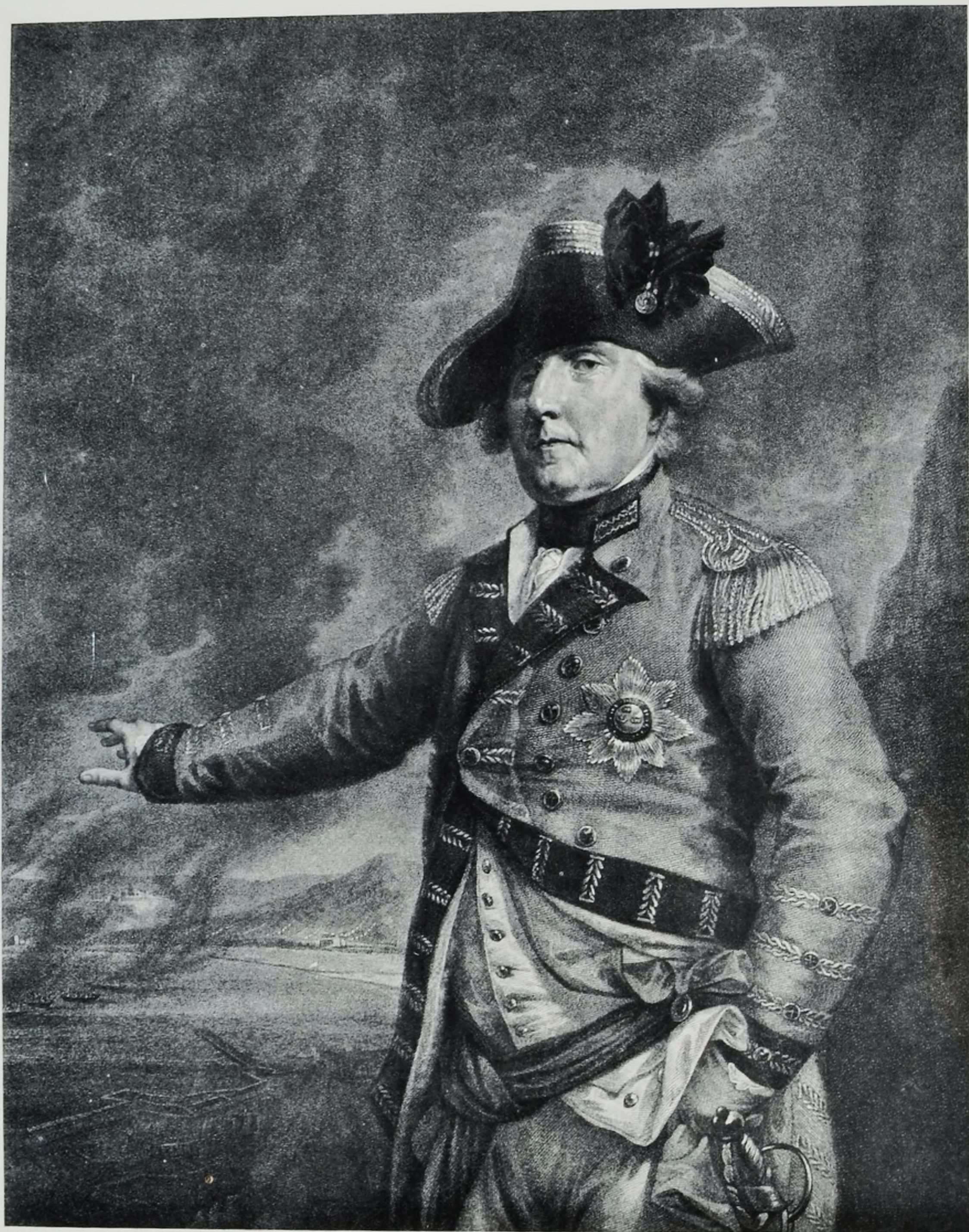
GEORGE AUGUSTUS ELLIOT (LORD HEATHFIELD) GOVERNOR OF GIBRALTAR