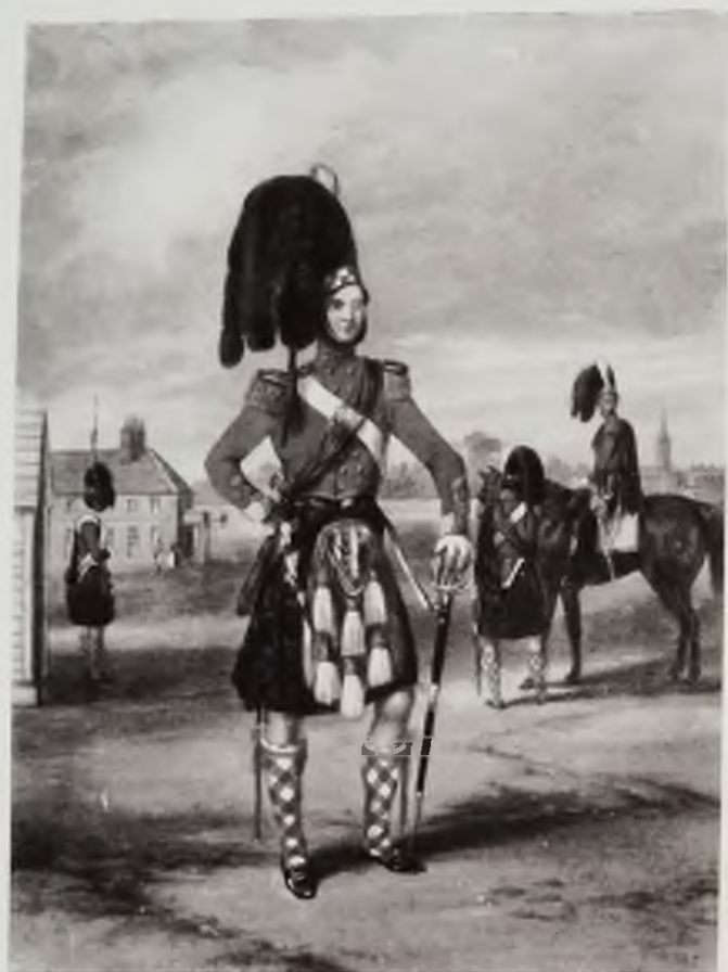
THE 93RD (SUTHERLAND) HIGHLANDERS (REVIEW ORDER)