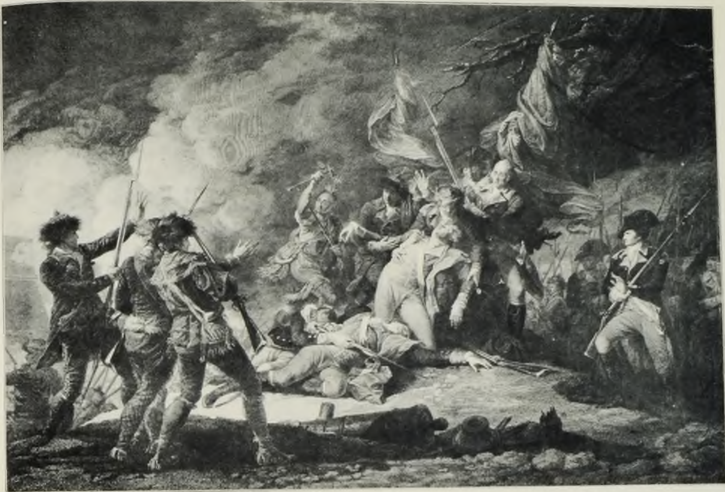
DEATH OF GENERAL MONTGOMERY By J. T. Clemens, after Trumbull