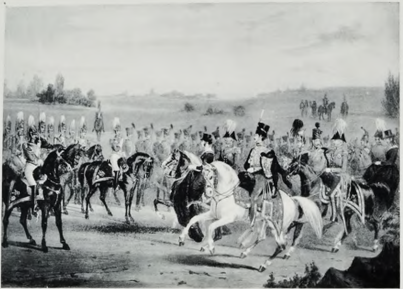
REVIEW OF THE 1ST LIFE GUARDS AND 5TH HUSSARS, JUNE 4TH, 1842.