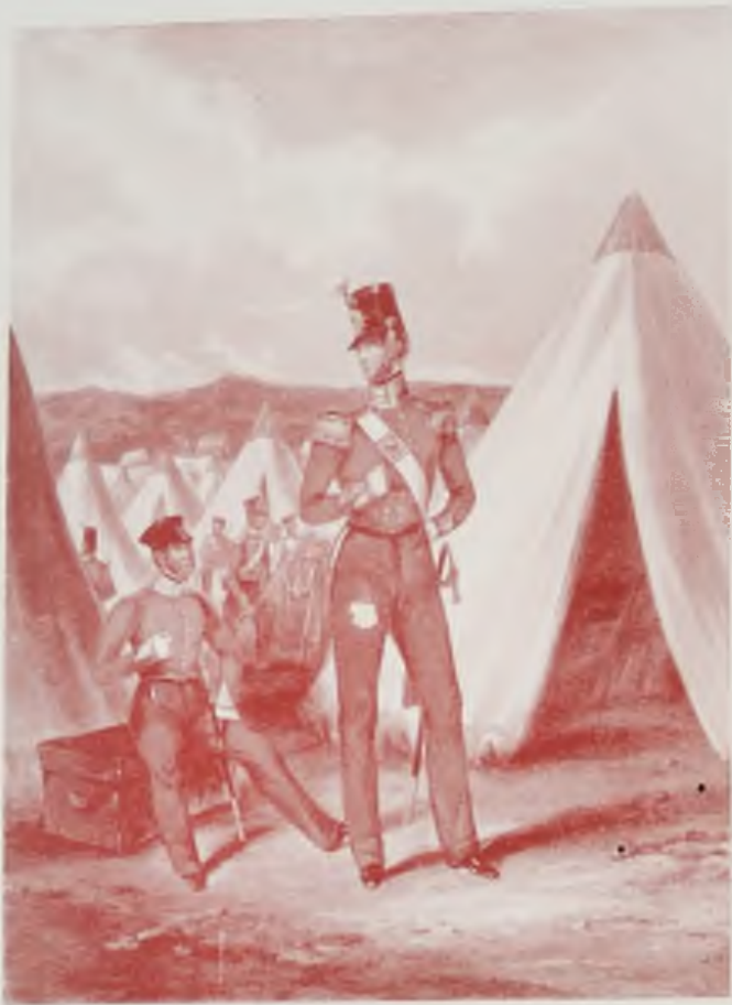
38TH (1ST STAFFORDSHIRE)