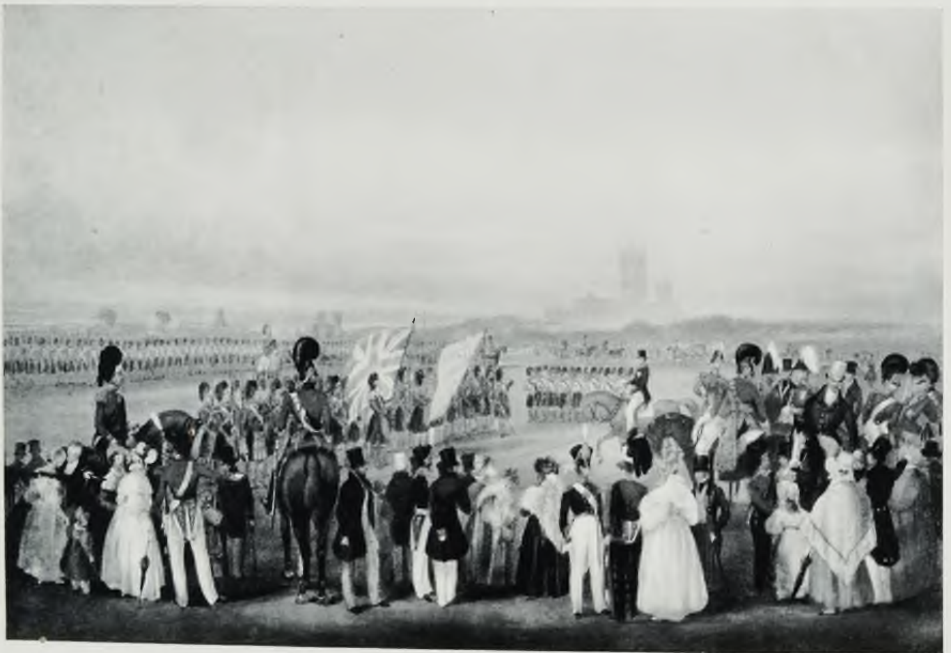
PRESENTING NEW COLOURS TO THE 93RD HIGHLANDERS, OCT. 7TH, 1834