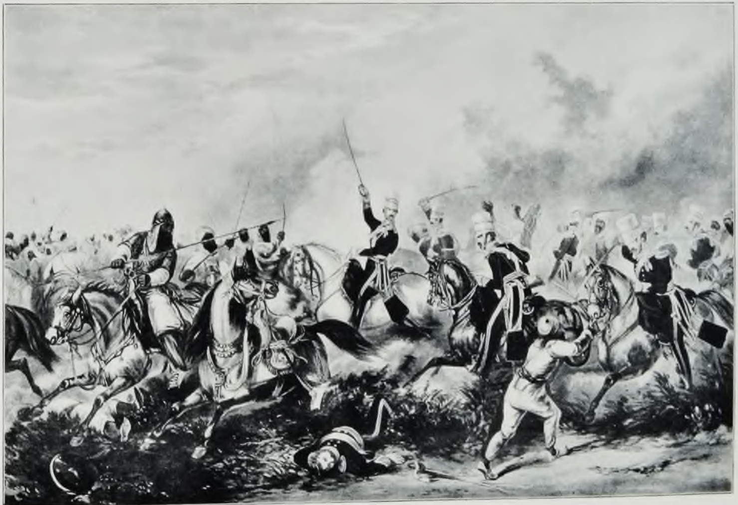
THE 3RD LIGHT DRAGOONS AT CHILLIENWALLAH, 1849