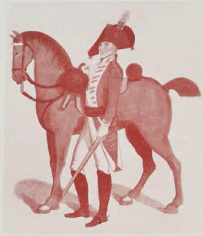
3RD (OR PRINCE OF WALES'S) DRAGOON GUARDS From the "British Military Library"