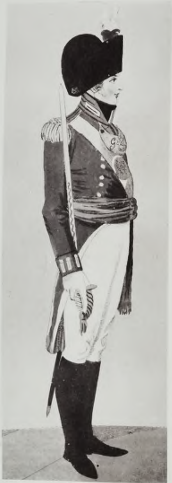
56TH REGIMENT OF FOOT From the "British Military Library"