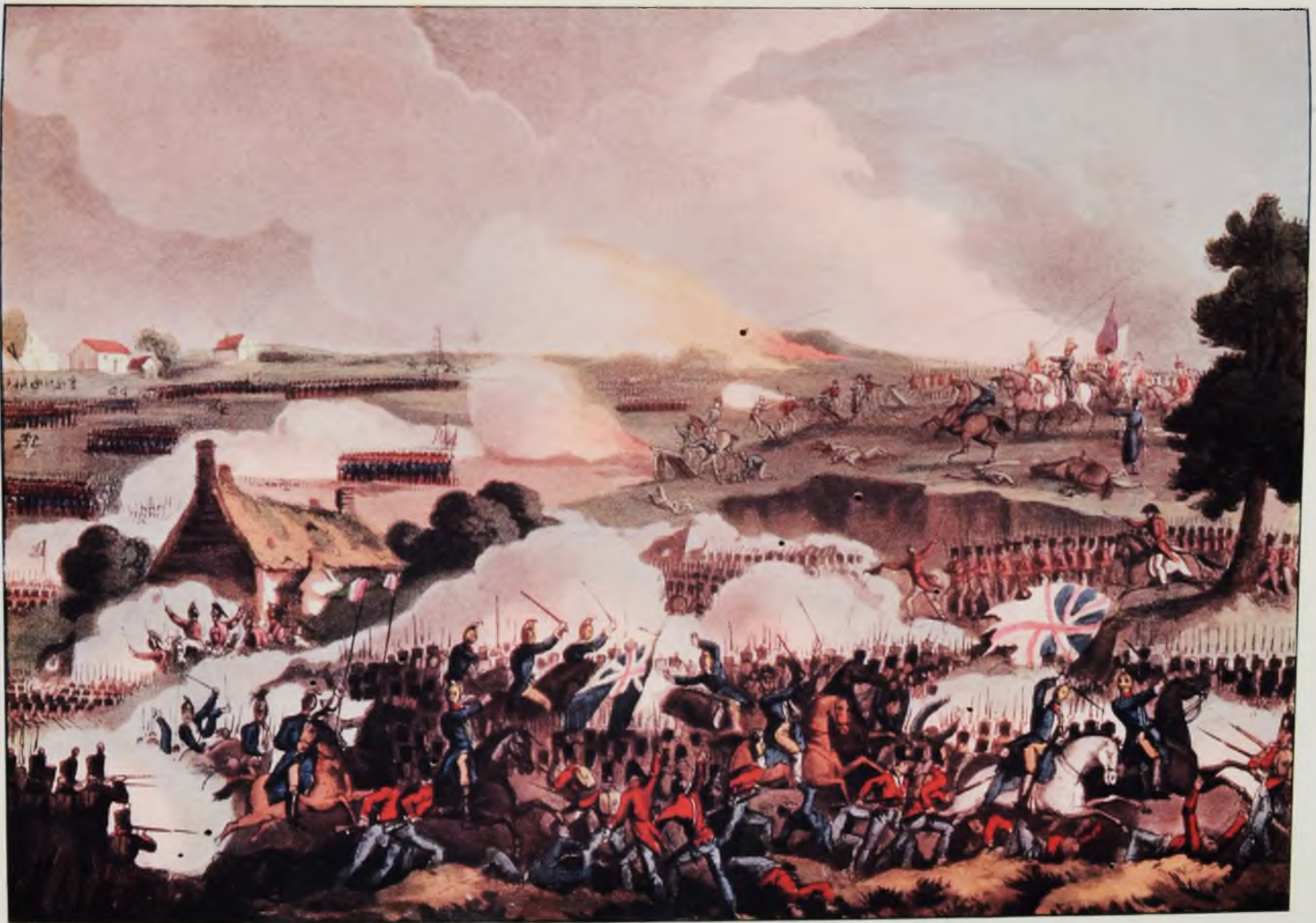
THE CENTRE OF THE BRITISH ARMY IN ACTION AT THE BATTLE OF WATERLOO, JUNE 18, 1815 By T. Sutherland, after W. Heath