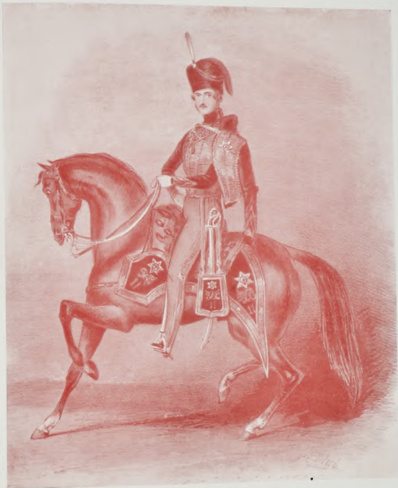
HIS ROYAL HIGHNESS PRINCE ALBERT, COLONEL OF THE 11TH HUSSARS From a Lithograph, after Brandard