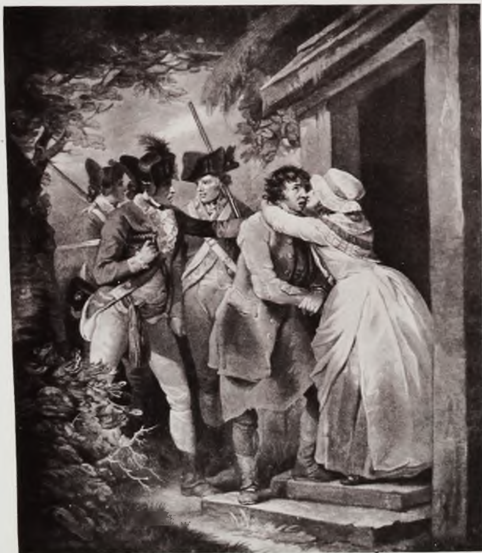
DESERTER TAKING LEAVE OF HIS WIFE By G. Keating After G. Morland