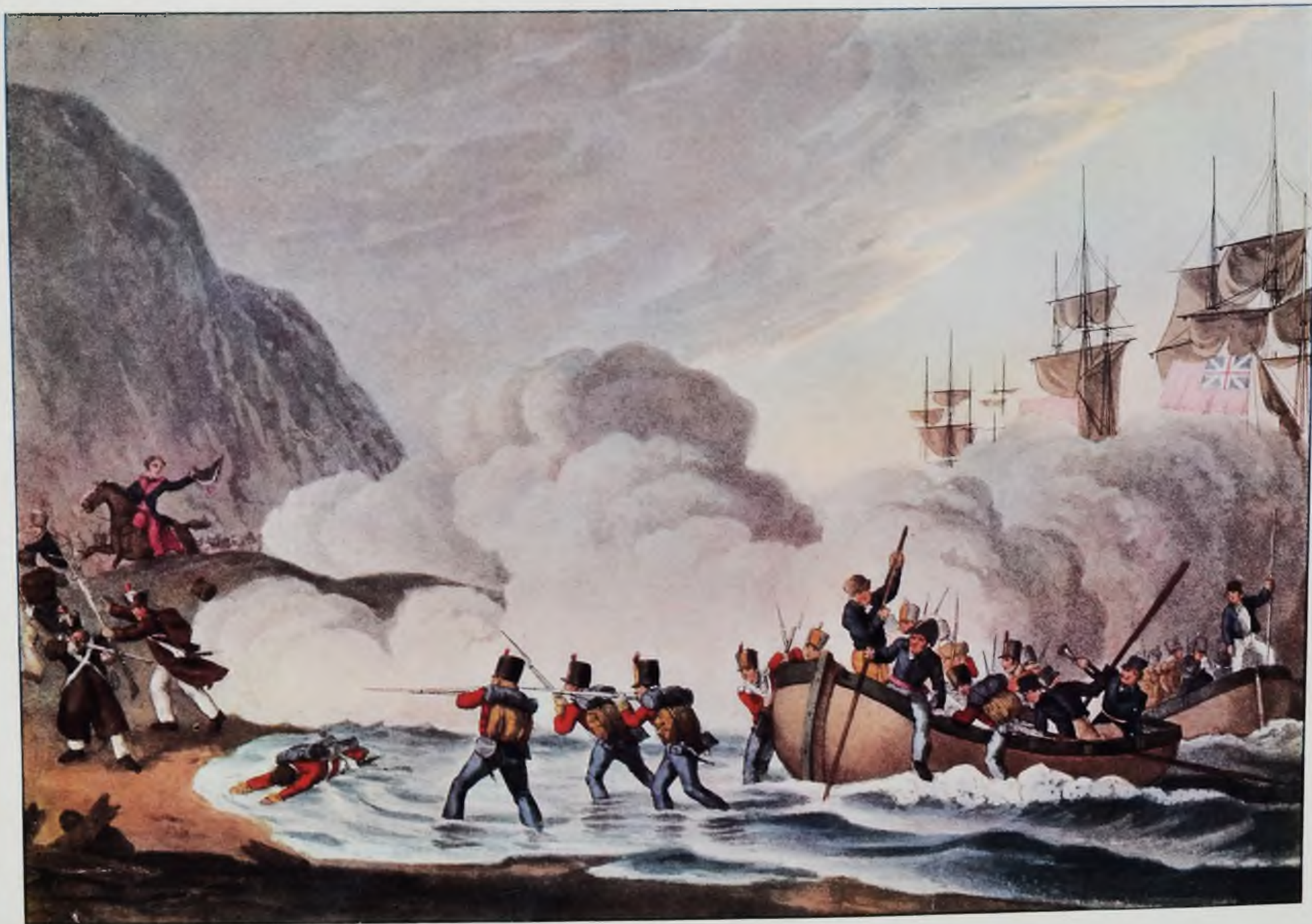
LANDING TROOPS IN THE FACE OF THE ENEMY