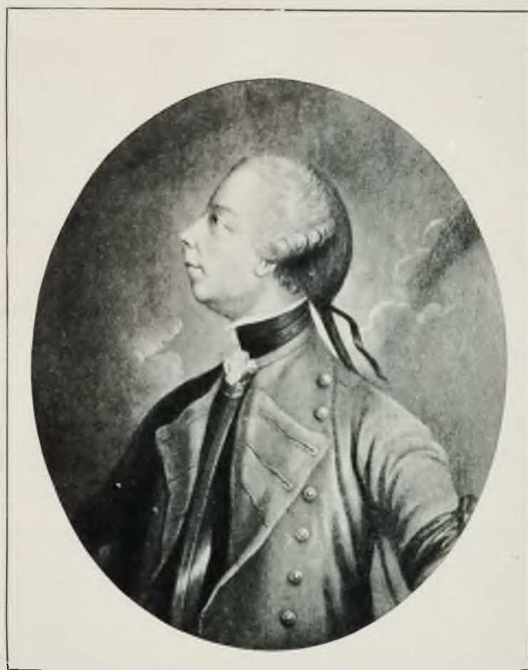
GENERAL WOLFE From an Engraving by Houston