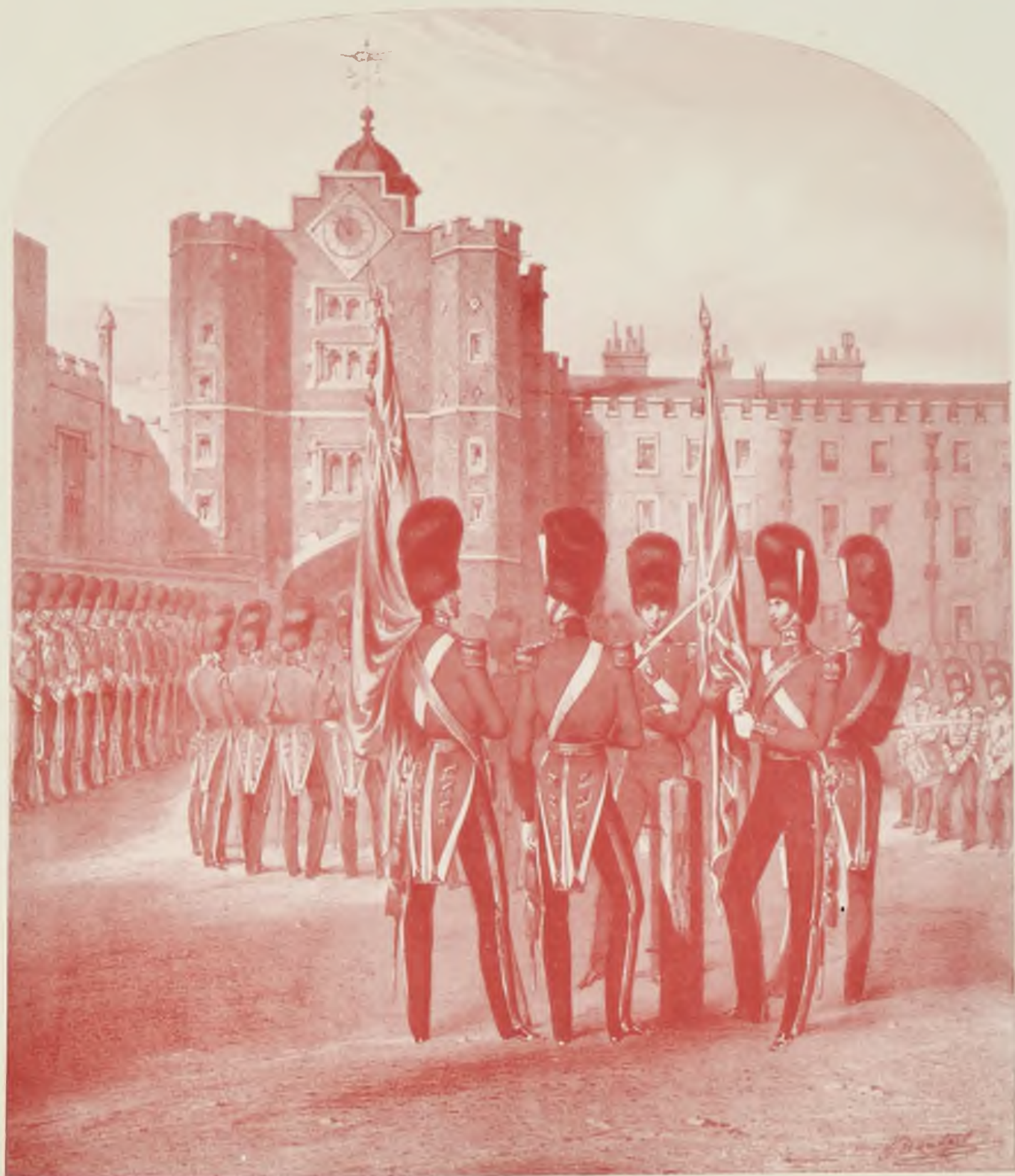
THE GRENADIER GUARDS AT ST. JAMES'S PALACE