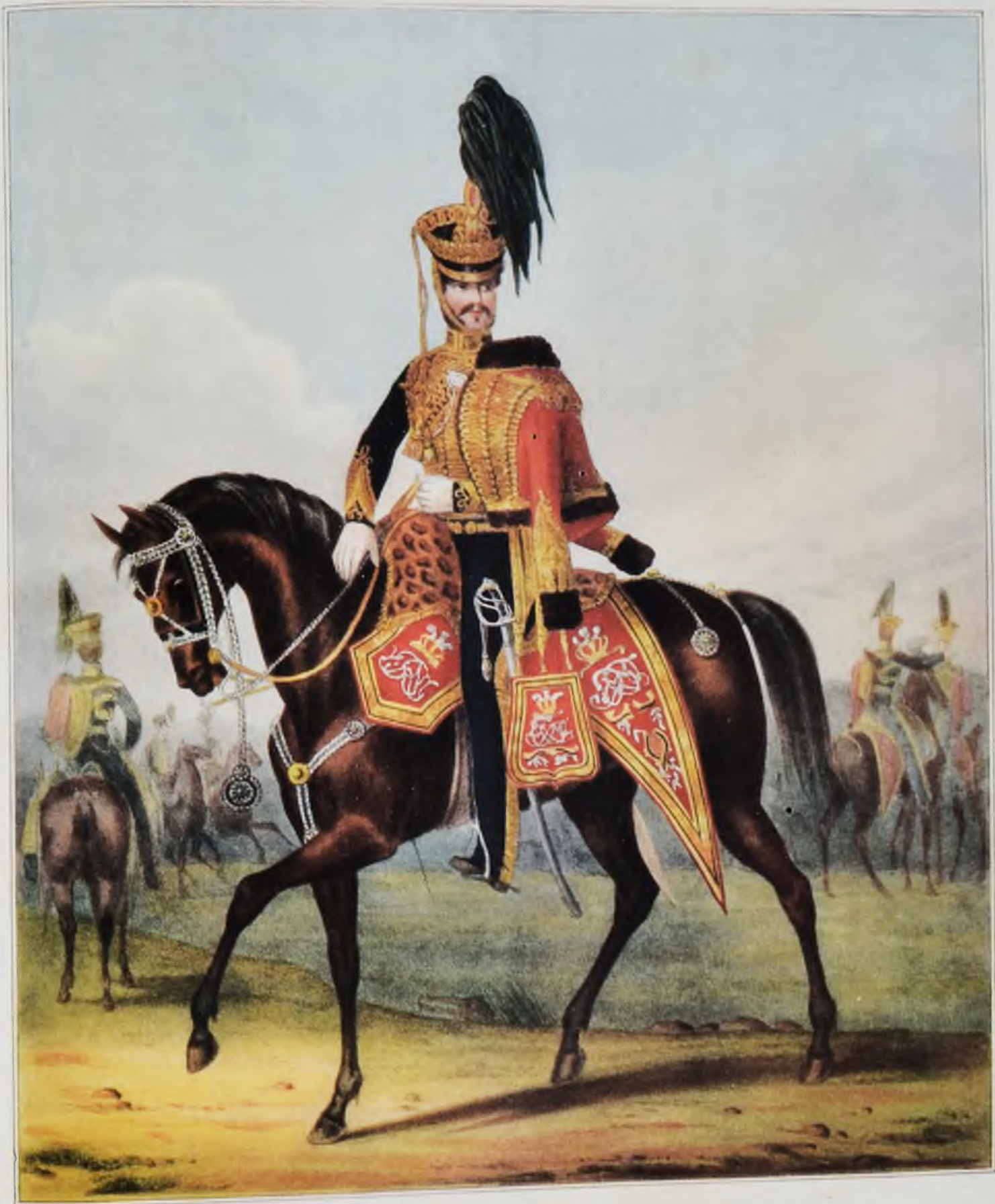
OFFICER OF THE 10TH (THE PRINCE OF WALES'S OWN) ROYAL REGIMENT OF HUSSARS By L. Mansion and L. Eschautier