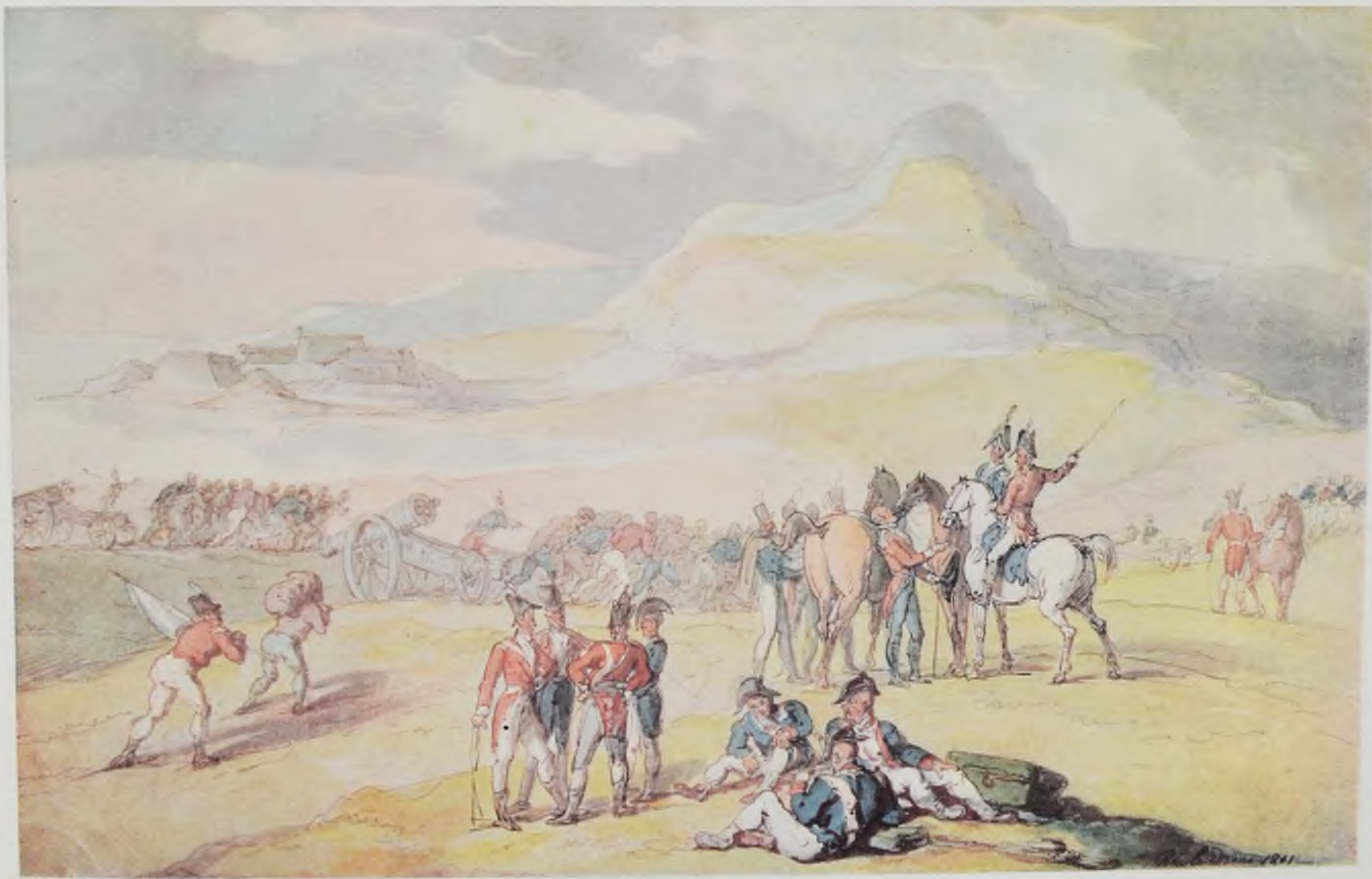
MILITARY SCENE. LANDING TROOPS AND GUNS From a Drawing by Rowlandson, 1801