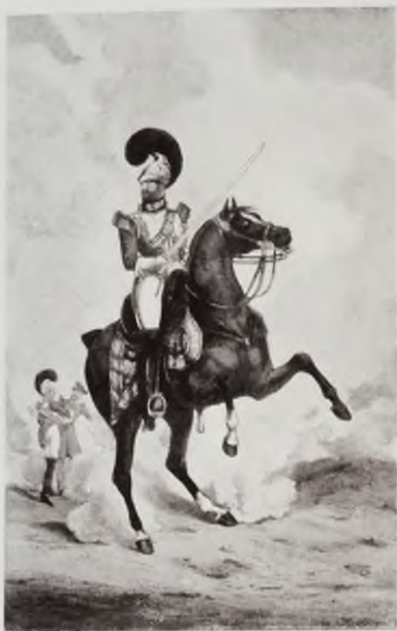
OFFICER, LIFE GUARDS By H. Alken