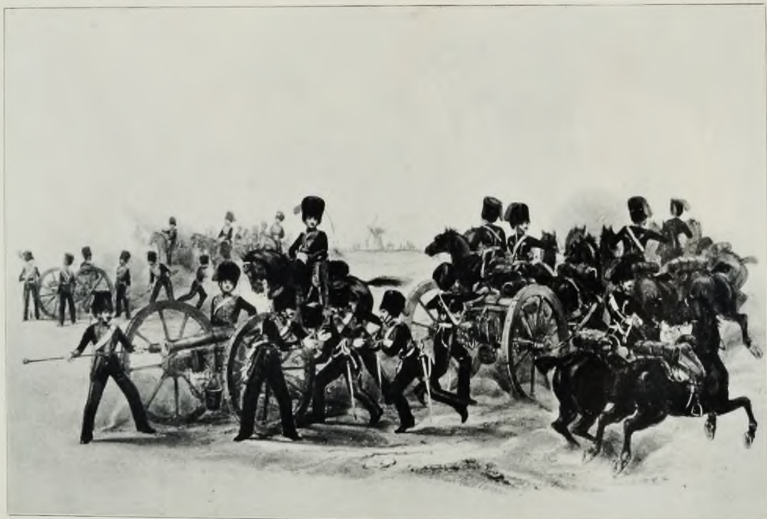
THE ROYAL HORSE ARTILLERY From a Lithograph, after Campion (1846)