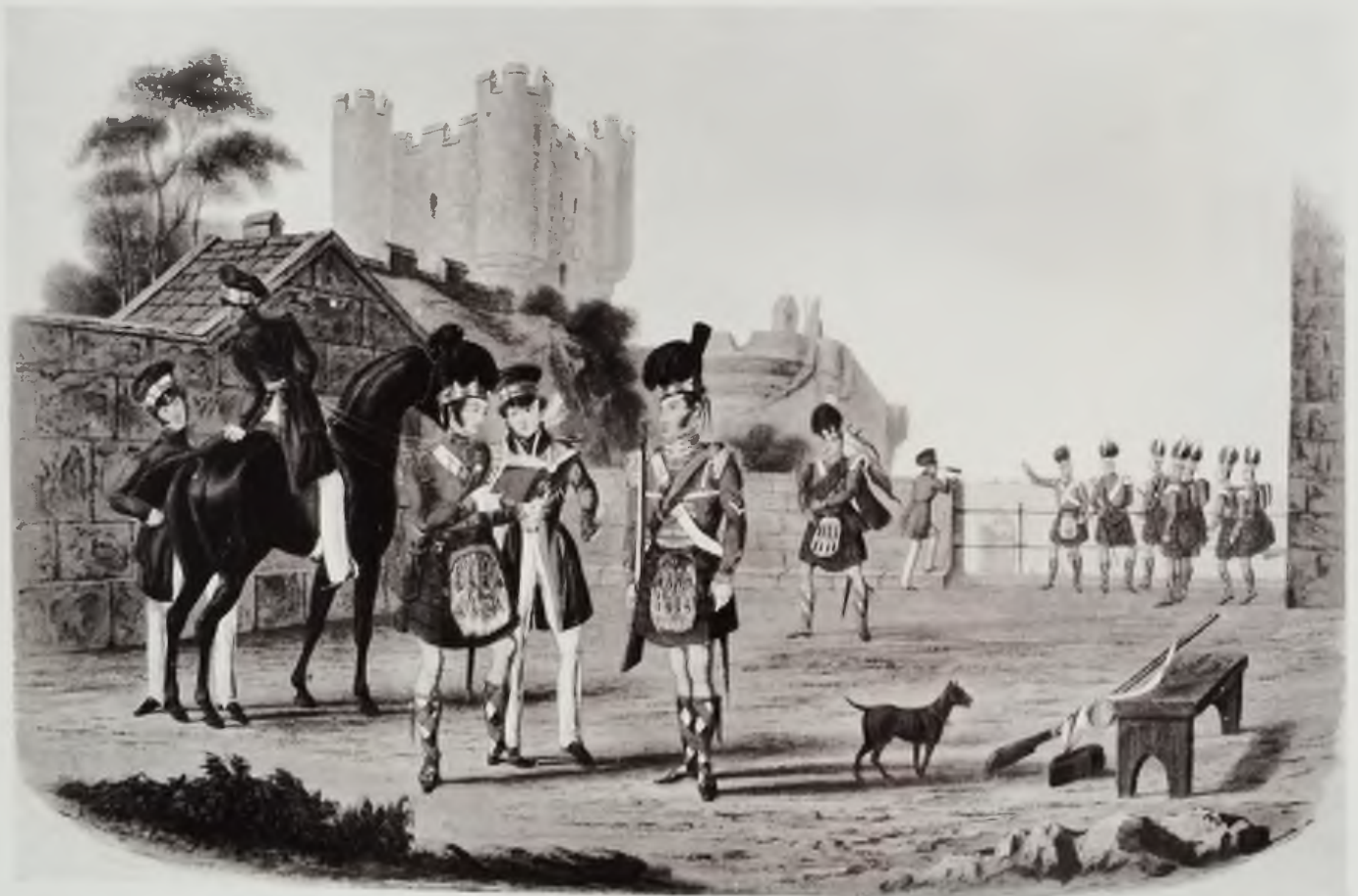
92ND HIGHLANDERS (AN ILLUSTRIOUS STRANGER IN SIGHT) By Reeve, after C. B. Newhouse