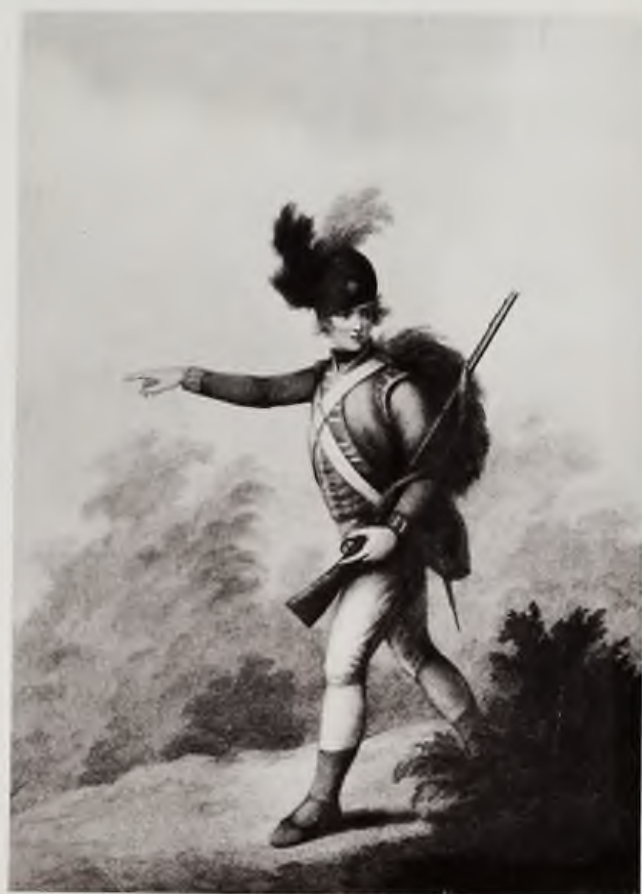
LIGHT INFANTRY MAN (1791) By F. D. Soiron, after H. Bunbury