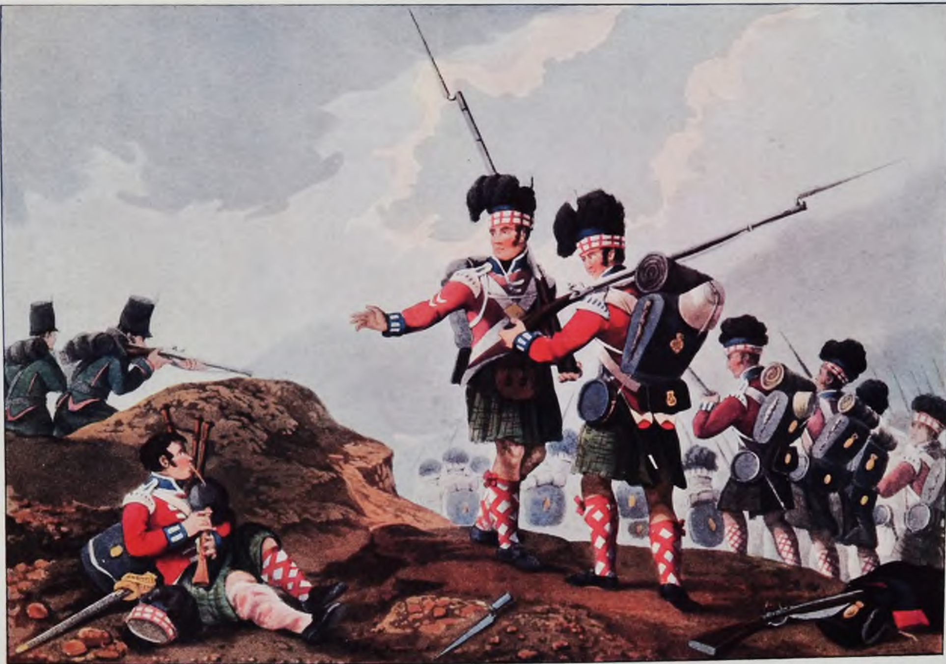
BRAVERY OF A PIPER OF THE 11TH HIGHLAND REGIMENT, AT THE BATTLE OF VIMIERA