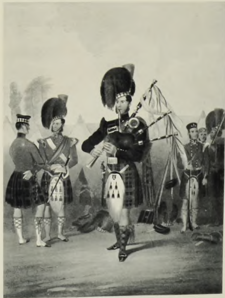
PIPER, 42ND ROYAL HIGHLANDERS From an Engraving, after B. Clayton