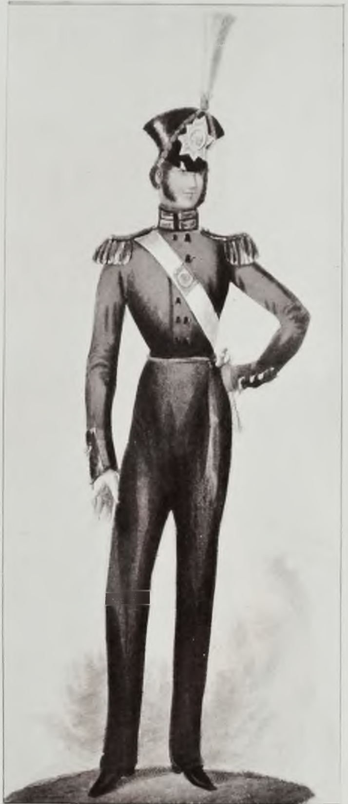
94TH REGIMENT OF FOOT (1830) From the "Gentleman's Magazine of Fashion" (1830)