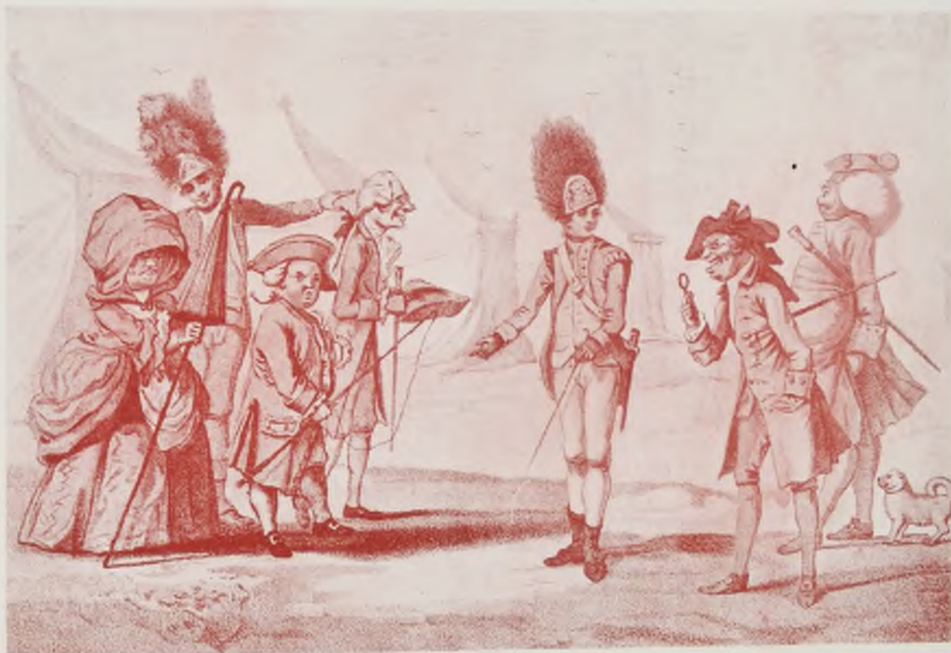
A VISIT TO CAMP By H. Bunbury