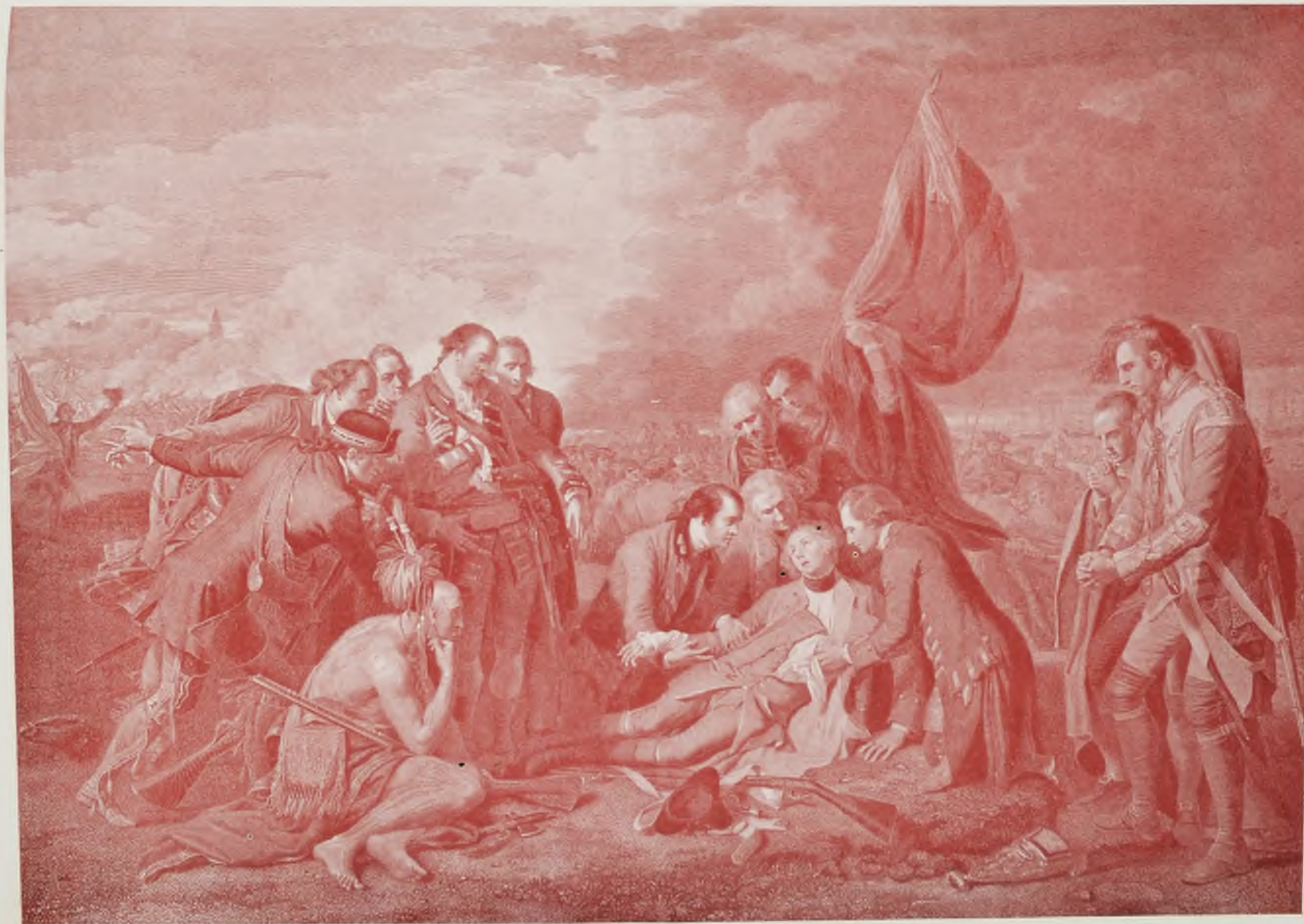
THE DEATH OF GENERAL WOLFE By W. Woollett, after B. West