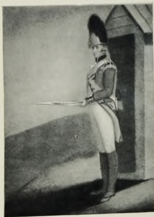
PRIVATE, GRENADIER GUARDS (1760) From a Water Colour Drawing