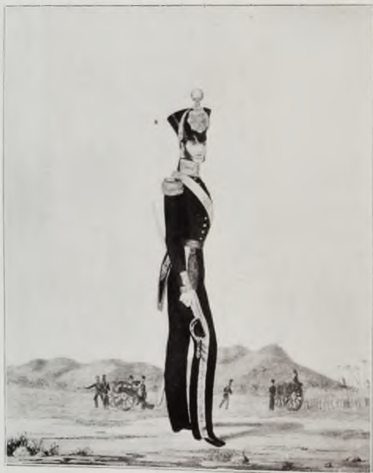
OFFICERS OF THE MADRAS ARMY (FOOT ARTILLERY) By Wm. Hunsley, 1841