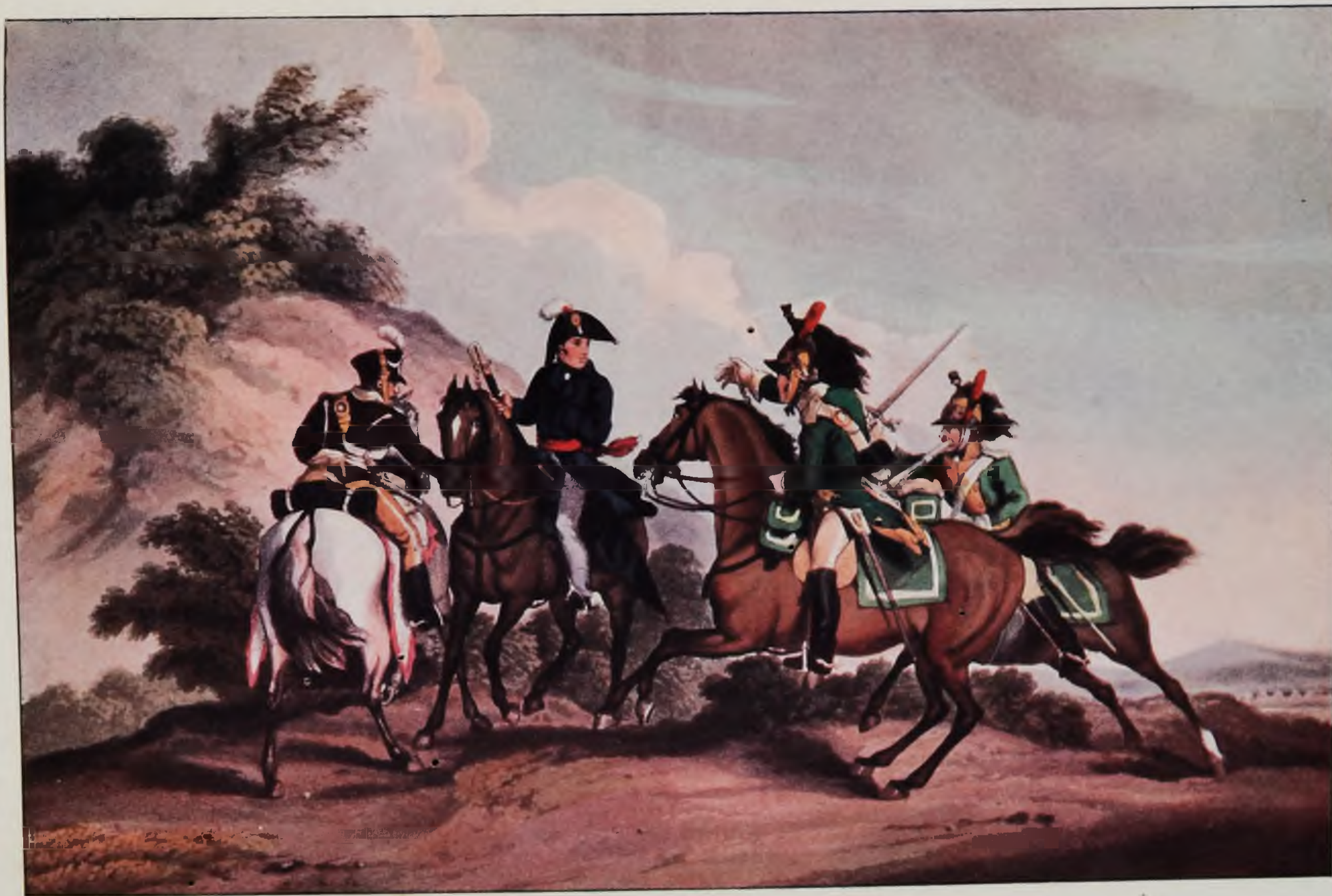
CAPTURE OF GENERAL PAGET, 1812 By Dubourg, after Atkinson