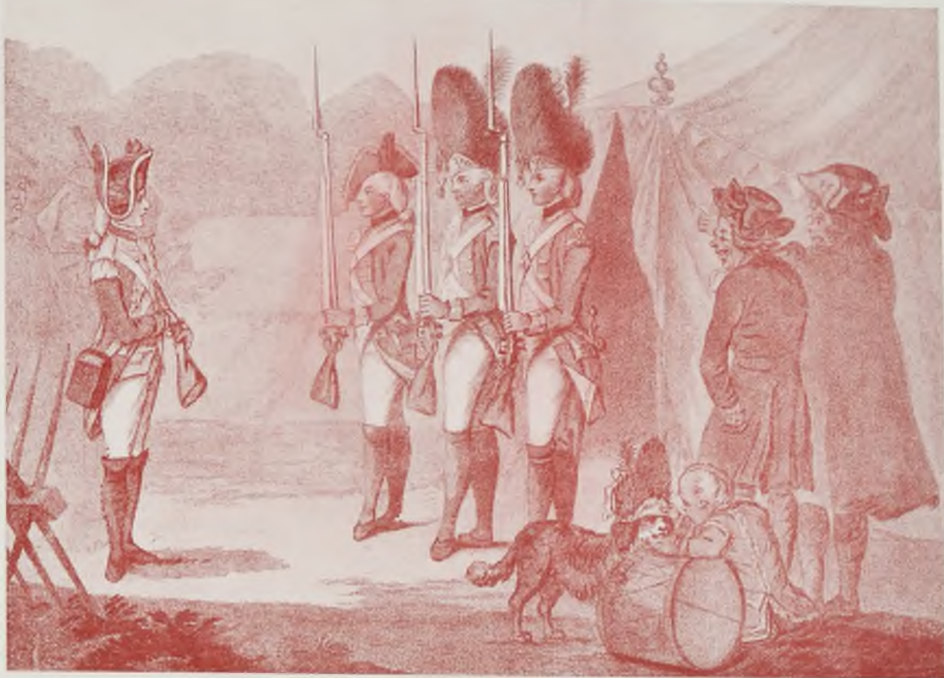
THE RELIEF (1781) By W. Dickinson, after H. Bunbury