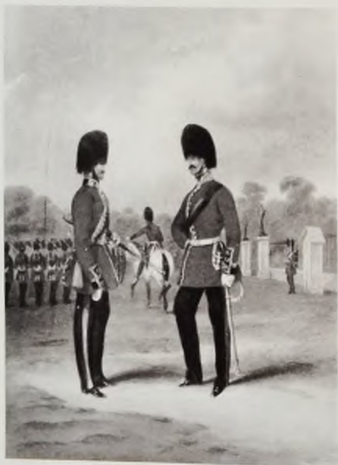
SCOTS FUSILIER GUARDS