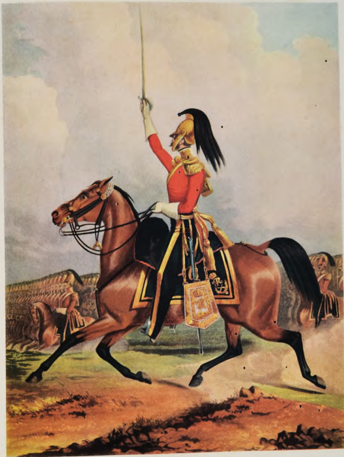
6TH DRAGOON GUARDS. OFFICER (CARABINIERS)