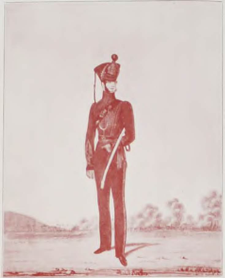
OFFICER OF THE MADRAS ARMY (RIFLES)