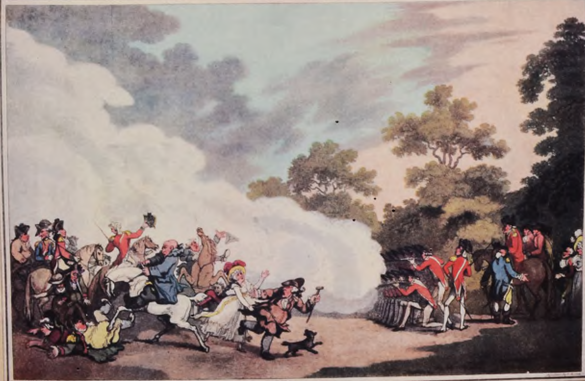
A FIELD DAY IN HYDE PARK.