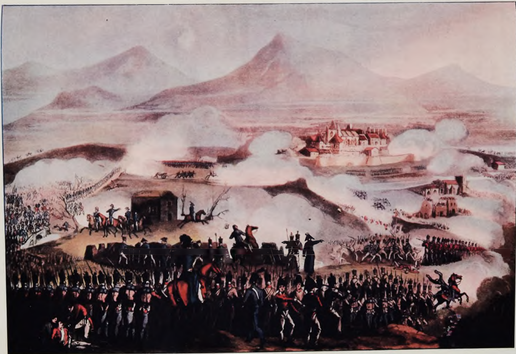
BATTLE OF TOULOUSE, APRIL 10, 1814 By T. Sutherland, after W. Heath