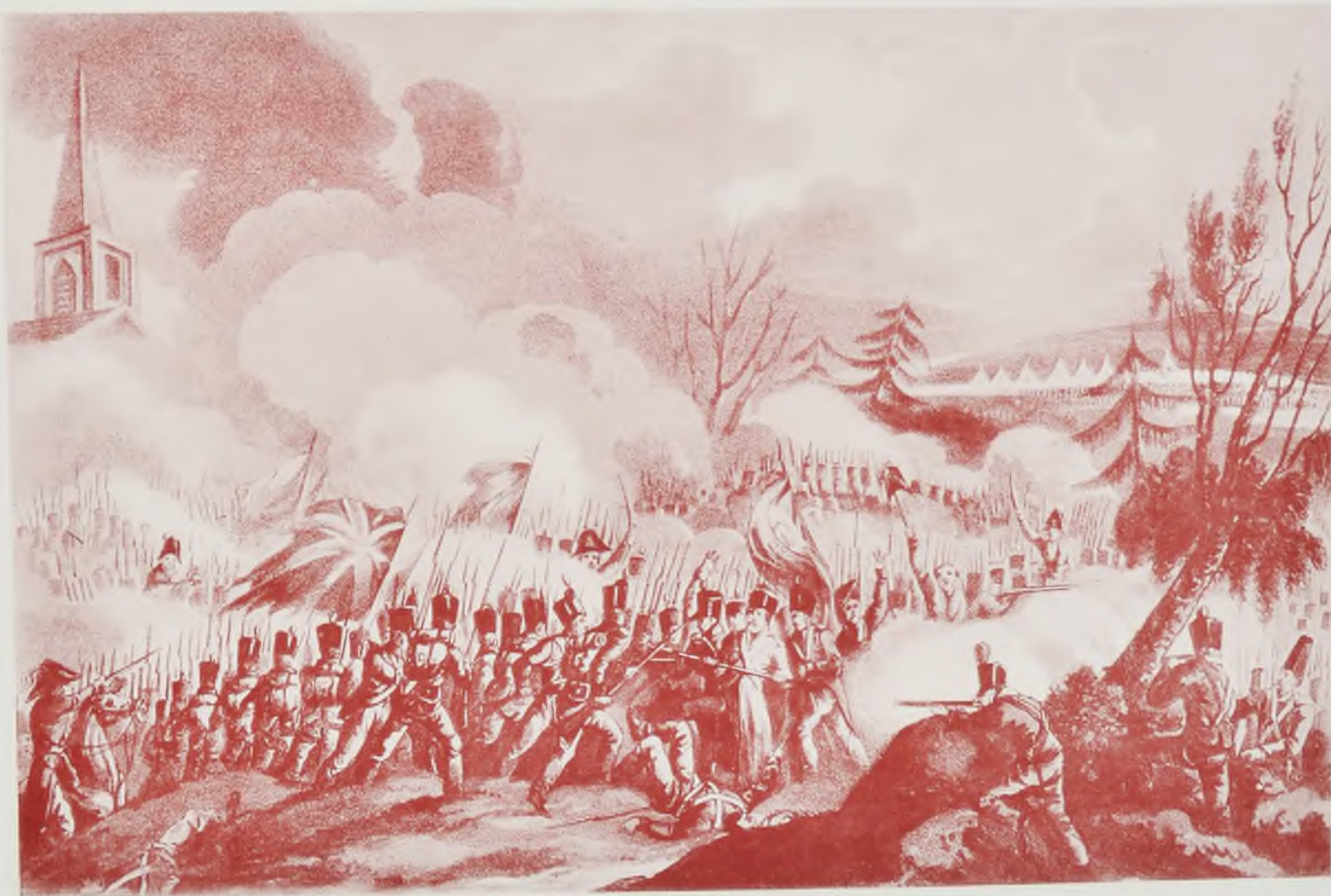
BATTLE OF ST. JEAN DE LUZ, DECEMBER 10, 1813 By T. Sutherland, after W. Heath