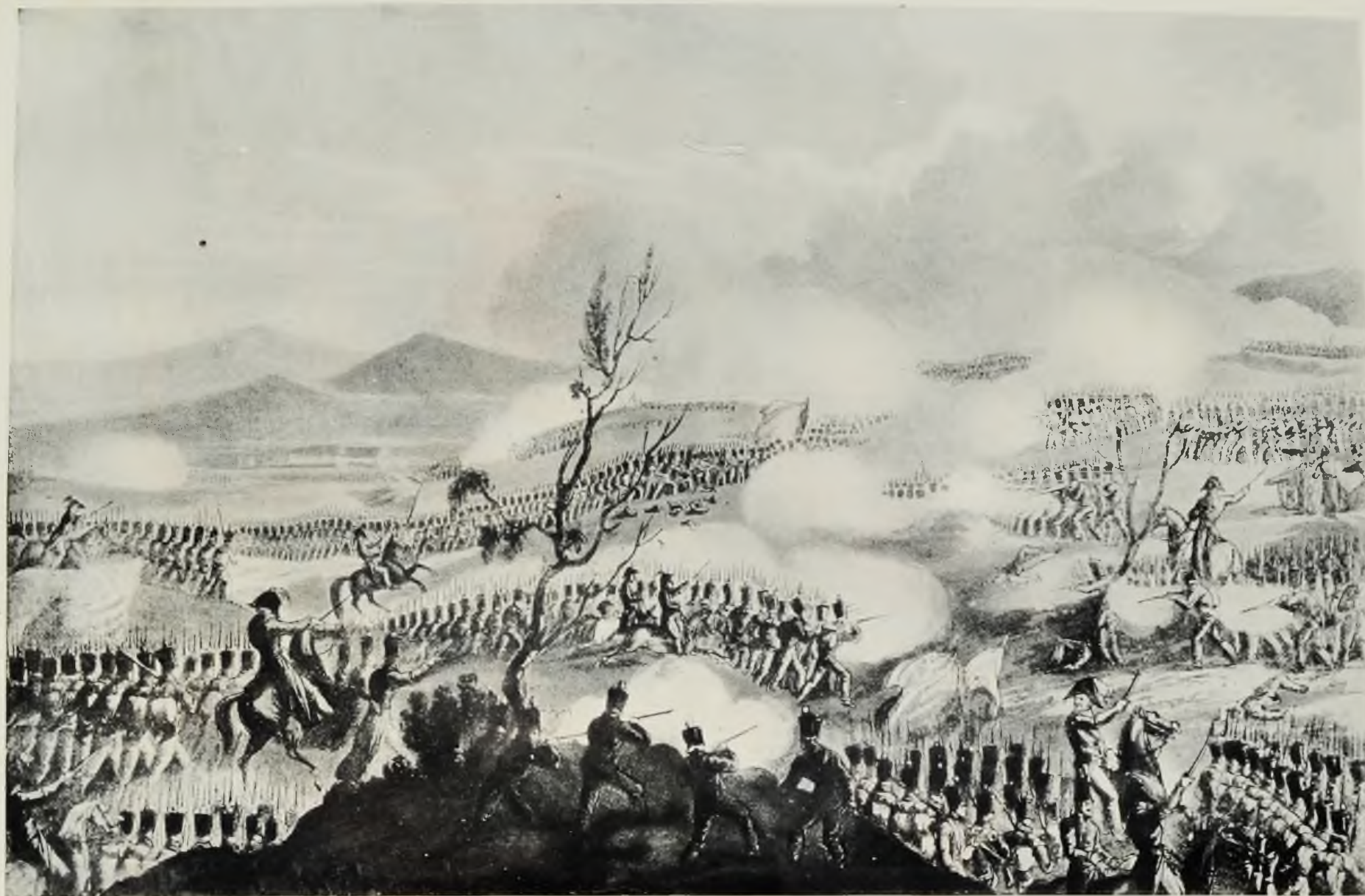
BATTLE OF NIVELLE, NOVEMBER 10, 1813 By T. Sutherland, after W. Heath