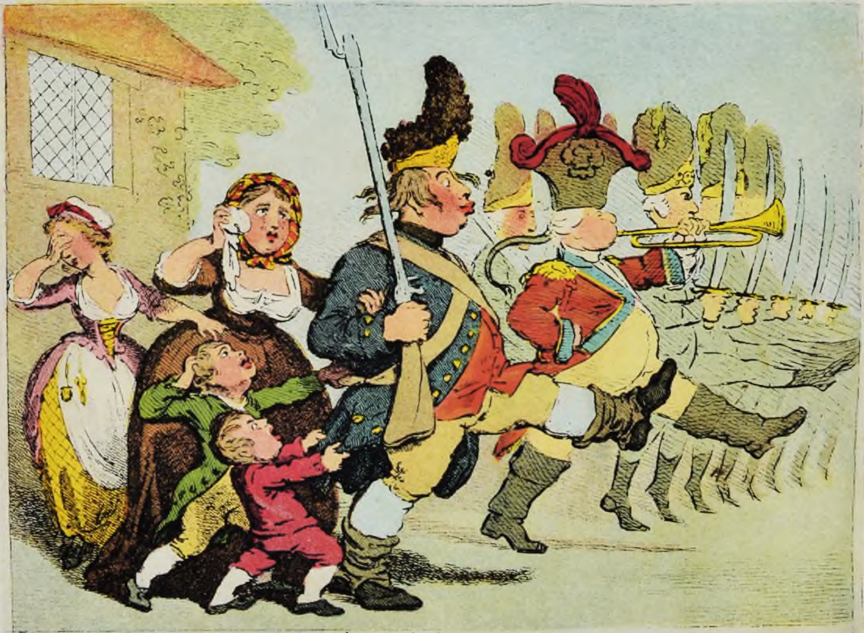
JOHN BULL going to the WARS.