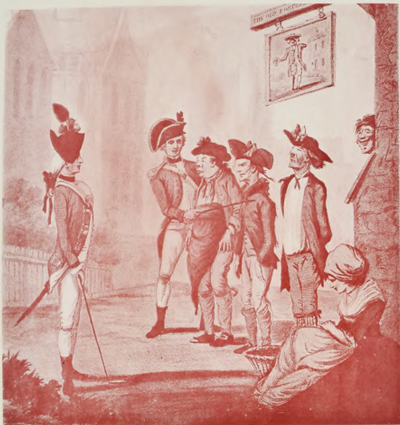
RECRUITS By Watson and Dickinson After Bunbury