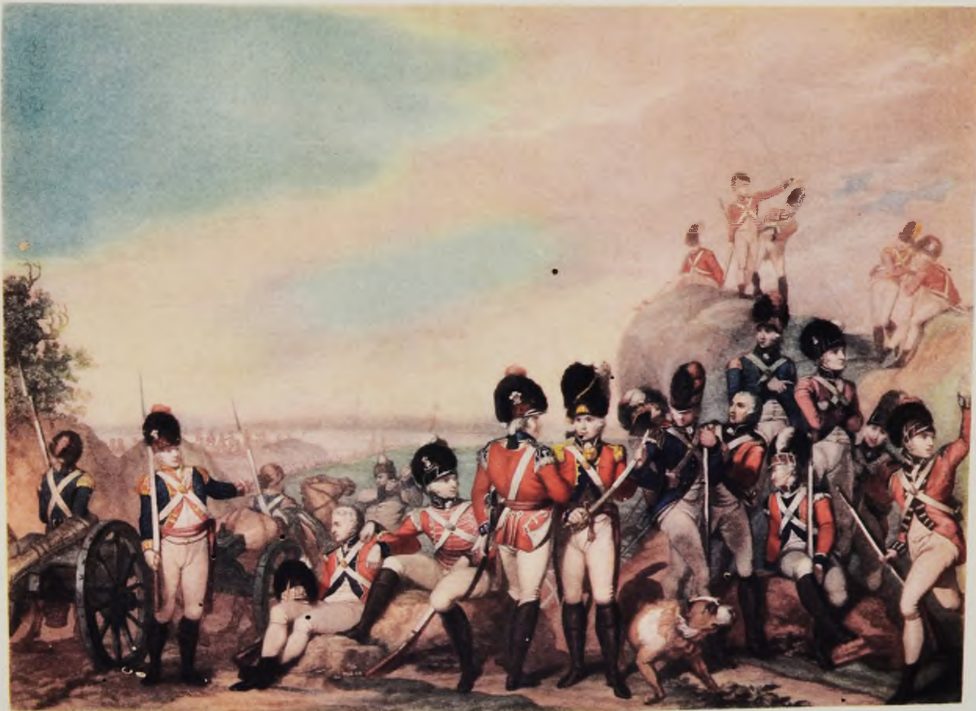
LOYAL ASSOCIATED WARD AND VOLUNTEER CORPS OF THE CITY OF LONDON