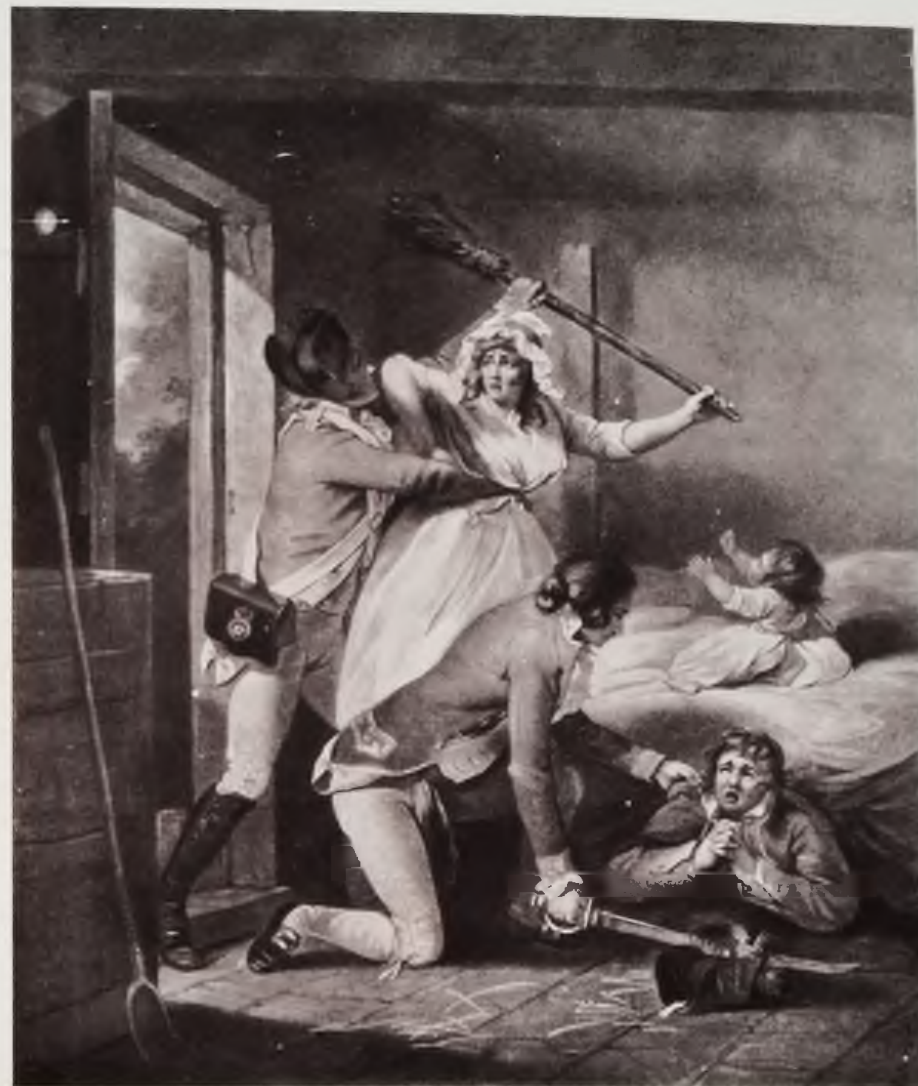
RECRUIT DESERTED By G. Keating After G. Morland