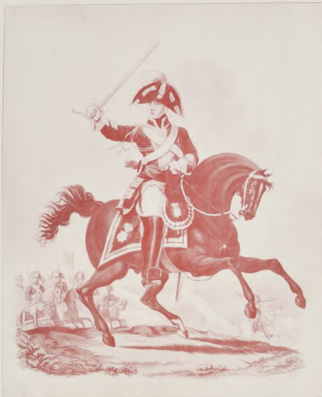
OFFICER, 2ND REGIMENT LIFE GUARDS (WATERLOO PERIOD)