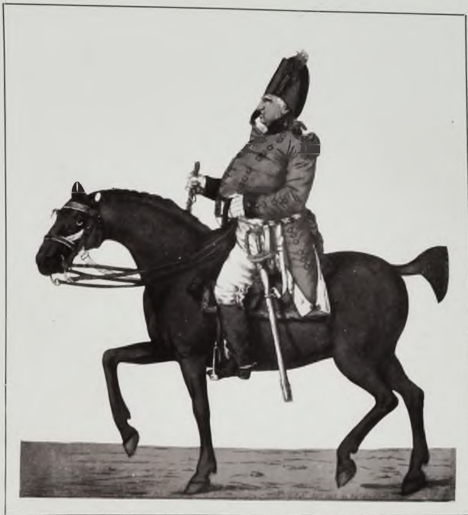
A GENERAL VIEW OF OLD ENGLAND (THE WELSH (41ST) REGIMENT) By R. Dighton