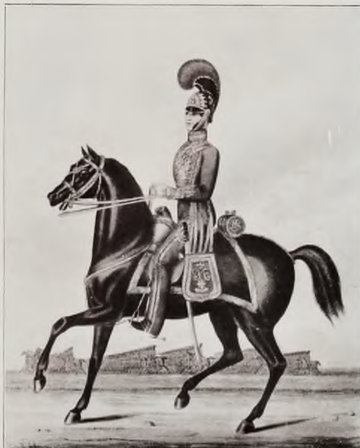
OFFICERS OF THE MADRAS ARMY (LIGHT CAVALRY) By Wm. Hunsley, 1841