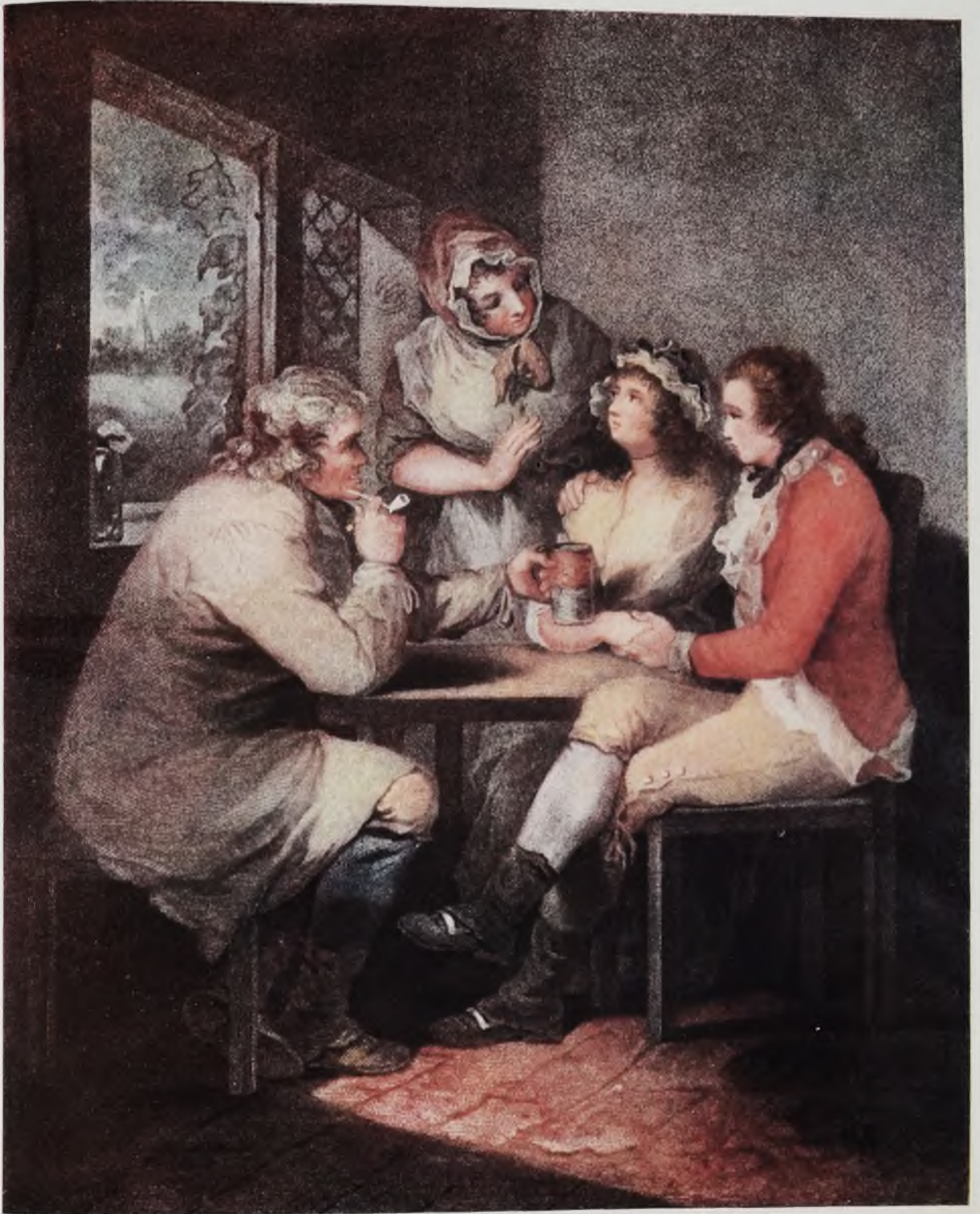
THE SOLDIER'S RETURN