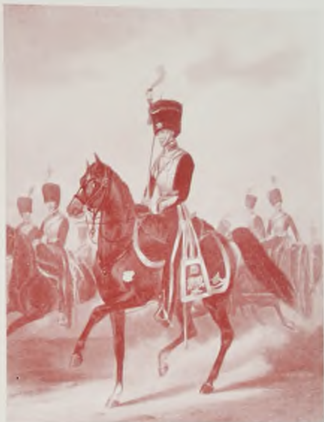
BUCKINGHAMSHIRE ARTILLERY CORPS