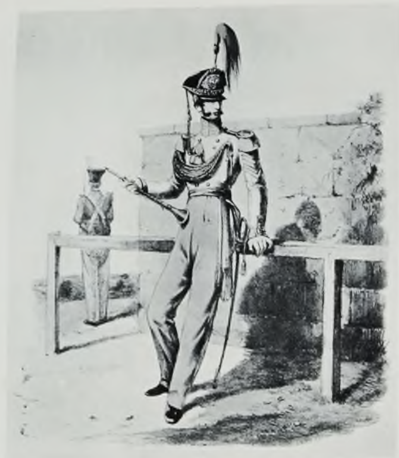
ROYAL MARINES, MASTER OF THE BAND (1830)