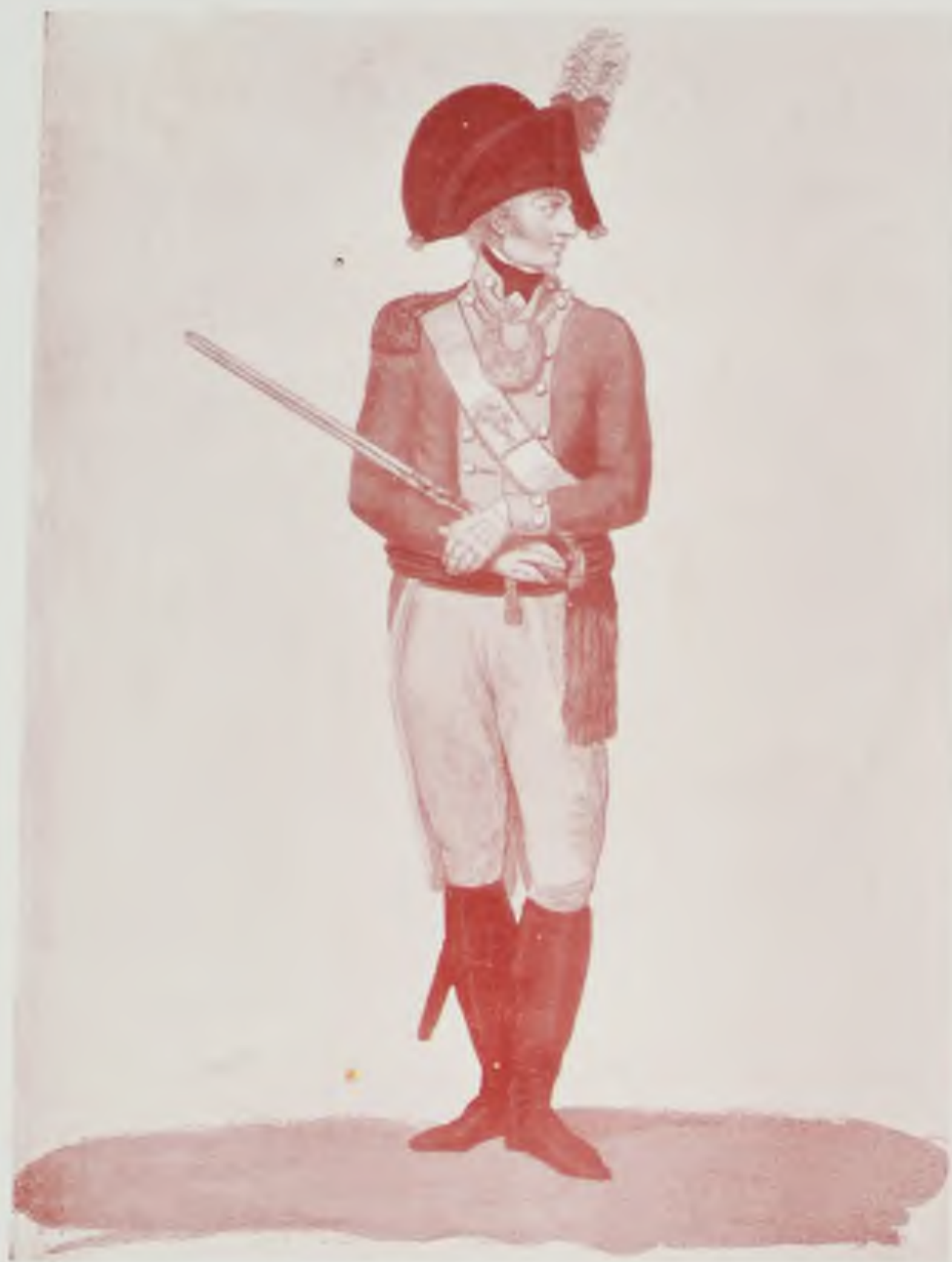
THIRD REGIMENT OF FOOT (1799)