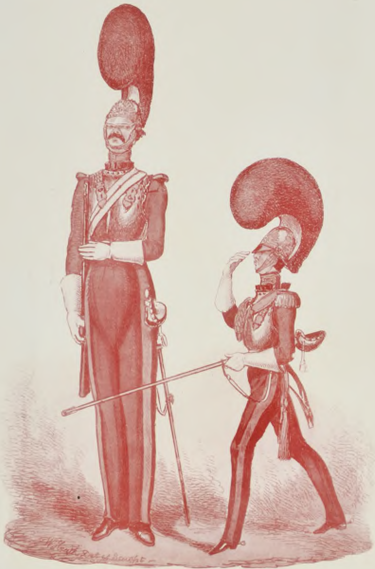
SHOWING THE DIFFERENCE BETWEEN THE MAN AND THE OFFICER