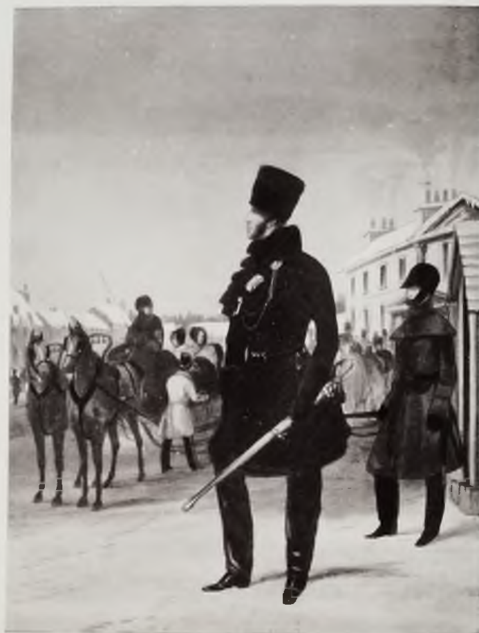
60TH (KING'S ROYAL RIFLES CORPS) WINTER DRESS, CANADA