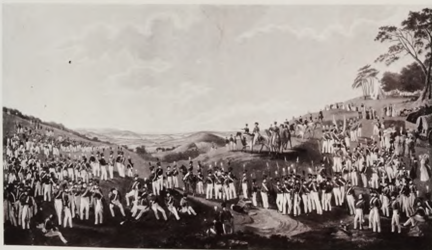
THE HON. ARTILLERY COMPANY ASSEMBLED FOR BALL PRACTICE AT CHILD'S HILL