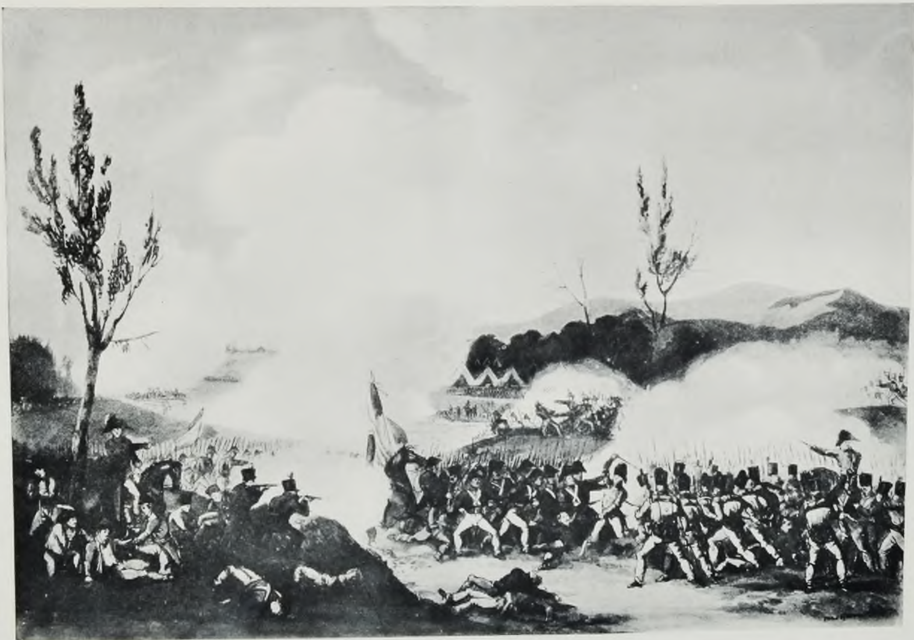
ATTACK ON THE ROAD TO BAYONNE, DECEMBER 13, 1813 By T. Sutherland, after W. Heath