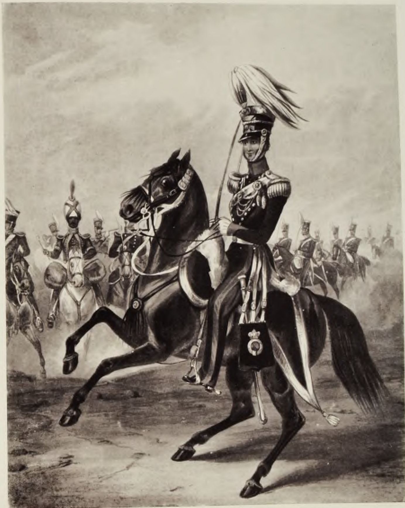
WEST ESSEX YEOMANRY