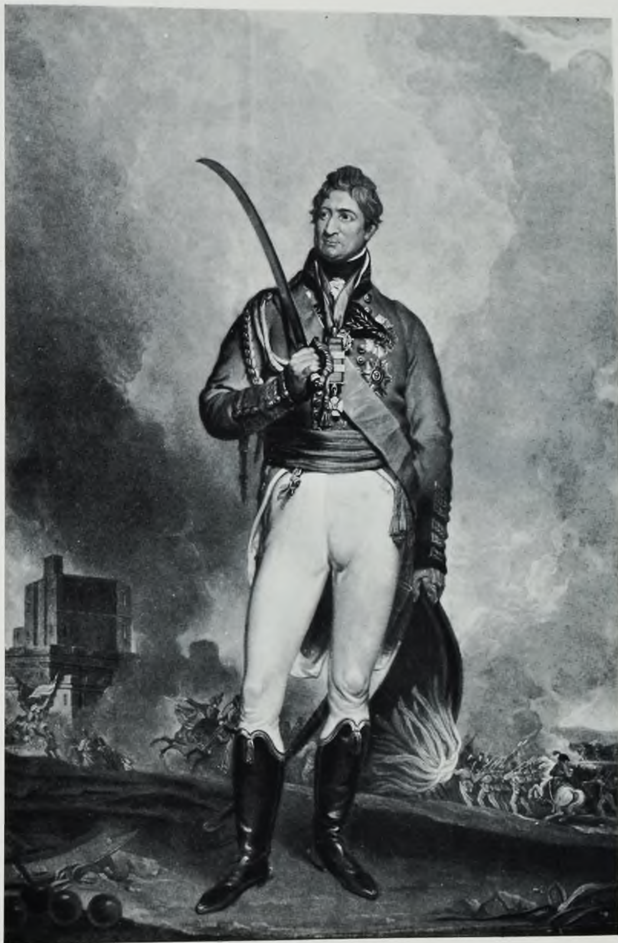
SIR THOS. PICTON From an Engraving, after M. A. Shee