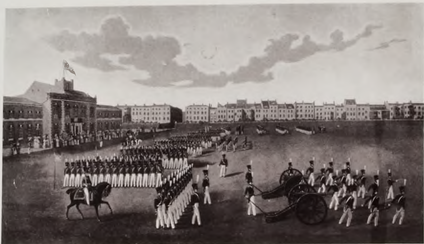
REVIEW OF THE HON. ARTILLERY COMPANY