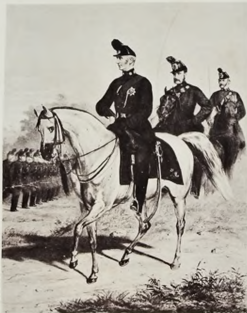
ARTHUR, 2ND DUKE OF WELLINGTON, K.G. LIEUT.-COLONEL COMMANDANT, VICTORIA V.R.C.