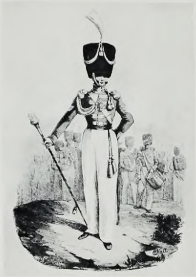
87TH REGIMENT OR ROYAL IRISH FUSILIERS, DRUM MAJOR (1828)