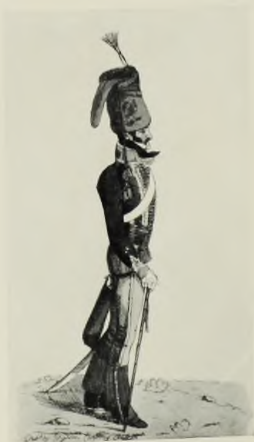
AN OFFICER OF THE 10TH (OR THE PRINCE OF WALES'S) HUSSARS By Dighton