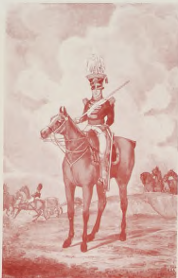
OFFICER, FOOT ARTILLERY By H. Alken