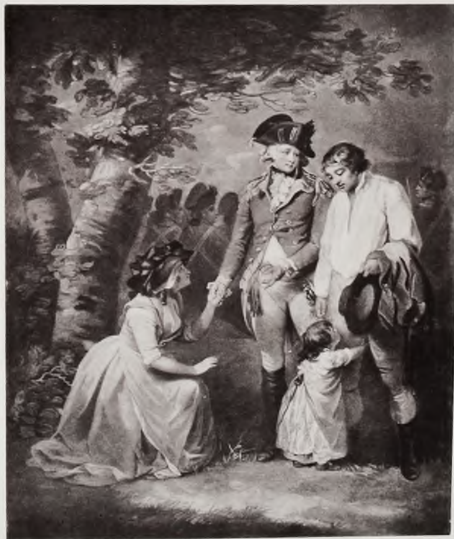
DESERTER PARDON'D By G. Keating After G. Morland