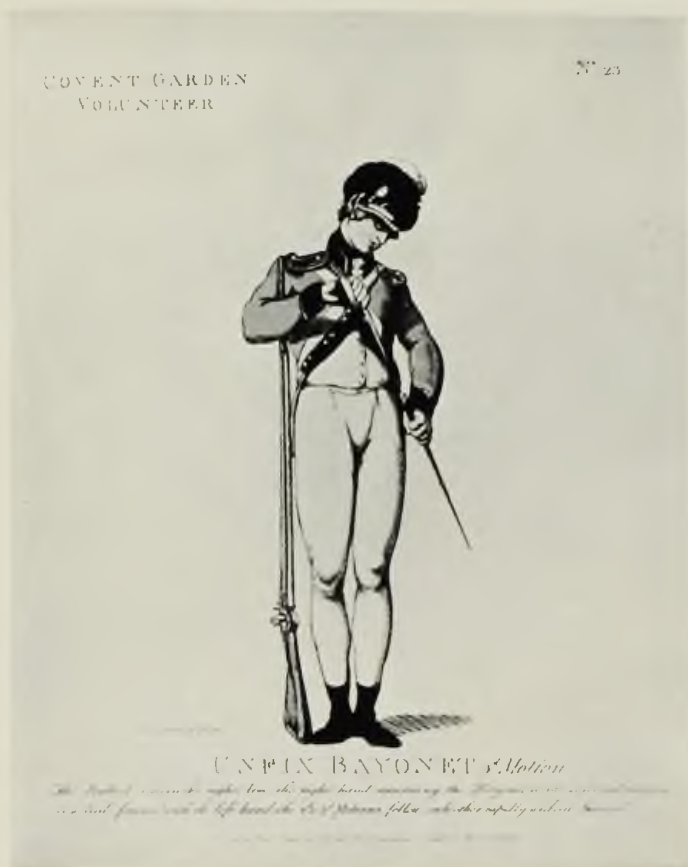
By Thos. Rowlandson