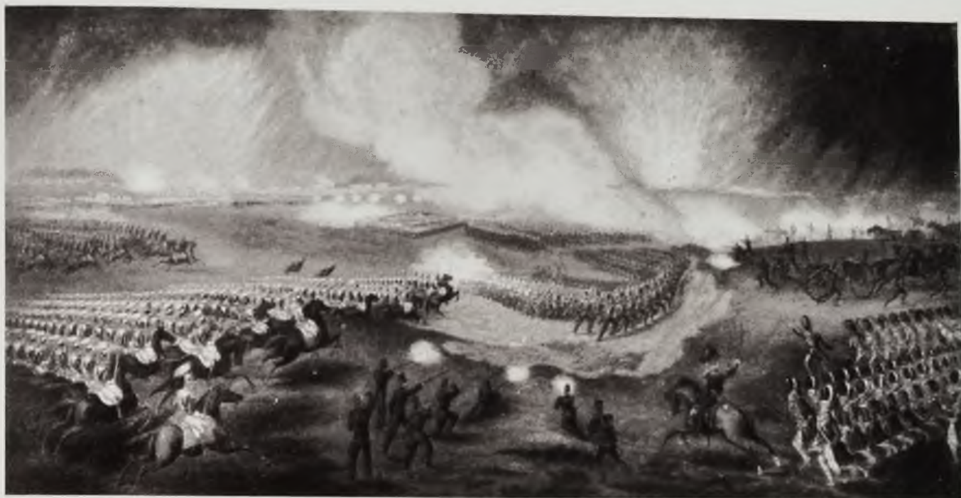
CHARGE OF THE BRITISH TROOPS ON THE ROAD TO WINDLESHAM, APRIL 24, 1854 From a Colourprint by G. Baxter