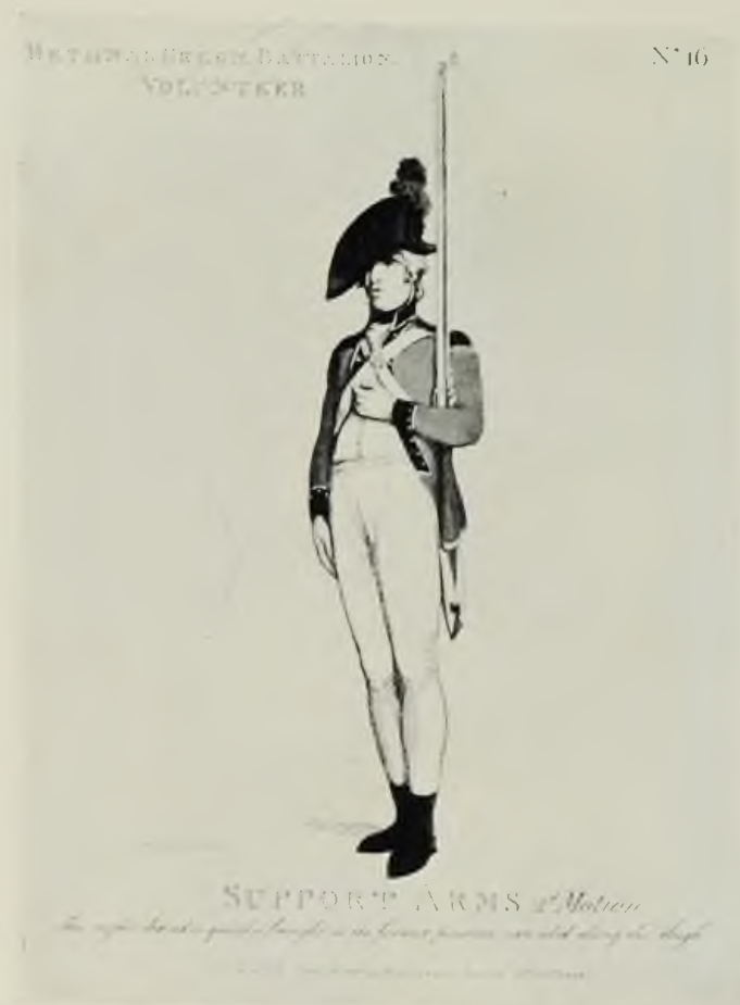
By Thos. Rowlandson