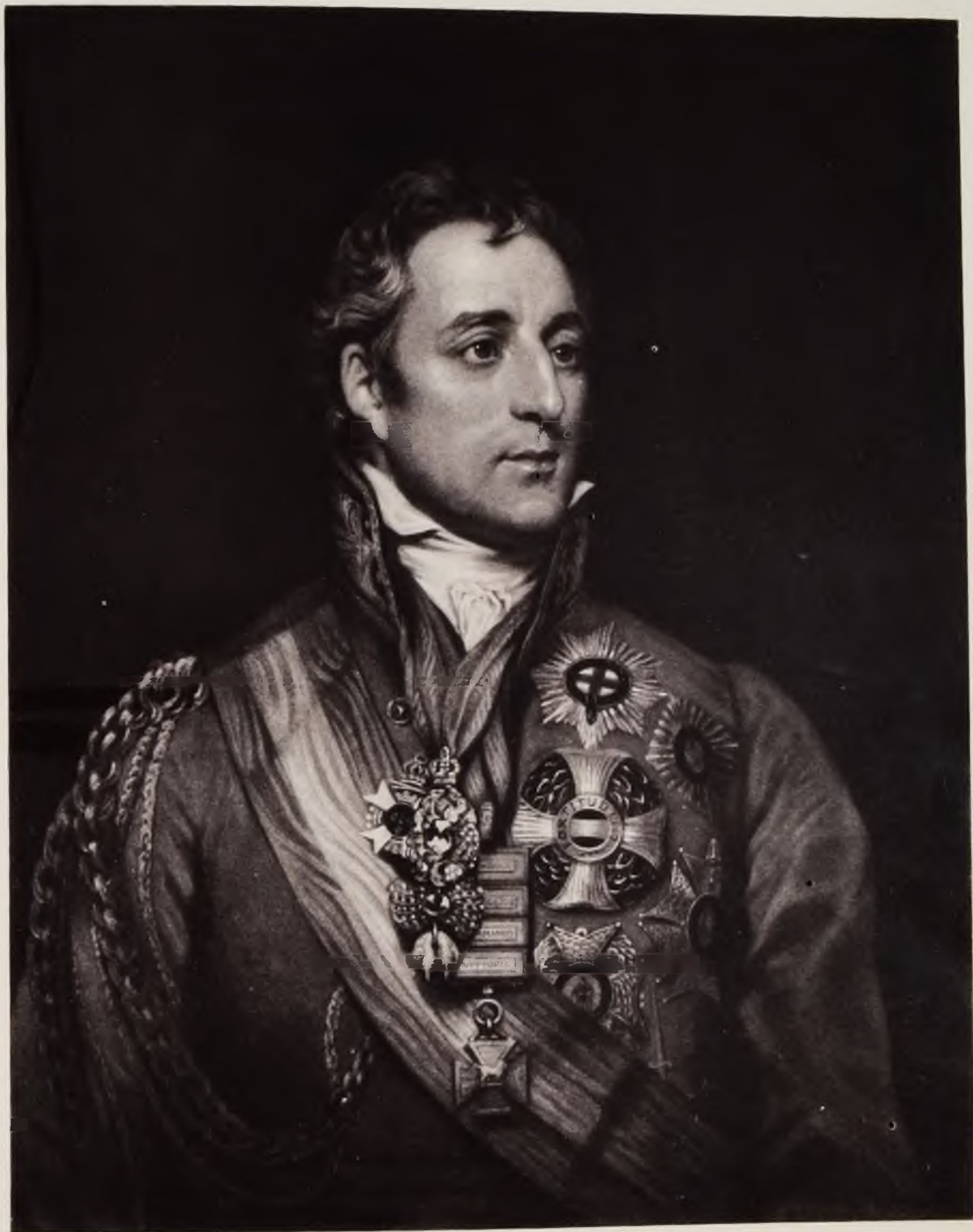
THE DUKE OF WELLINGTON By W. Say After Thomas Phillips, R.A.