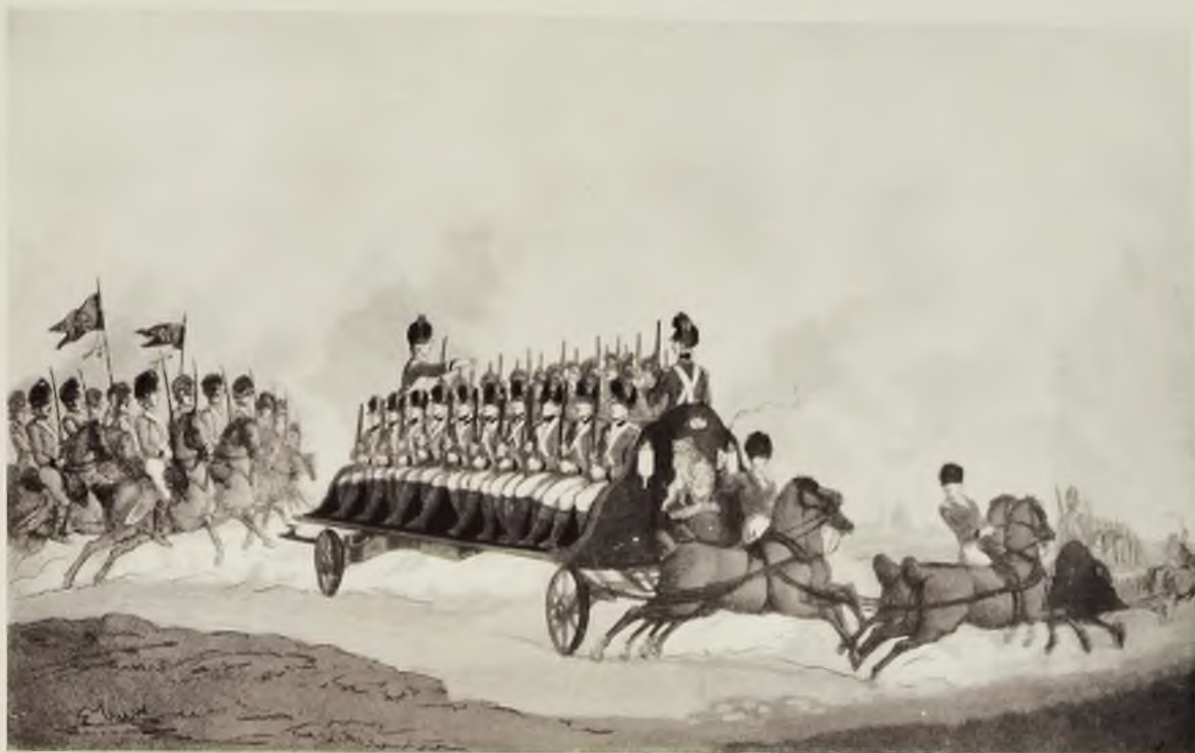
EXPEDITION OR MILITARY FLY By T. Rowlandson