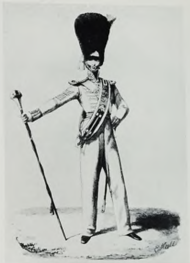
17TH REGIMENT, DRUM MAJOR (1830)