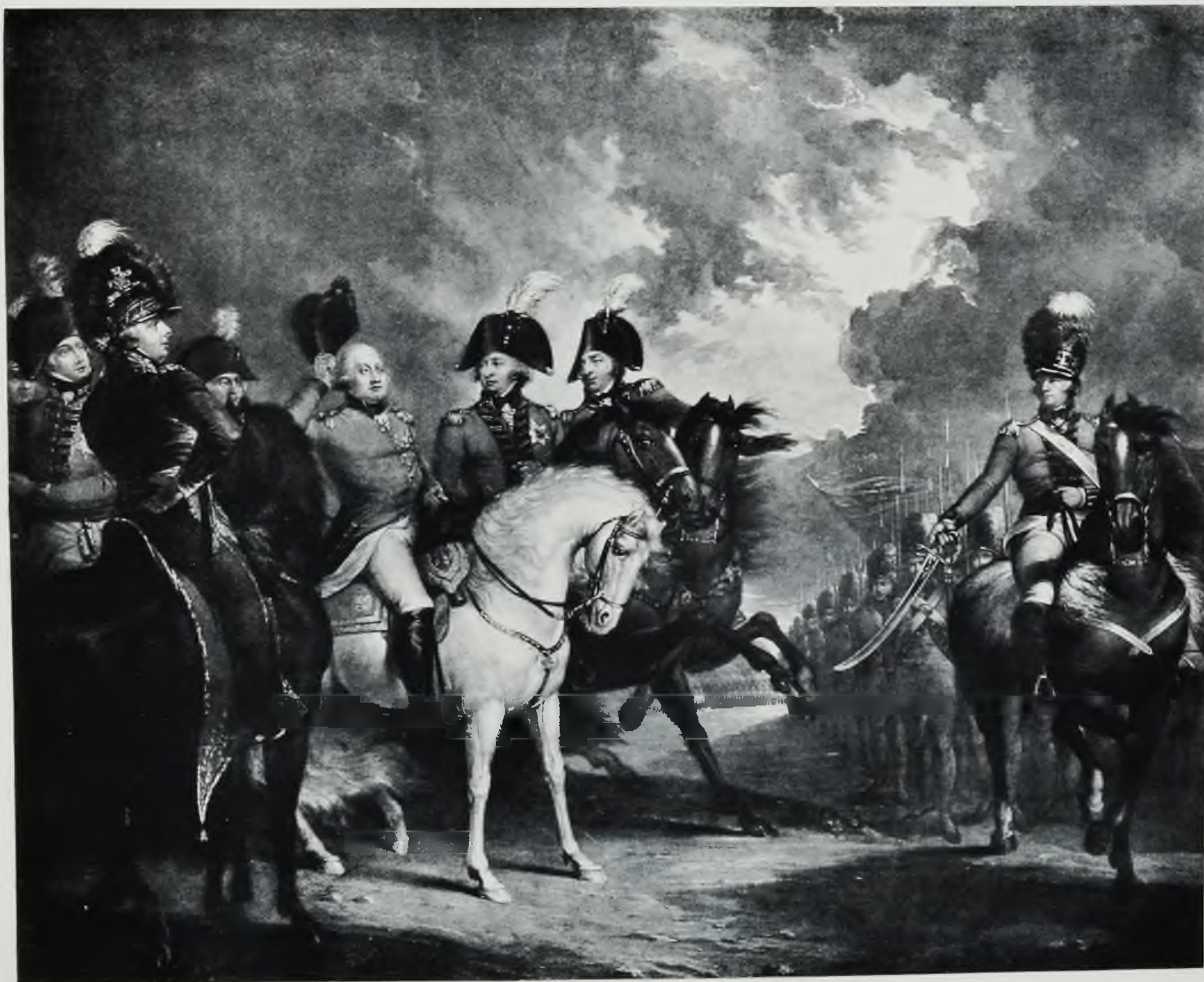
HIS MAJESTY REVIEWING THE VOLUNTEERS ON THE 4TH OF JUNE, 1799