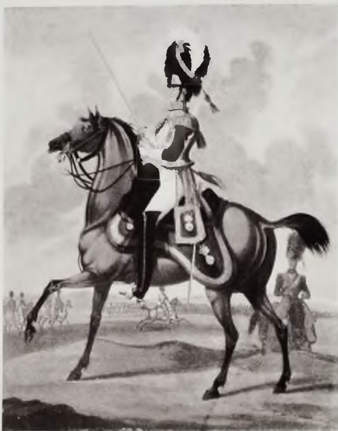
LIFE GUARDS (NEW APPOINTMENTS, 1821)