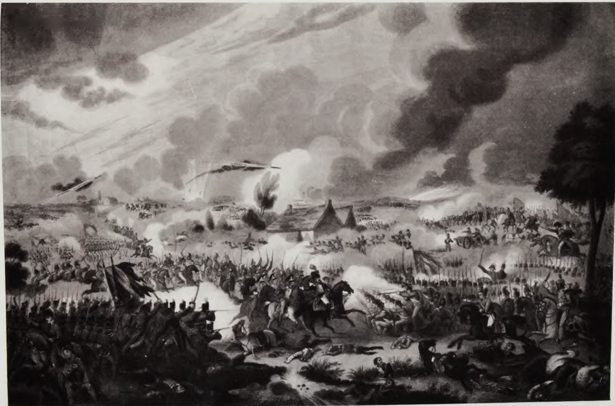
THE BATTLE OF WATERLOO, JUNE 18, 1815 By R. Reeve, after W. Heath