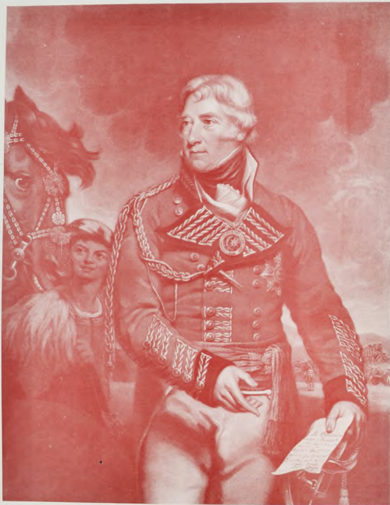
GENERAL DOYLE By Say After Ramsay