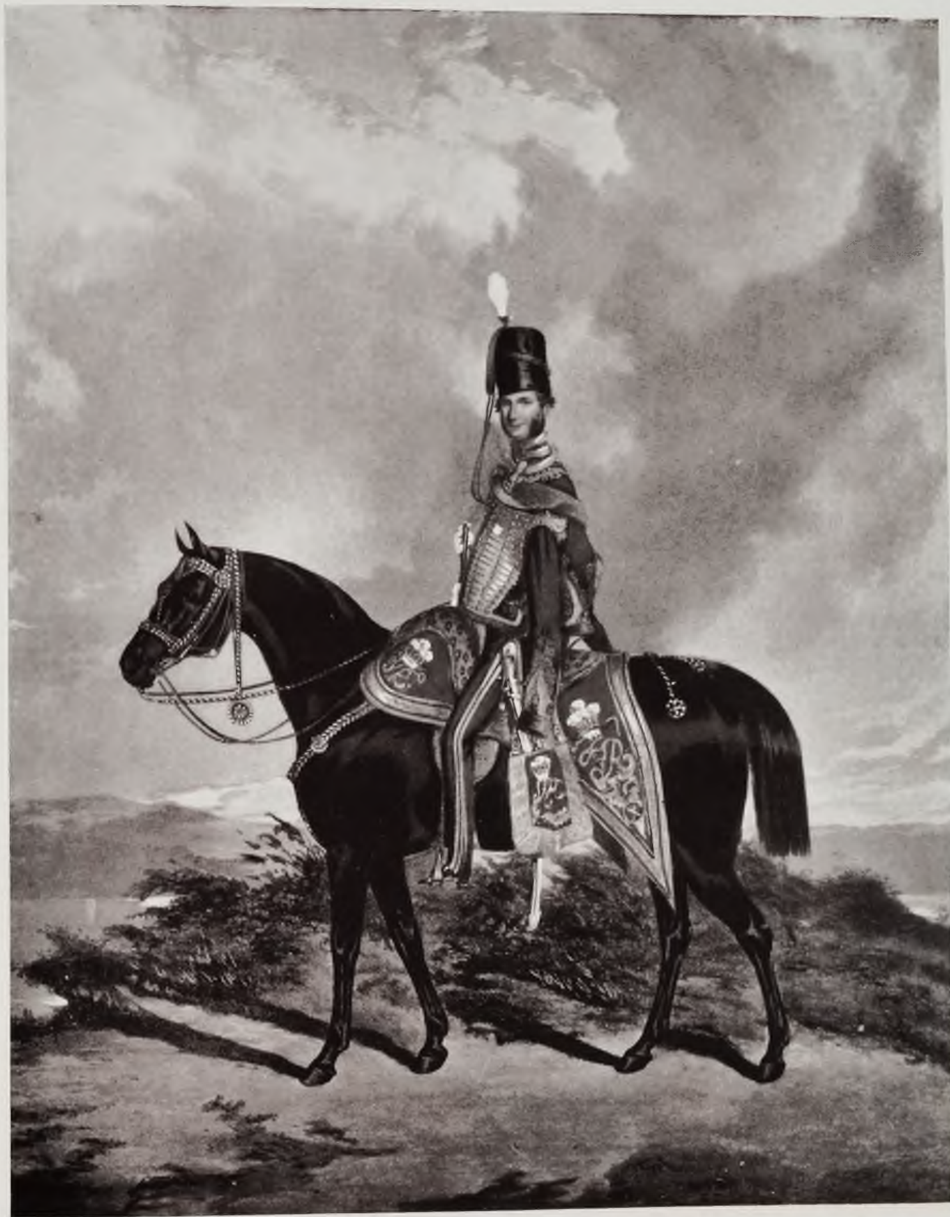
LIEUT.-GENERAL THE HON. HENRY BEAUCHAMP LYGON COLONEL 10TH HUSSARS