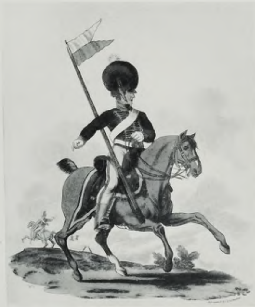
ROYAL ARTILLERY MOUNTED ROCKETT CORPS By I. C. Stadler After C. Hamilton Smith (1815)