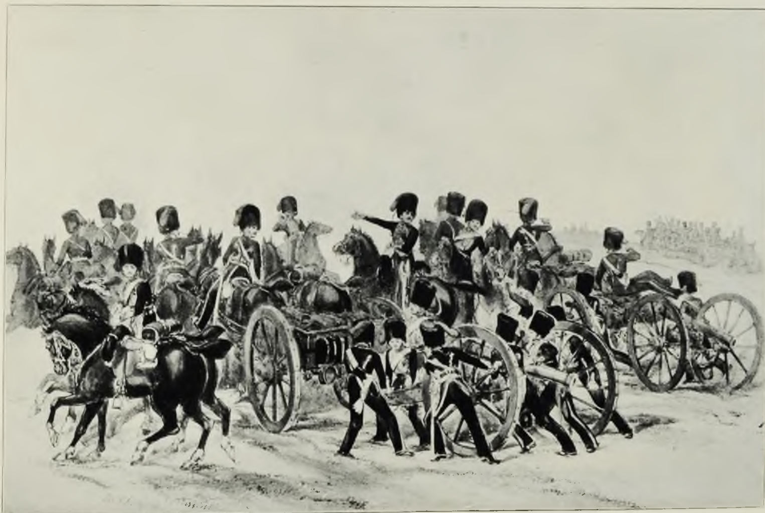
THE ROYAL HORSE ARTILLERY From a Lithograph after Campion (1846)