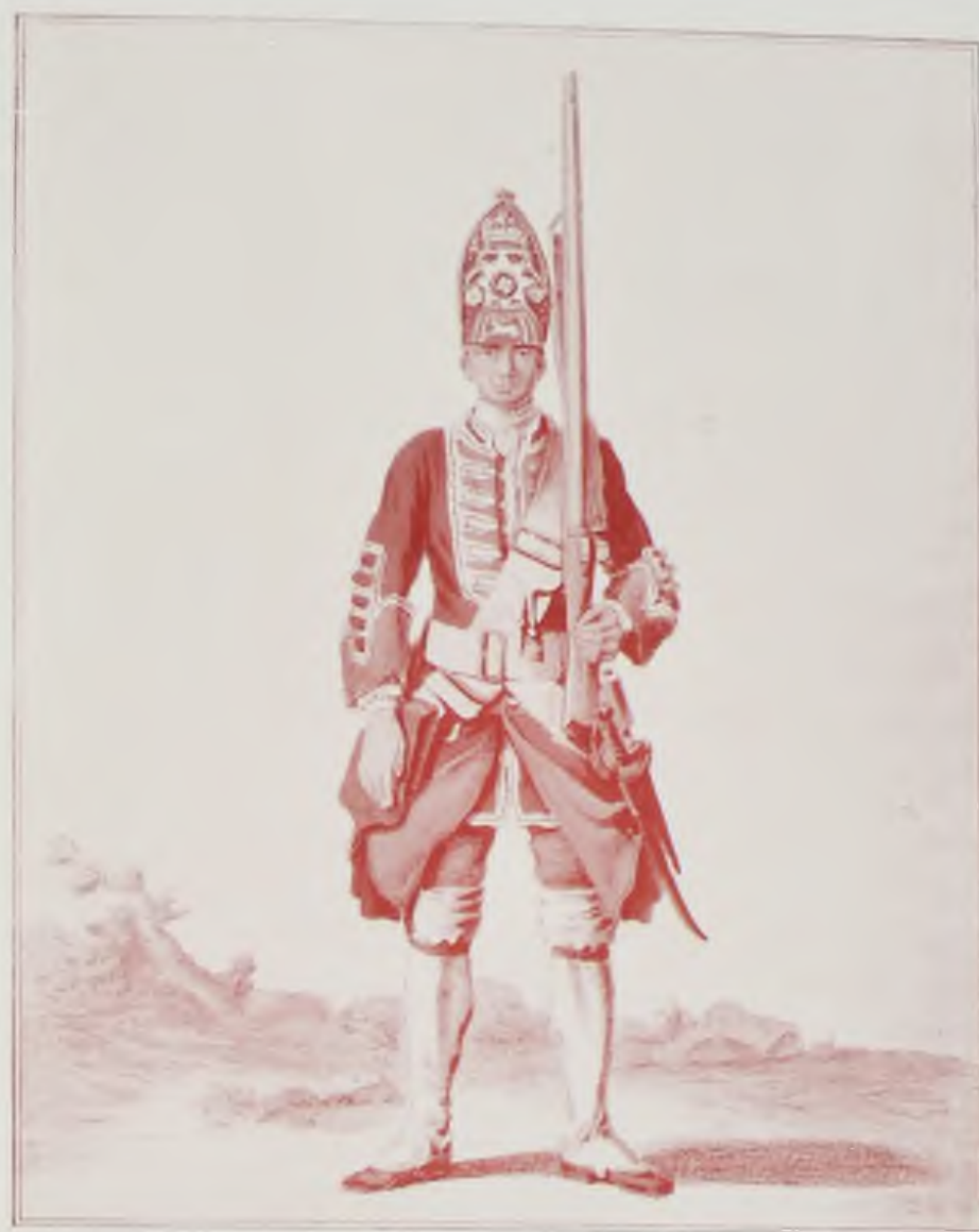
GENTLEMAN, THE 7TH (ROYAL FUSILIERS) 1742 From a Contemporary Print