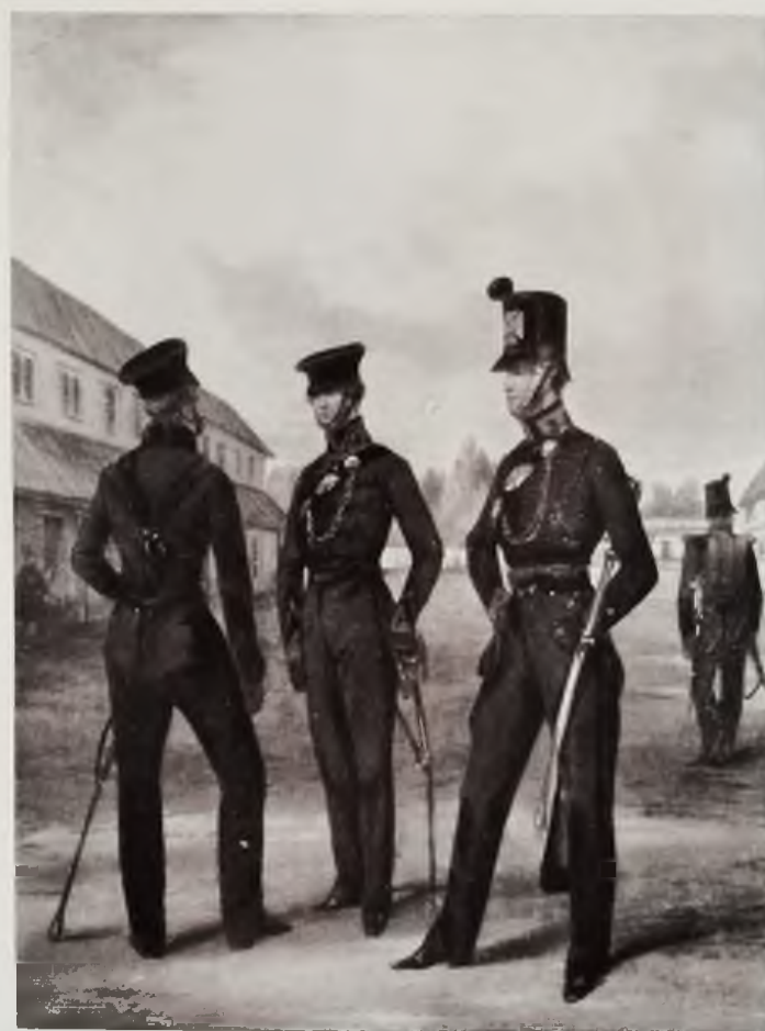
60TH (KING'S ROYAL RIFLES CORPS)