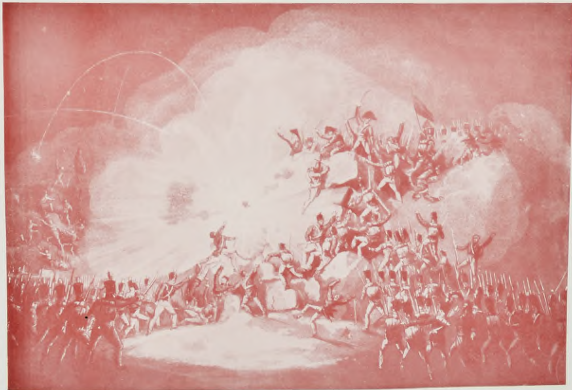
STORMING OF CIUDAD RODRIGO, JANUARY 19, 1813 By T. Sutherland, after W. Heath