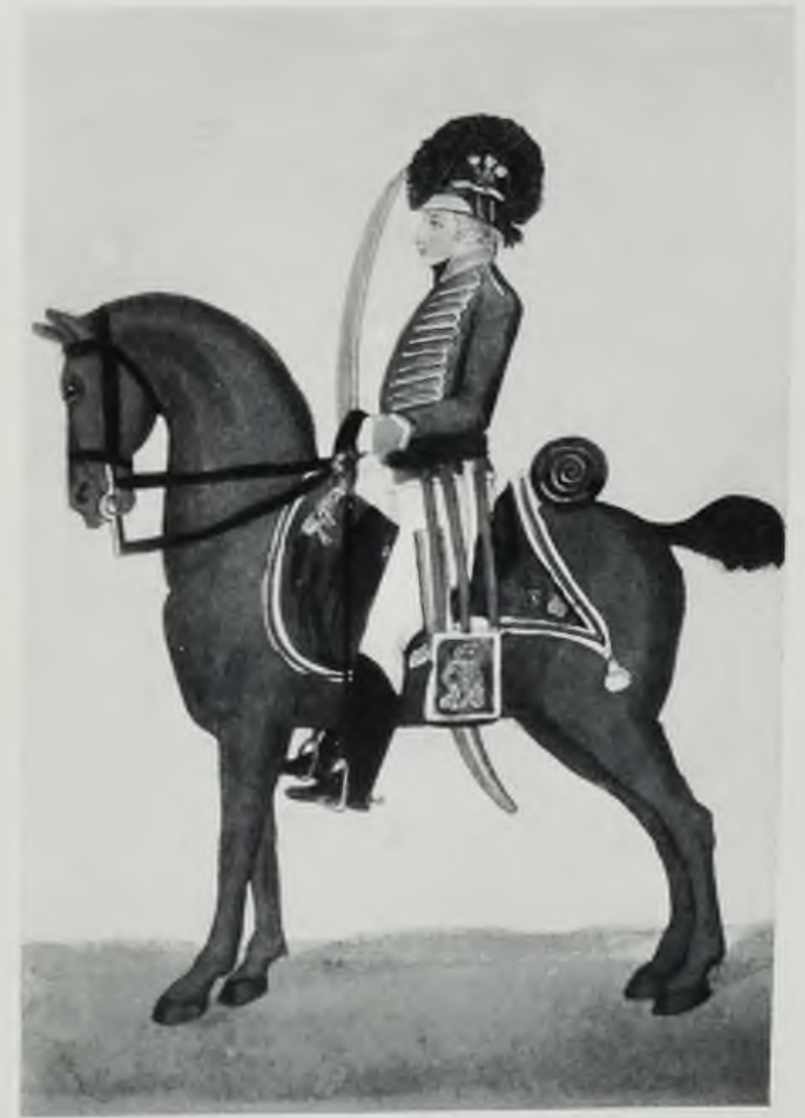
THE 10TH (OR THE PRINCE OF WALES'S OWN) REGIMENT OF LIGHT DRAGOONS From the "British Military Library"