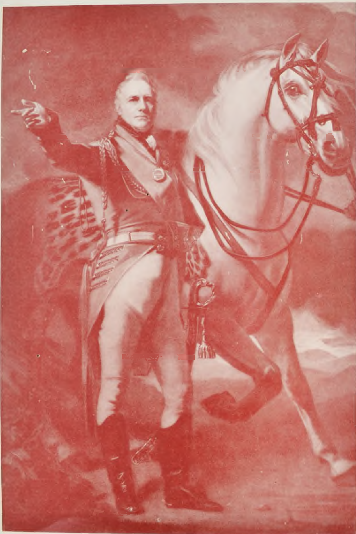
SIR DAVID BAIRD (COLONEL 24TH REGIMENT) By T. Hodgetts & Son, after Sir Henry Raeburn, R.A.