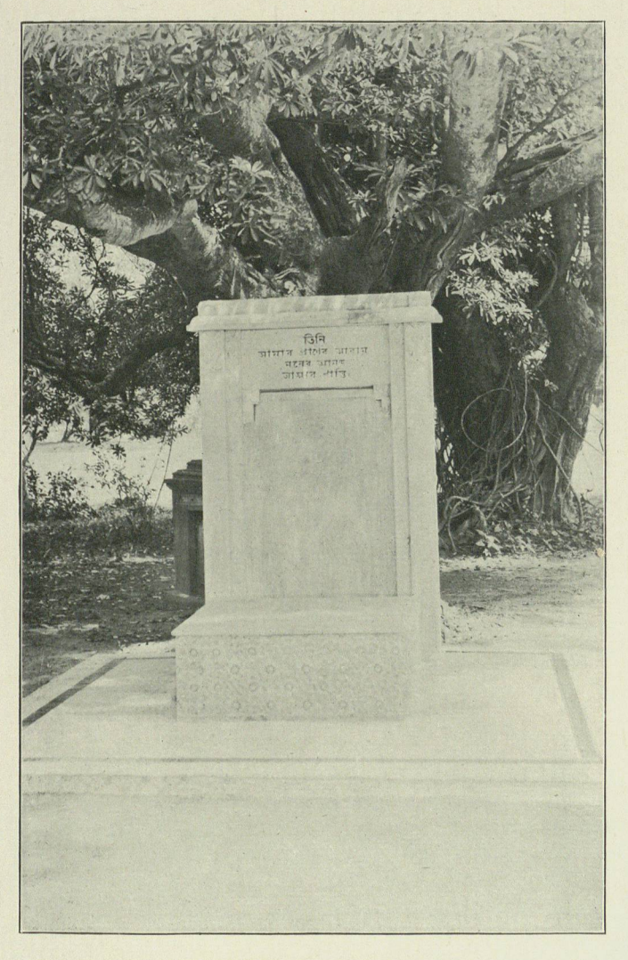
"The place where the great sage Maharshi Devendra Nath used to meditate."