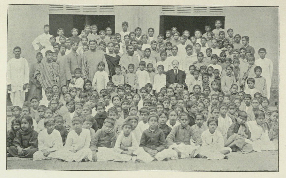
SHANTI NIKETAN—THE SCHOOL.