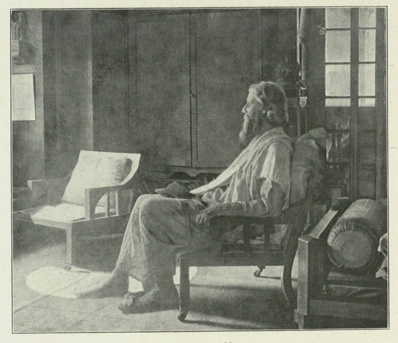
AT SHANTI NIKETAN.