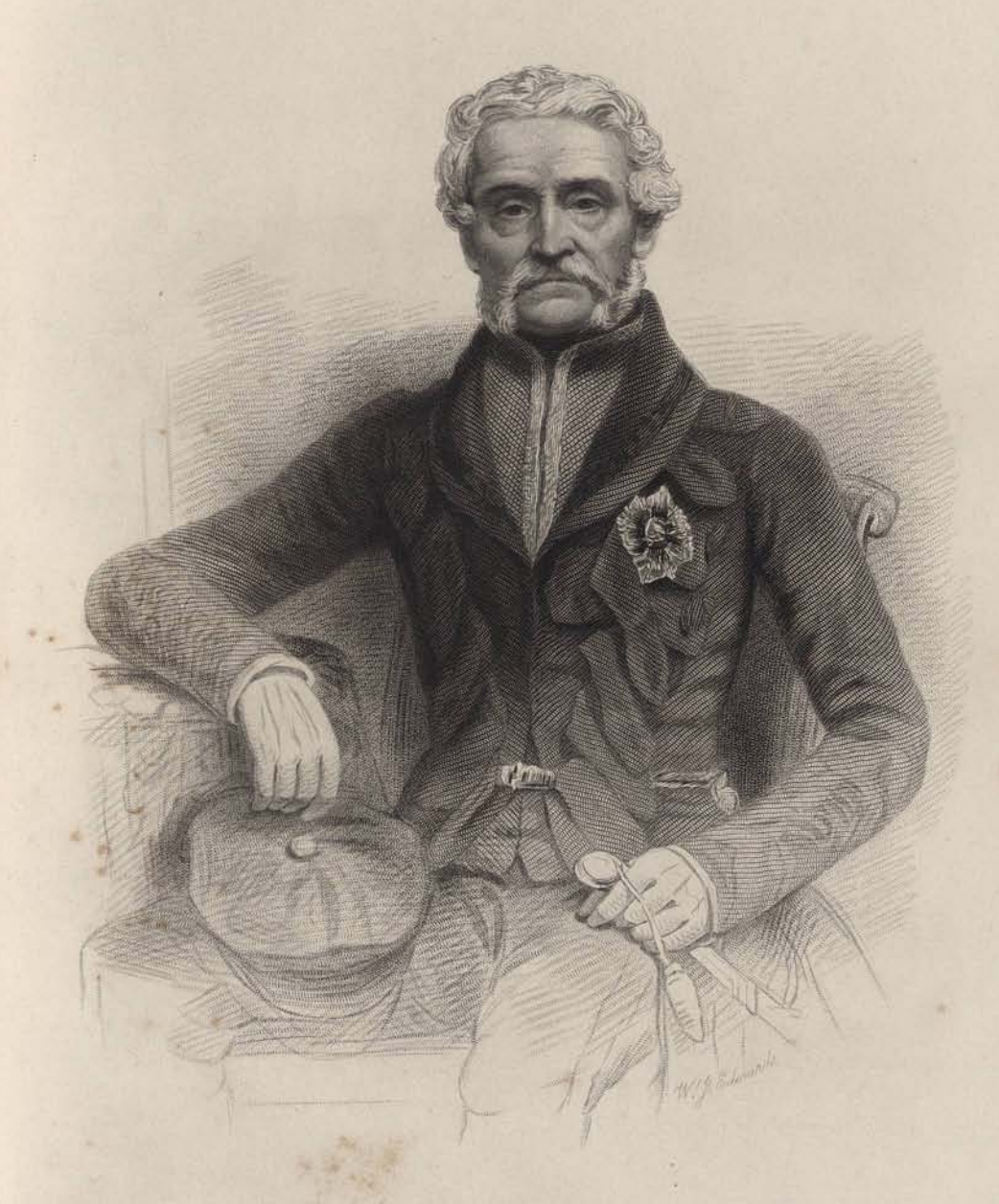
Trom a Thotograph lent expressly for this Work