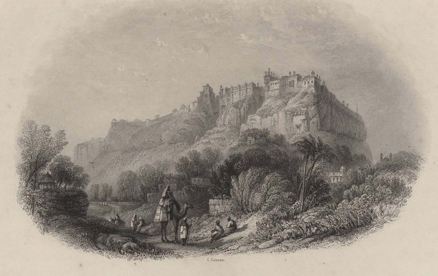
THE FORT OF GWALLOR.