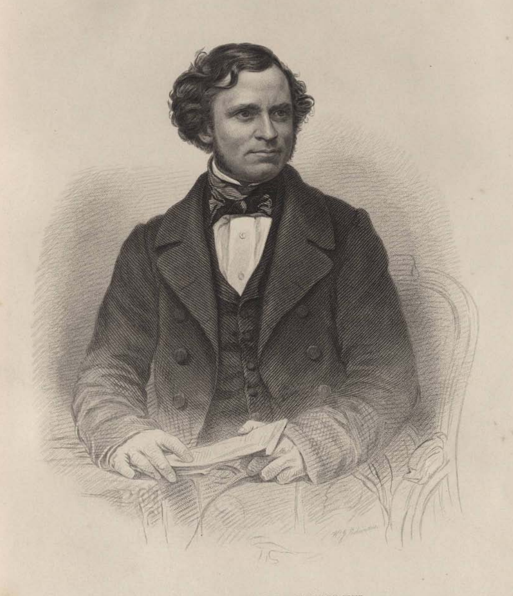
RIGHT HON. LORD STANLEY. PRESIDENT OF THE COUNCIL OF INDIA.