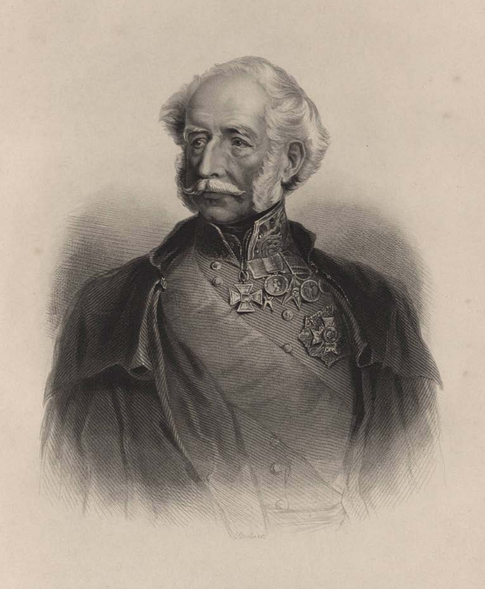
VISCOURT COUCH, G.C.B. &c.