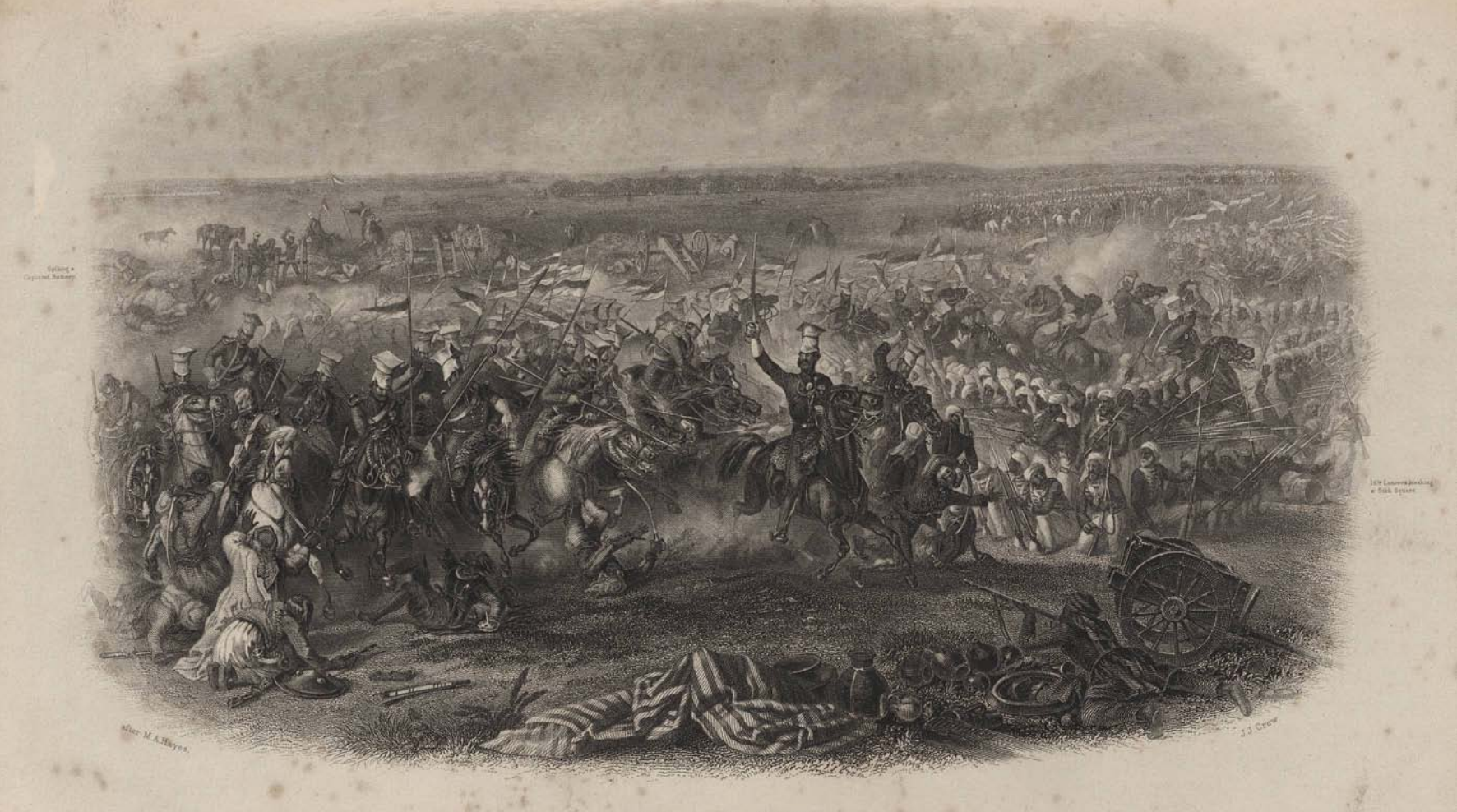
BATTLE OF ALIWAL.