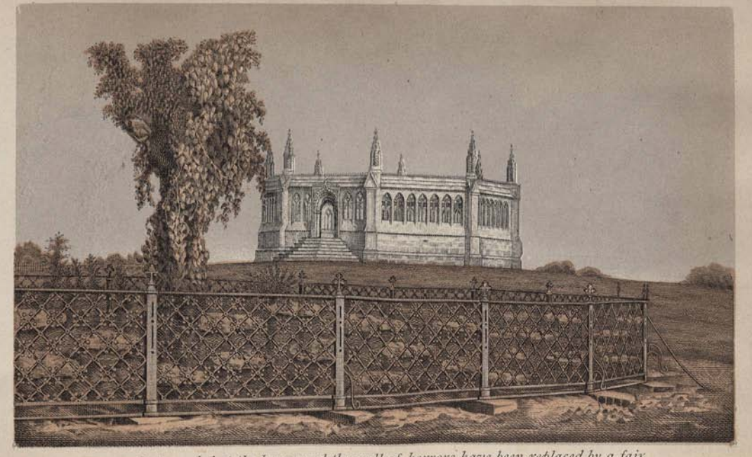
It is good that the house and the well of horrors have been replaced by a fair garden and a graceful shrine.