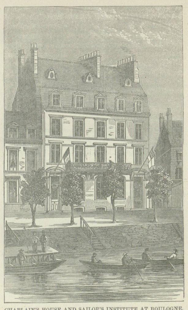
CHAPLAIN'S HOUSE AND SAILOR'S INSTITUTE AT BOULOGNE. (See pages 214, 215.)