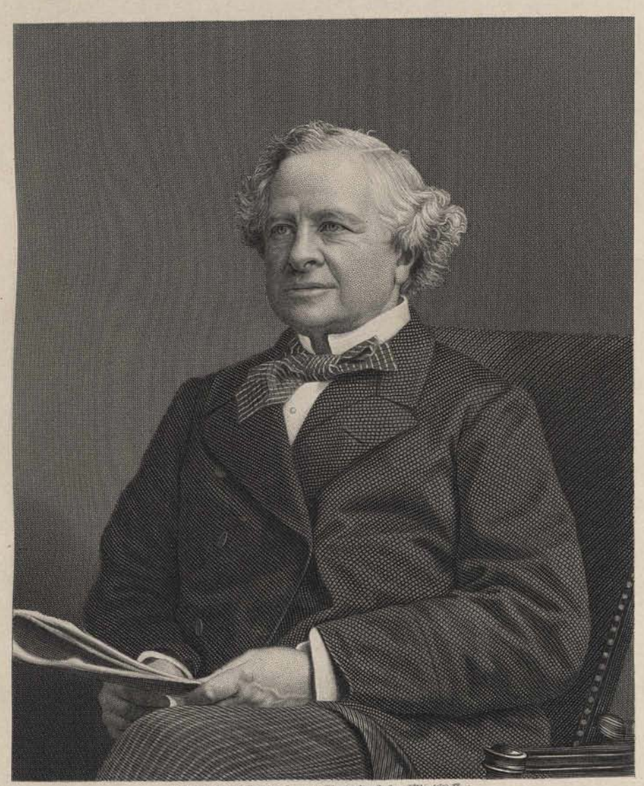
Englaved by W Roffe, from a Photograph by Edhaff & Fry