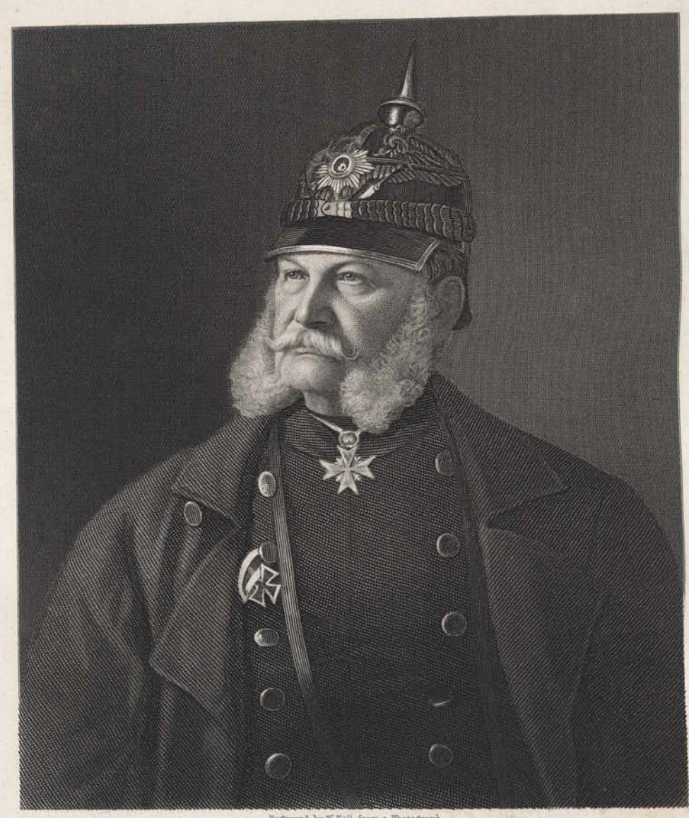
Ingraved by W. Holl, from a Photograph.