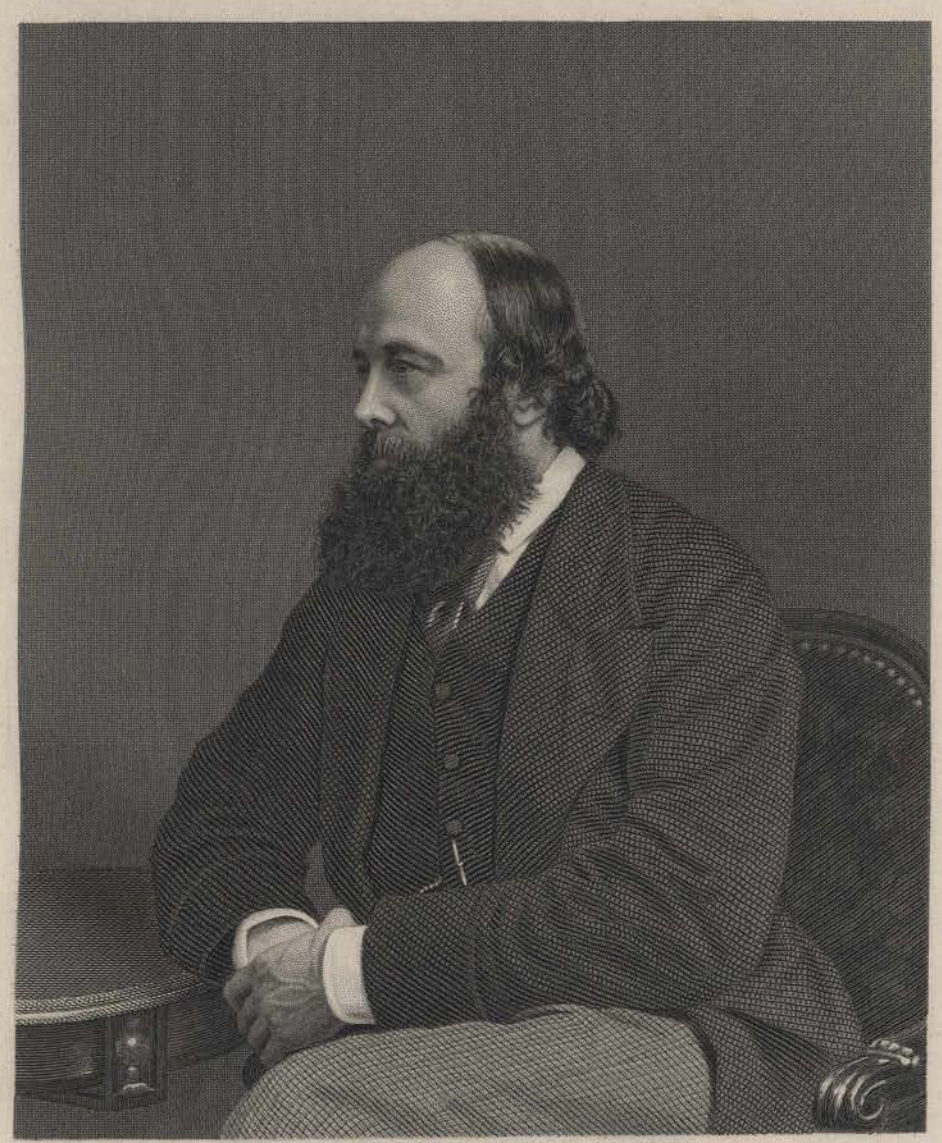
Engraved by W Roffe from a Photograph by Elliott & Phy