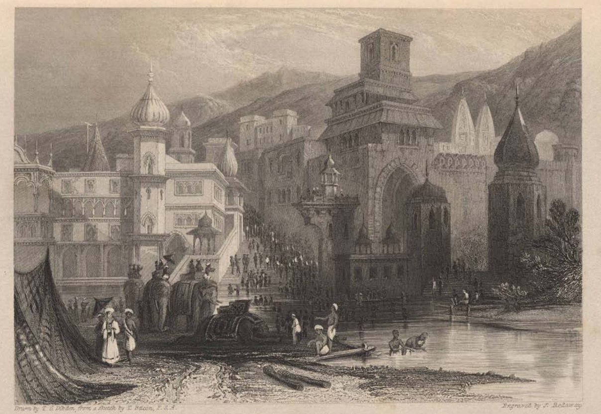
The Shit Hirdwar!