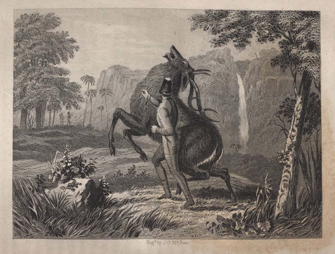
KILLING THE STAG AT BAY.