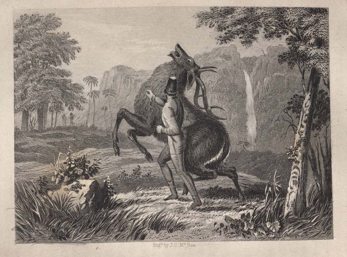
KHLLING THE STAG AT BAY.