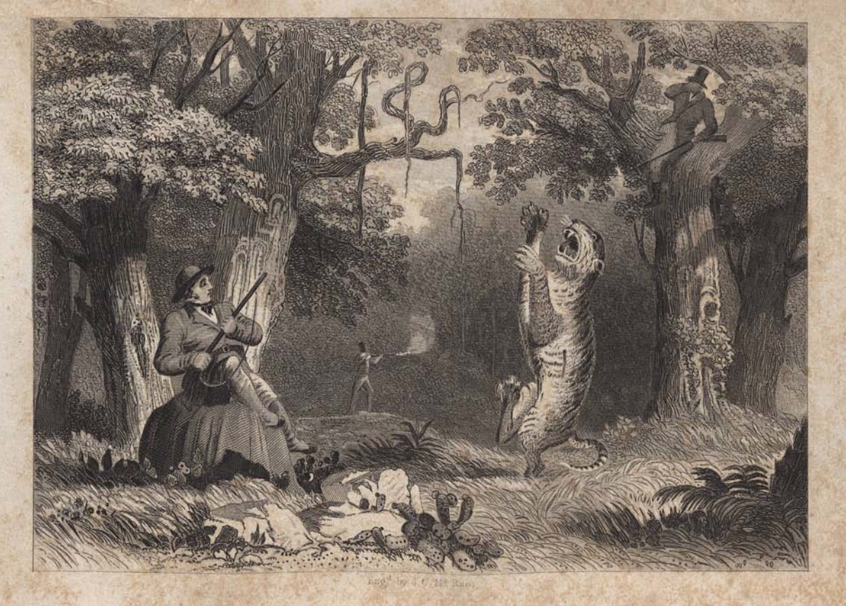
A LONG SIMON JUNET ON THOUGH.