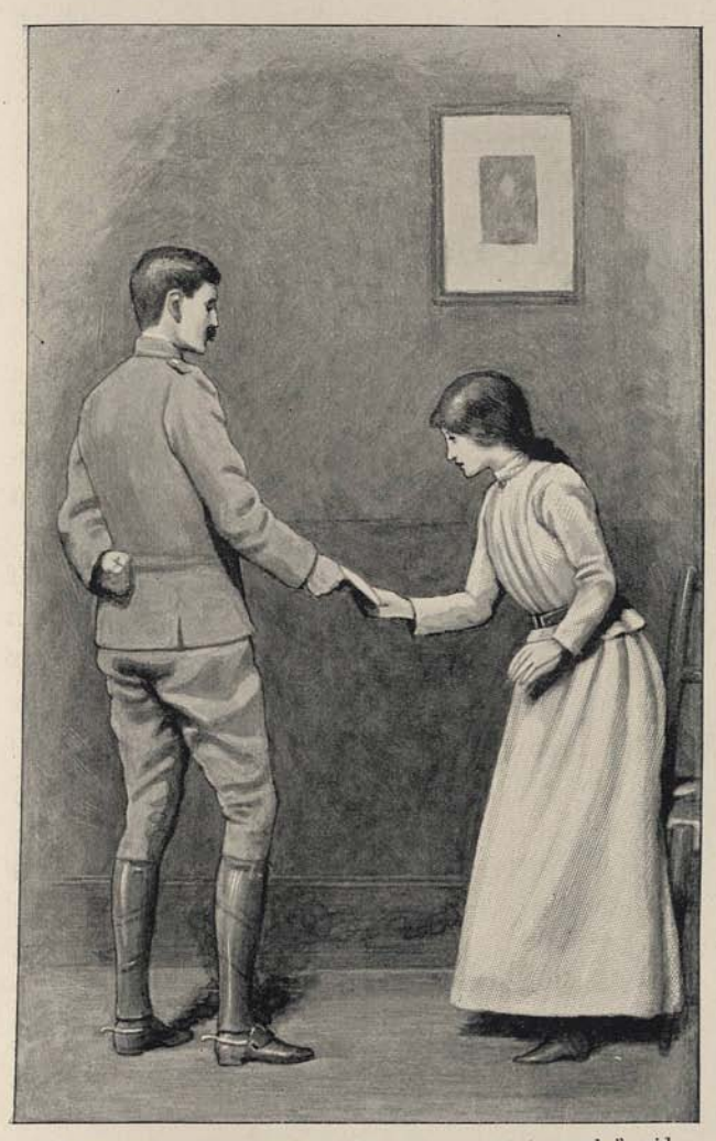
"I am afraid the information does not amount to much," said Major Sutcliffe, kindly.-p. 175.