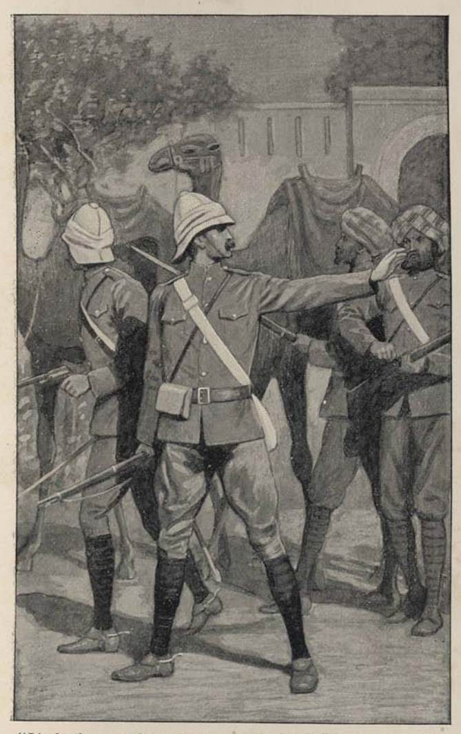
"Lively there, my boys; keep your rifles handy," he cried.—p. 261.