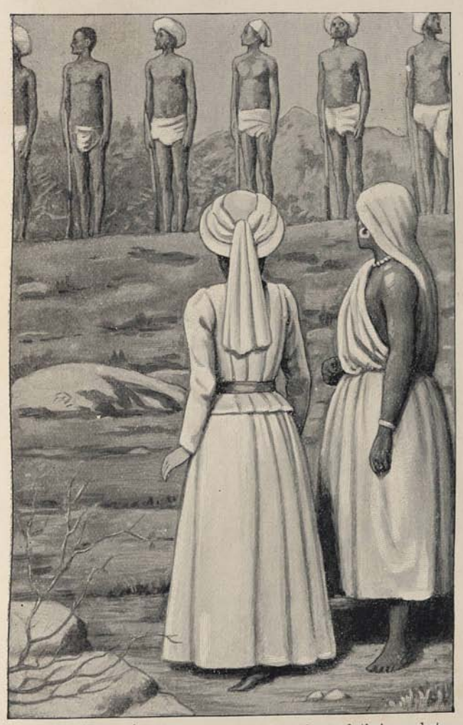
To their great surprise, every man of them dropped their muskets and stood stolid and still.—p. 89.