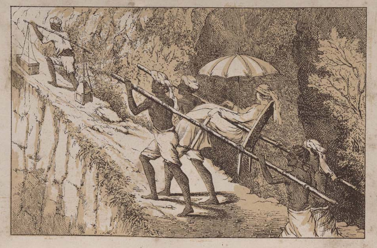
ASCENT OF THE SHEVAROYS.