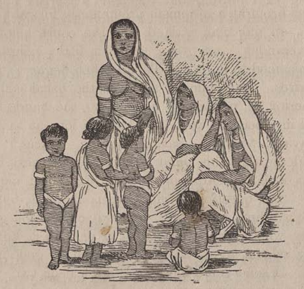
Native Ladies and Children.

"When we reached the baboo's house, we took our tiffin of sandwiches and fruit, in an empty room, and then went through the intricate passages and up the narrow dark stairs that characterize the zenana precincts, to what was really our afternoon's work. In this one house there are upwards of fifty souls, including the old grandfather and grandmother, great aunts, etc., all the sons and sons' wives, and all their children and grand-