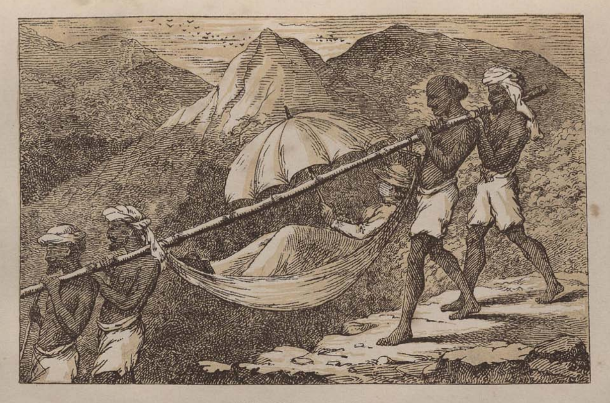
DESCENT FROM PARISNATH.