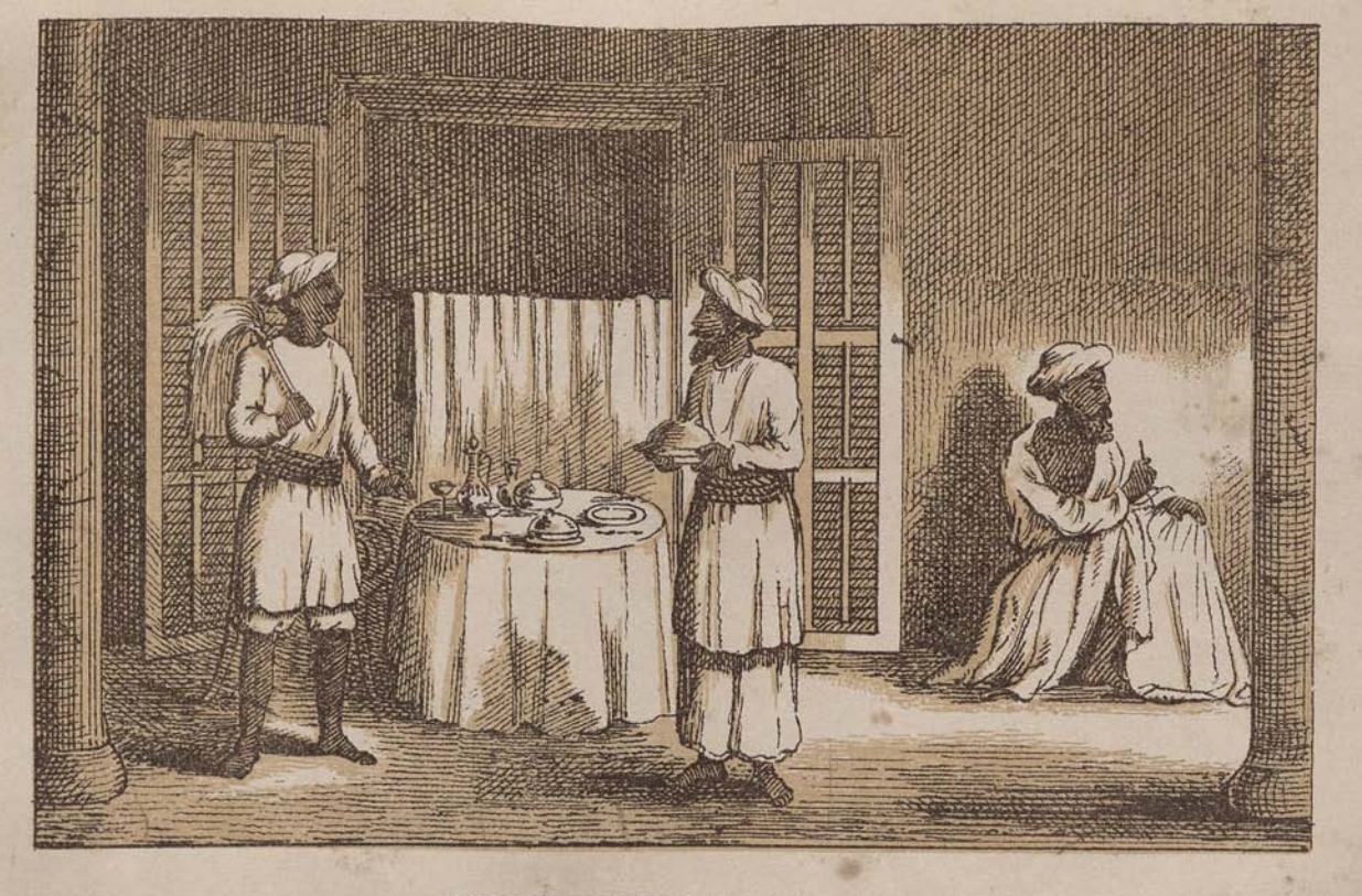
BEARER, KITMUTGHAR, AND TAILOR.