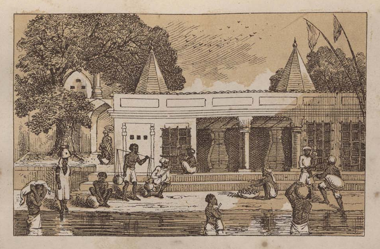
HINDOO TEMPLE AT MONGHYR.