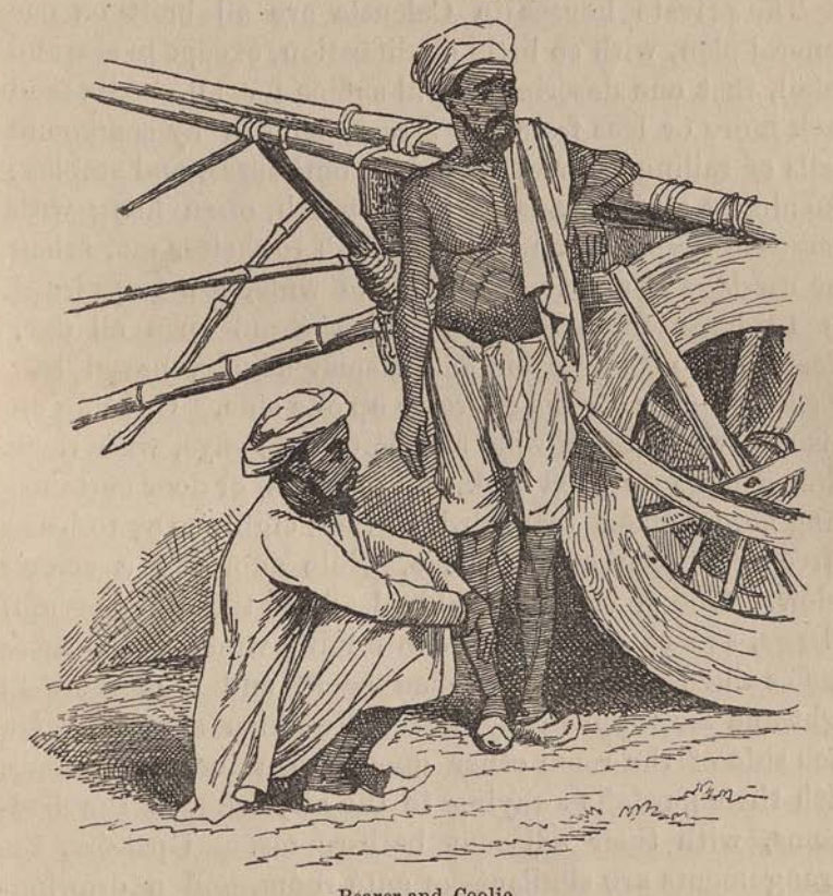
Bearer and Coolie.

instead of the nether garment he wears a piece of calico or muslin wrapped in a peculiar manner round the lower part of the body and reaching to the knee, and his upper vestment opens on the right instead of the left side of the breast. This clothing being all spotlessly white, contrasts well with their swarthy skins, and looks delightfully clean and cool. Many Europeans, however, adopt some modifi-