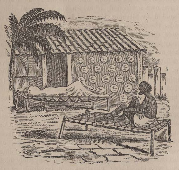
In Calcutta at noonday.

employments of a personal nature are carried on in the most crowded streets. One can scarcely drive through the town in the forenoon without seeing people squatting by the drains and brushing their teeth with a primitive instrument of split wood; others standing near a tank and pouring water over their heads till it streams from their limbs and garments, and then deliberately drying