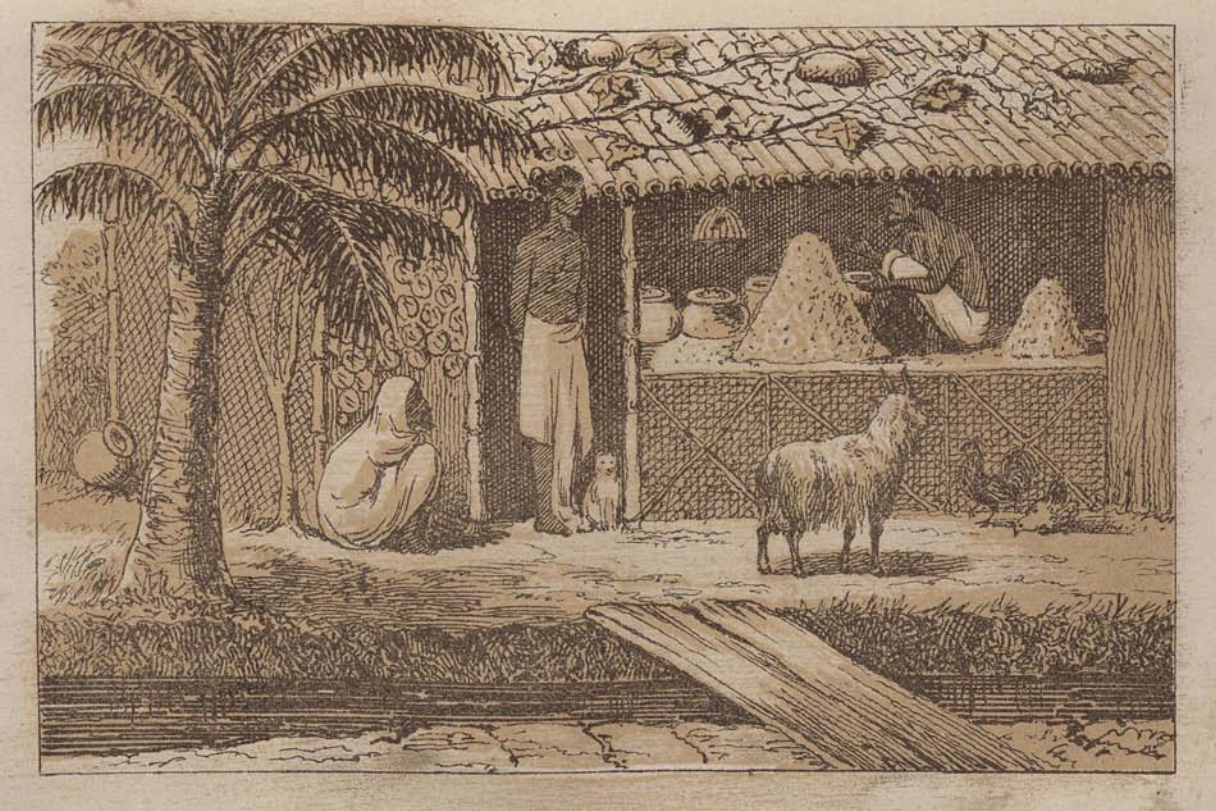
NATIVE SHOP IN KIDDERPORE BAZAAR.