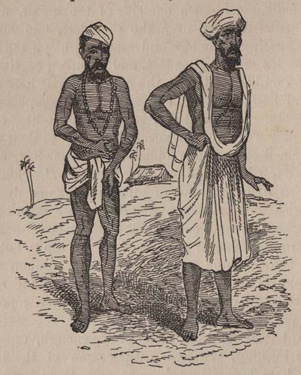
Coolie and Baboo.

and fowls mingle in the throng, walking in and out of houses at their pleasure. They often add to the bizarre