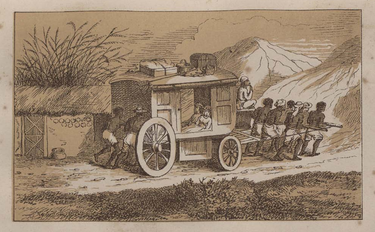
DAWK GHARRY DRAWN BY COOLIES.