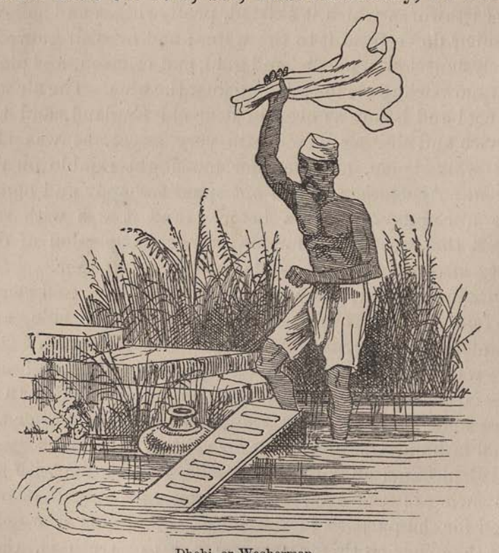
Dhobi, or Washerman.

what with luggage, bedding, and extra packing-cases filled with our purchases. It poured with rain when we started, and there was great difficulty in stowing ourselves and our goods in the exceedingly small hack vehicle that came for us. We were told that the train did not start till 3.45, but, most fortunately, we deter-